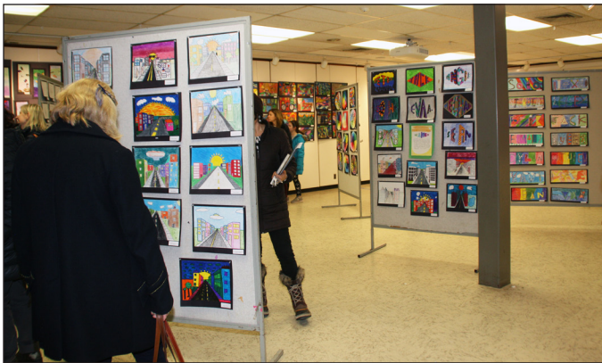
Middle School Art Show — Mt. Pleasant Public Library