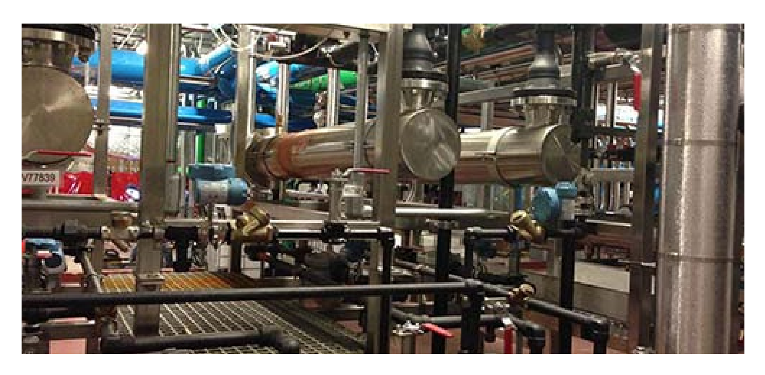
Figure 2. Wireless instruments can be used to monitor variables on equipment such as heat exchangers, pumps and piping systems.