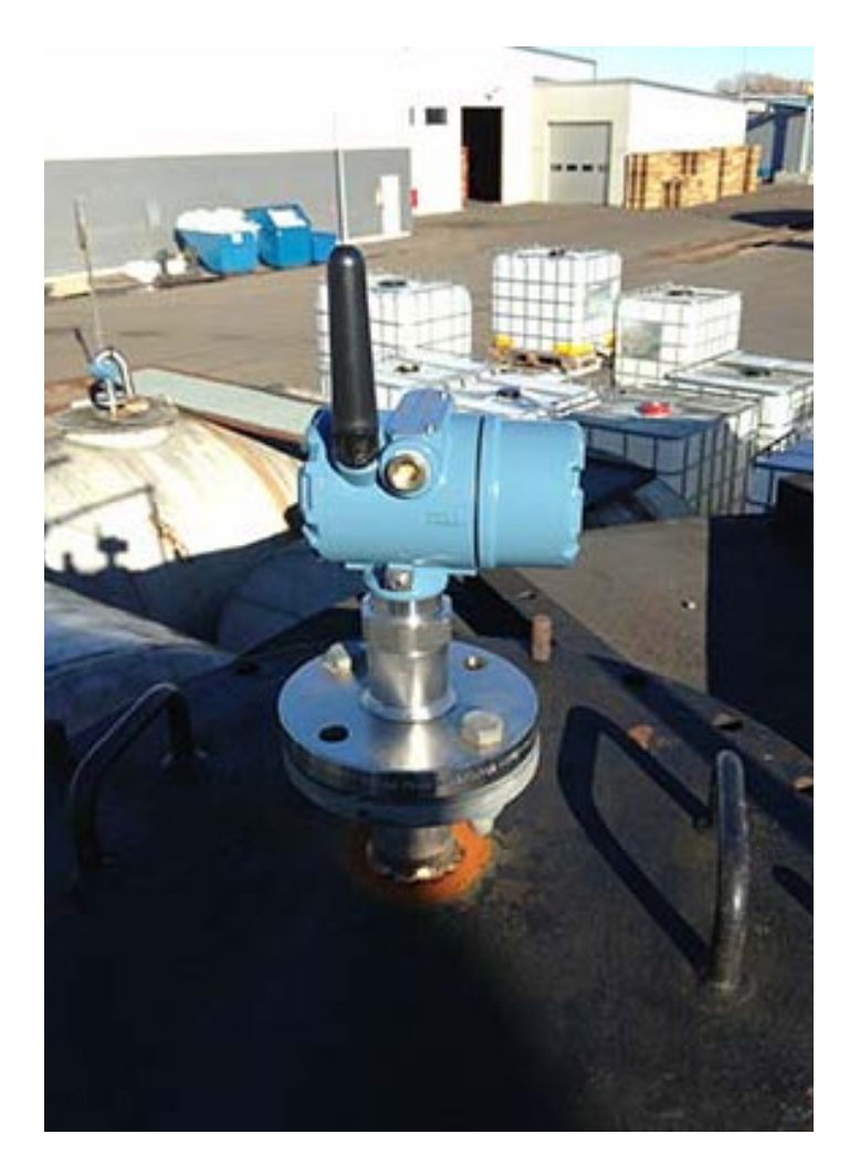
Figure 1. This wireless guided wave radar device is being used to measure tank level, an application particularly well suited for wireless as connecting a wired device would be difficult due to the hard to access location.

It's also helpful to describe categories of applications so the project team can visualize current and future wireless device system deployments. Table 1 lists leading wireless device application categories. One of these categories is illustrated in Figure 1, which shows a wireless guided wave radar device used to measure tank level, with the device mounted in a location where it would be difficult to connect a wired device.