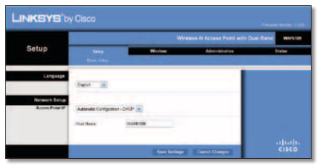
Setup > Basic Setup (Automatic Configuration - DHCP)

The first screen that appears is the Basic Setup screen. Use this screen to change the browser-based utility's language, or to change the Access Point's wired, Ethernet network settings.