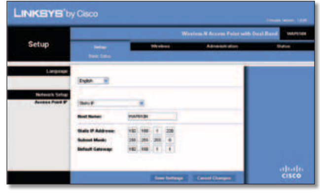
Setup > Basic Setup (Static IP)