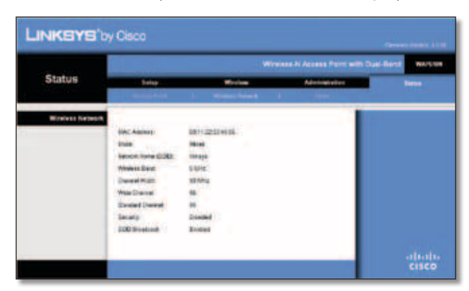
Status > Wireless Network

Information about your wireless network is displayed.