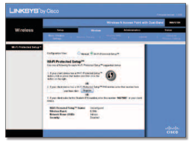
Wireless > Basic Wireless Settings (Wi-Fi Protected Setup)

Wi-Fi Protected Setup™ is a feature that makes it easy to set up your wireless network. If you have client devices, such as wireless adapters, that support Wi-Fi Protected Setup, then you can use Wi-Fi Protected Setup to configure wireless security for your wireless network. Otherwise, use manual setup (refer to "Basic Wireless Settings (Manual)" on page 4).