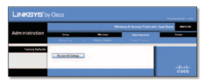
Administration > Factory Defaults

Restore All Settings To reset the Access Point's settings to the factory defaults, click Restore All Settings . Any settings you have saved will be lost when the default settings are restored.