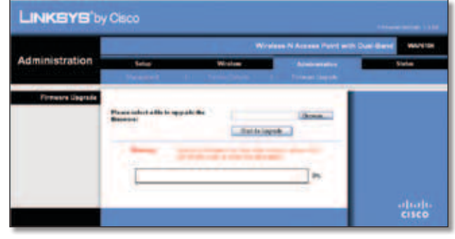
Administration > Firmware Upgrade

Use this screen to upgrade the Access Point's firmware. Do not upgrade the firmware unless you are experiencing problems with the Access Point or the new firmware has a feature you want to use.