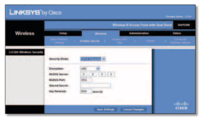
Security Mode > WPA2 Enterprise

This option features WPA2 used in coordination with a RADIUS server. (This should only be used when a RADIUS server is connected to the Access Point.)