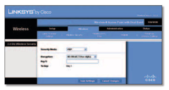
Security Mode > WEP

WEP is a basic encryption method, which is not as secure as WPA or WPA2.