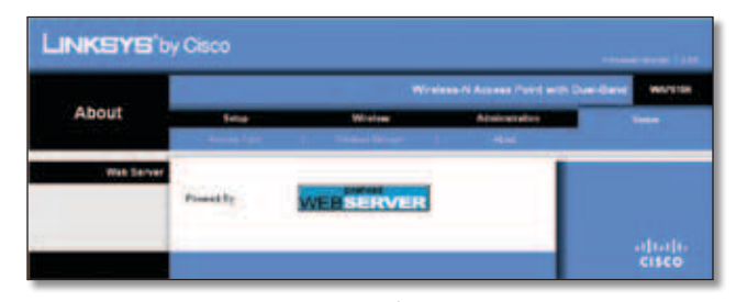
Status > About

Information about the browser-based utility is displayed.