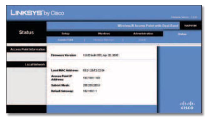
Status > Access Point

The Access Point's current status information is displayed.