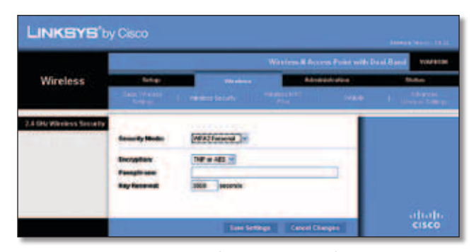
Security Mode > WPA2 Personal

WPA2 is a more advanced, more secure version of WPA.