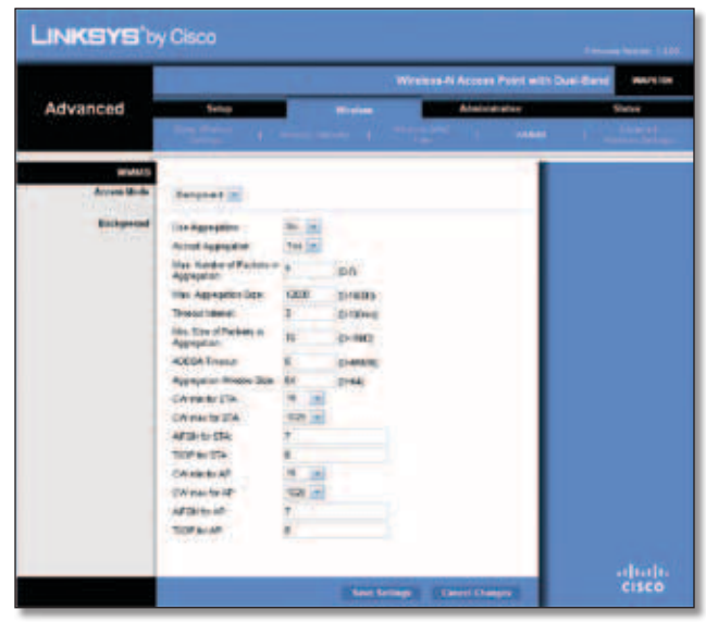
Wireless > WMM

Configure the Wireless MultiMedia (WMM) settings. WMM prioritizes packets depending on their respective access mode (traffic type): Background, Best Effort, Video, or Voice. These settings should only be adjusted by an expert administrator as incorrect settings can reduce wireless performance.