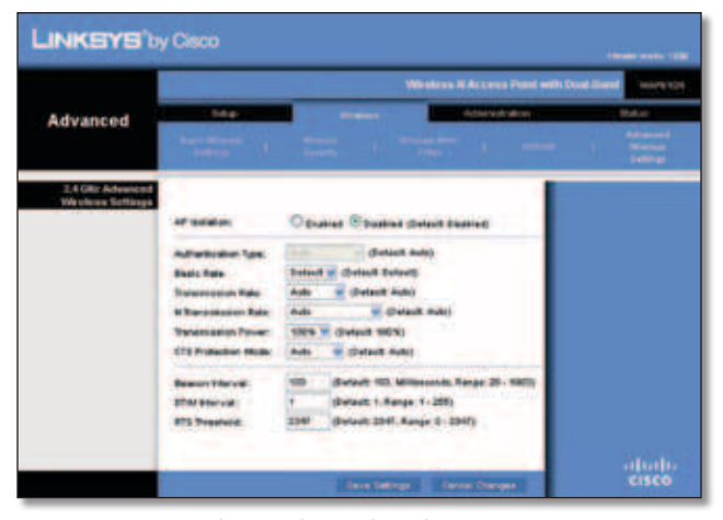
Wireless > Advanced Wireless Settings

Configure the Access Point's advanced wireless functions. These settings should only be adjusted by an expert administrator as incorrect settings can reduce wireless performance.