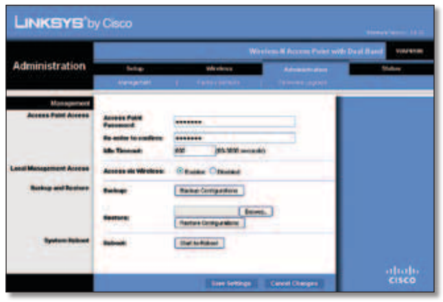
Administration > Management

Use this screen to manage specific Access Point functions: access to the browser-based utility, backup of the configuration file, and reboot.