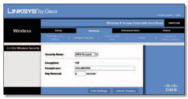
Security Mode > WPA Personal

WPA is a security standard stronger than WEP encryption.