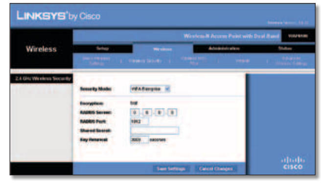
Security Mode > WPA Enterprise

This option features WPA used in coordination with a RADIUS server. (This should only be used when a RADIUS server is connected to the Access Point.)