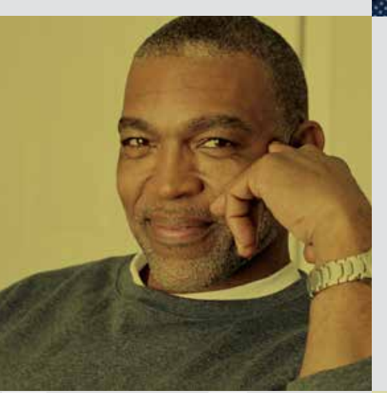
1-800-WIS-VETS | WisVets.com