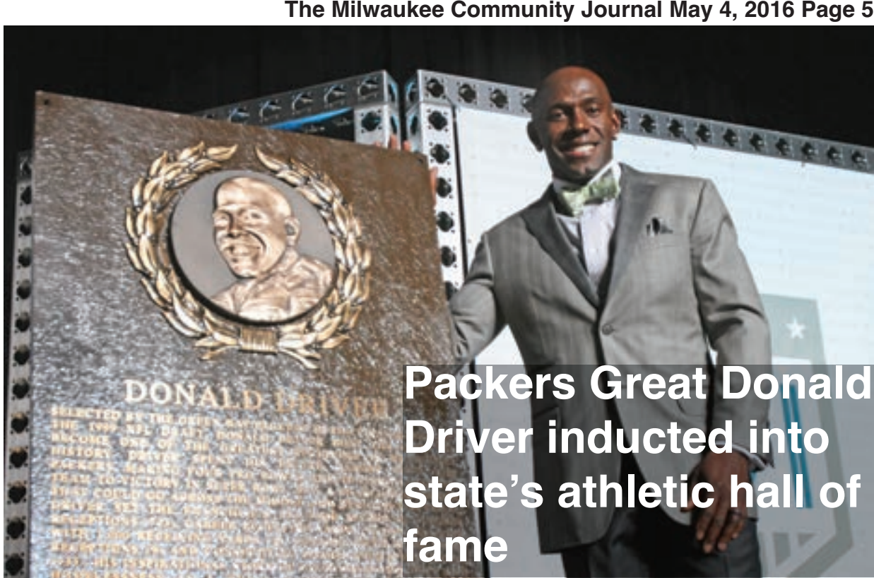
Packers Great Donald Driver inducted into state's athletic hall of fame