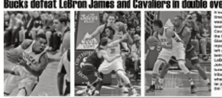
Bucks defeat LeBron James and Cavaliers in double overtime! It took two games, three for the Milwaukee Bucks to beat the Cleveland Cavaliers recently at the Bradley Center. Giannis Antetokounmpo (pictured left and right) being defended by LeBron James and John Henson (pictured center) contributed to the team's win with their stellar play.