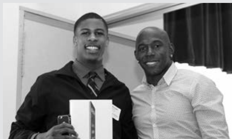
Former Green Bay Packers great Donald Driver congratulates one of the student attendees of the program who won an Apple iPad, one of the items raffled off during the event. Driver gave a motivational speech in which he shared his personal story of success and encouraged the students to achieve their dreams.

He then raffled Dell laptops, Microsoft Surface 3 laptops and Apple iPads provided by Associated Bank.