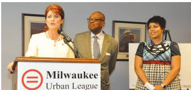
Lt. Gov. Kleefisch announces the awarding of funds for the construction of affordable housing throughout the state, including Milwaukee, which will get funds for nine local construction projects, which includes the Historic Garfield Redevelopment Phase 1.

One of nine city projects and 28 projects state wide to be awarded $14 million in low-income housing tax credits to fund affordable housing developments