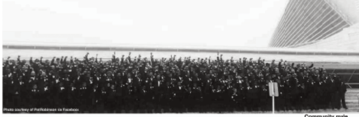
Community male youth initiative "We Got This" holds second 500 Black Tuxedo Walk that showcases the best of our Black male youth Beginning with hundreds at Easting Hotel, 1300 W. Field St. and ending "tuxedo and tuxedo" at Northside Neighborhood House, hundreds of Black young men spent a day interacting with other Black men during the second 500 Black Tuxedo Walk. The group took official photos at the Milwaukee Art Museum and—in an impressive show of positivity, unity and brotherhood—took a short walk to Chic Café, where they dined and listened to numerous community leaders, including Mayor Tom Barrett, encourage them to reach for the stars and be the best they can be. The event was organized by Angelo Lee Ellis as part of the "We Got This" campaign, whose mission is to "incorporate the 'neighbor' back into our 'hoods' and create a real sense of neighborhood," according to the group's website. Parts of this article courtesy of Joe Vito, Milwaukee Neighborhood News Service.