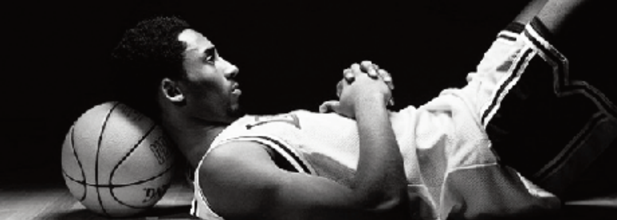
KOBE BRYANT'S CATHOLIC FAITH HELPED HIM THROUGH DARK DAYS IN THE EARLY 2000S

Article courtesy of Worldreligionnews.com