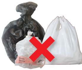
plastic bags & film