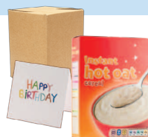
Cardboard, clean food packaging, boxes and cards