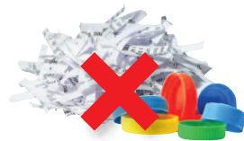
small items (under 4cm)