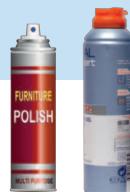
Empty aerosols - no paint, fertilizer or weed killer