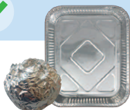
Aluminium foil and trays - roll foil into a ball