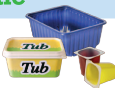
Plastic yoghurt pots, tubs and food trays