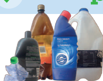
Plastic bottles - empty, wash, squash and lid on