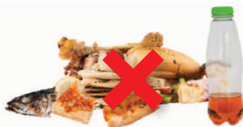
food & drink