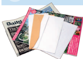
Paper, newspapers, magazines and junk mail