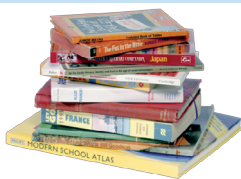
Books, paperback and hardback