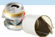
Food and drinks cans