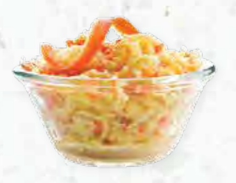
REFRIGERATED DELI SIDES