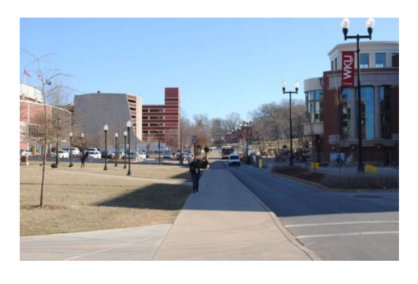
Turn right and follow the side walk. You will soon see Diddle Arena on your left . At Diddle Arena, gather around the statue.