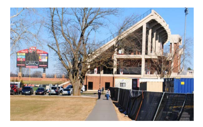
Facing the statue, turn right and follow the sidewalk to the football stadium. Cross the road at the intersection outside of the football stadium.