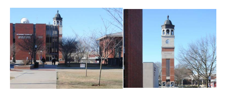
Follow the sidewalk down toward the Guthrie Bell Tower. On your left, you will pass Minton Hall, the honors dorm, as well as the Academic Complex.

Inside, you can see several murals displaying the WKU spirit as well as another Big Red Statue. You may also go down to the Ground Floor of the building and visit the WKU Bookstore.