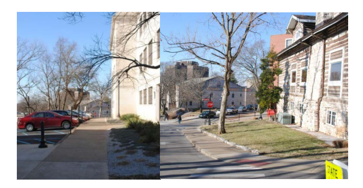
Follow the sidewalk directly to the left of Cherry Hall. Pass the log building and cross the intersection to take a right toward the library