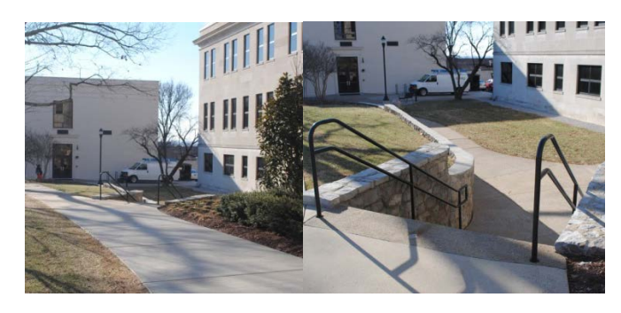
Facing Cherry Hall, follow the sidewalk to the left of the building and go down the stairs