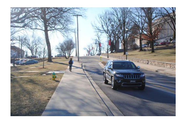
Keep walking up the hill until you see Cherry Hall on the right. Cross the intersection and gather at the statue.