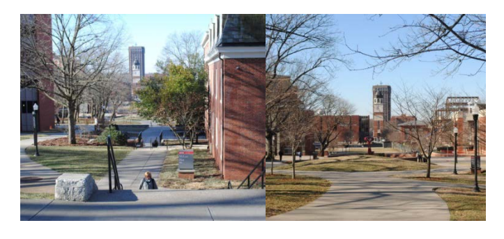
Continue walking down the hill. Go down two staircases toward Centennial Mall, which is the center of campus.

The red statue called "Centennial" commemorates 100 years of unwavering dedication to higher education at WKU.