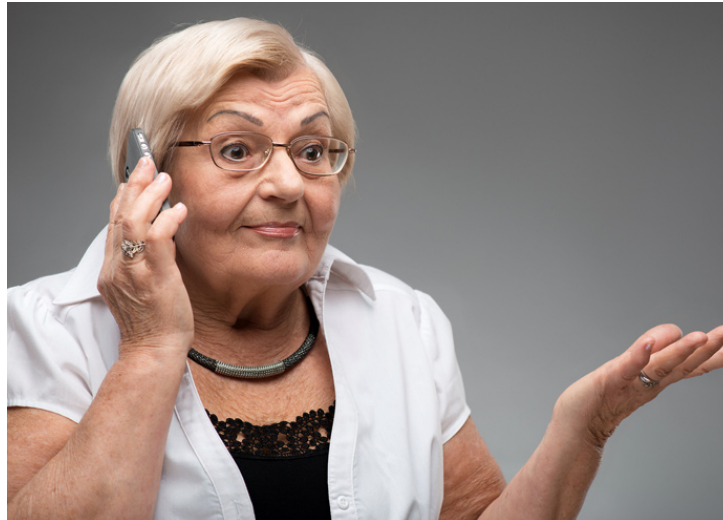
"My favorite grandson? I'll need a whole lot more information."

Never wire money to someone you don't know. It's the same as handing over your cash.