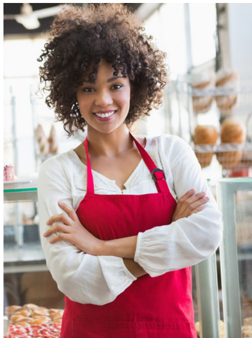
"I'm learning how to run a small bakery."

Clearly, Gen Zers grew up in an age of shorthand writing. But the abbreviations, emoticons and lack of punctuation that work well for them on social media may not work in every workplace. They'll