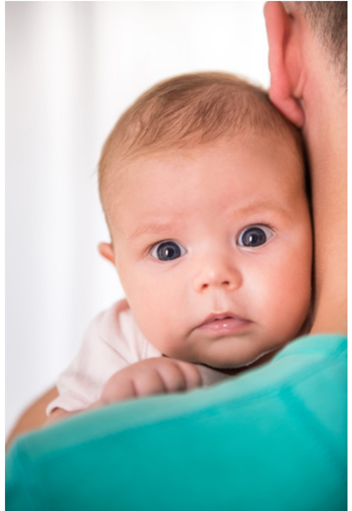
Dads these days are right there with moms as daily caregivers.