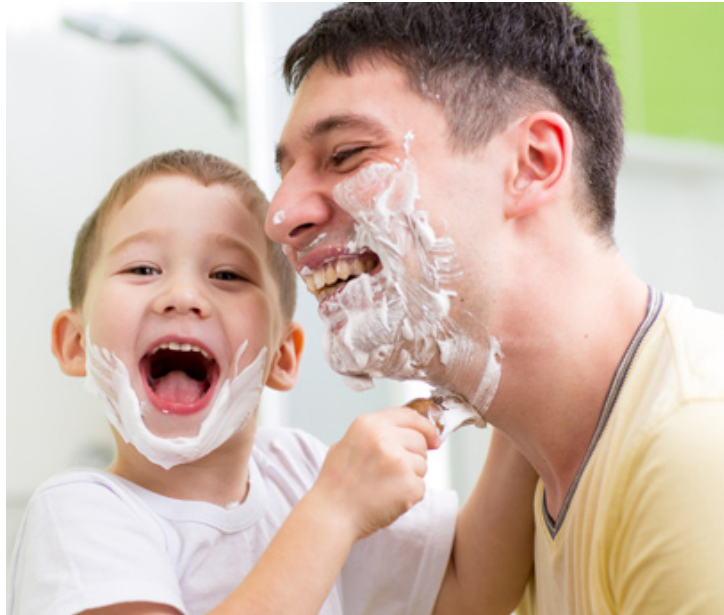
Who knew helping Dad shave could be so much fun?

■ Moms tend to pick up their infants the same way over and over (usually to care for them). Dads, on the other hand, often pick up their kids to do something with them—and they pick them up differently each time.