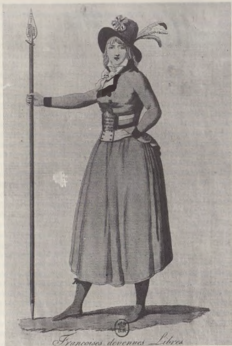
Figure 5.2 Anonymous engraving, probably issued during the summer of 1792. The engraving bears the caption “French women [who] have become free,” and depicts a woman who boldly faces the viewer, conspicuously displaying on her hat the tricolor cockade, symbol of French liberty. She bears a pike inscribed with the motto: Liberty or Death. A medal attached by a tricolor band to her waist, is inscribed with the motto: “Libertas Hastata Victrix! 14 Juillet” (“Liberty [when she is] armed with her pike [is] victorious!” 14 July.). Contemporaries may have associated this figure either with Pauline Leon who had publicly expressed her determination to fight, pike in hand, during the journée of August 10, or with her equally militant friend, Claire Lacombe, whom the fédérés decorated with a tricolor sash for her role during this journée .

of Liberty onto the costume of his female subject; imprints her weapon with the watchword of a militant, virtuous citizenry: “Liberté ou La Mort”; and by means of the title “Françaises devenues Libres” links female militancy to women’s revolutionary emancipation. In the light of these radical formulations, the women, armed and unarmed, who marched on April 9 and 15, not only symbolized a united national family in arms; they also dramatized principles of women’s militant citizenship. This massive mobilization of a “passive” citizenry, strengthened by myths of a united and mighty national family, inverted Marat’s images of families martyred on the Champ de Mars and contributed to consolidating the popular force that brought down the monarchy.