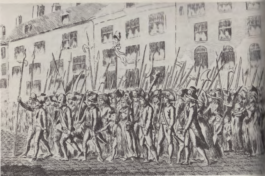
Figure 5.3 Anonymous, "Celebrated Journée of 20 June 1792." Engraving from Révolutions de Paris (Vol. 12, No. 154, 6–23 June 1792). The accompanying caption reads: "Reunion of Citizens from the Faubourgs St. Antoine and St. Marceau en route to the National Assembly to present a petition, followed by another [petition] to the king." Women armed with swords and pikes are shown marching with their families and neighbors in arms and accompanied by National Guardsmen.

tional definitions of citizenship that democratized and "universalized" political rights of citizenship for men—access to political office, the suffrage, the right to bear arms in the National Guard and other armed forces—while underscoring women's political "passivity" and further validating the gendered models of nature, citizenship, and virtue that rationalized it. In 1792 and for more than another year, these exclusive definitions coexisted with behaviors that occasionally all but cancelled them out; in any case, this discourse did not have a decisive impact on women's escalating militancy.