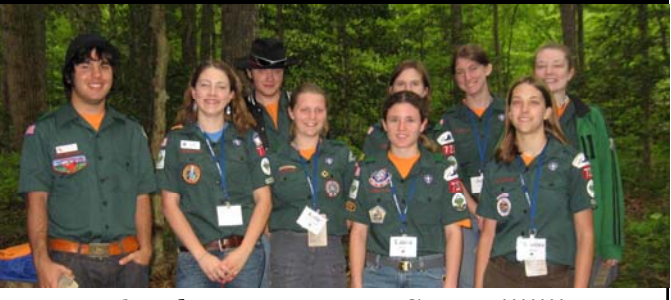
Thank You Venture Scouts!!!!!!!