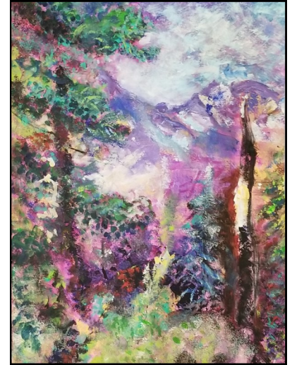
Painting done by Dmitry Pesko