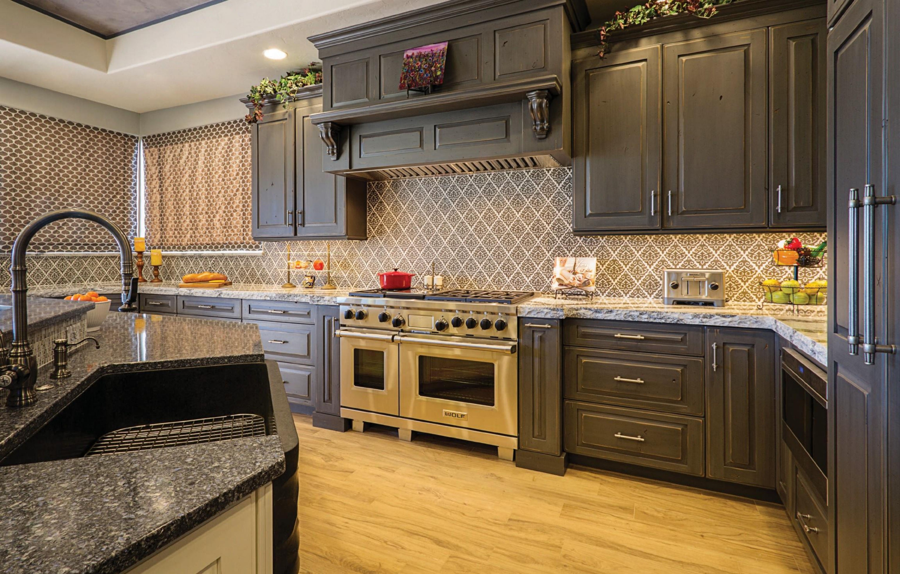
Portsmouth door, D-edge shape, Manor Raised drawer, Knotty Alder, Sawyer Smoke Stack (Frameless)