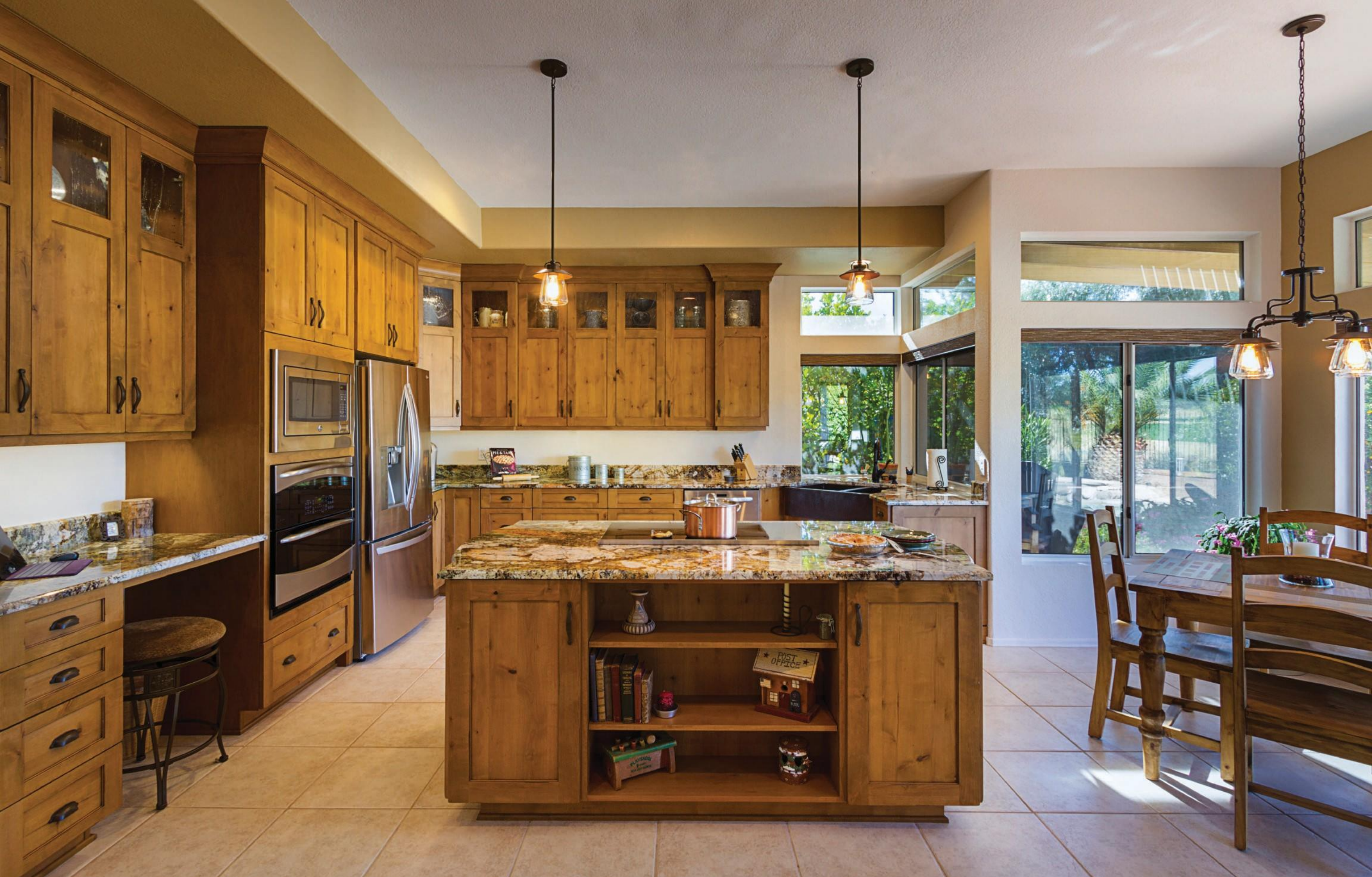
Seabrook door, S-edge shape, Manor Flat drawer, Knotty Alder, Rustic Timber (Frameless)