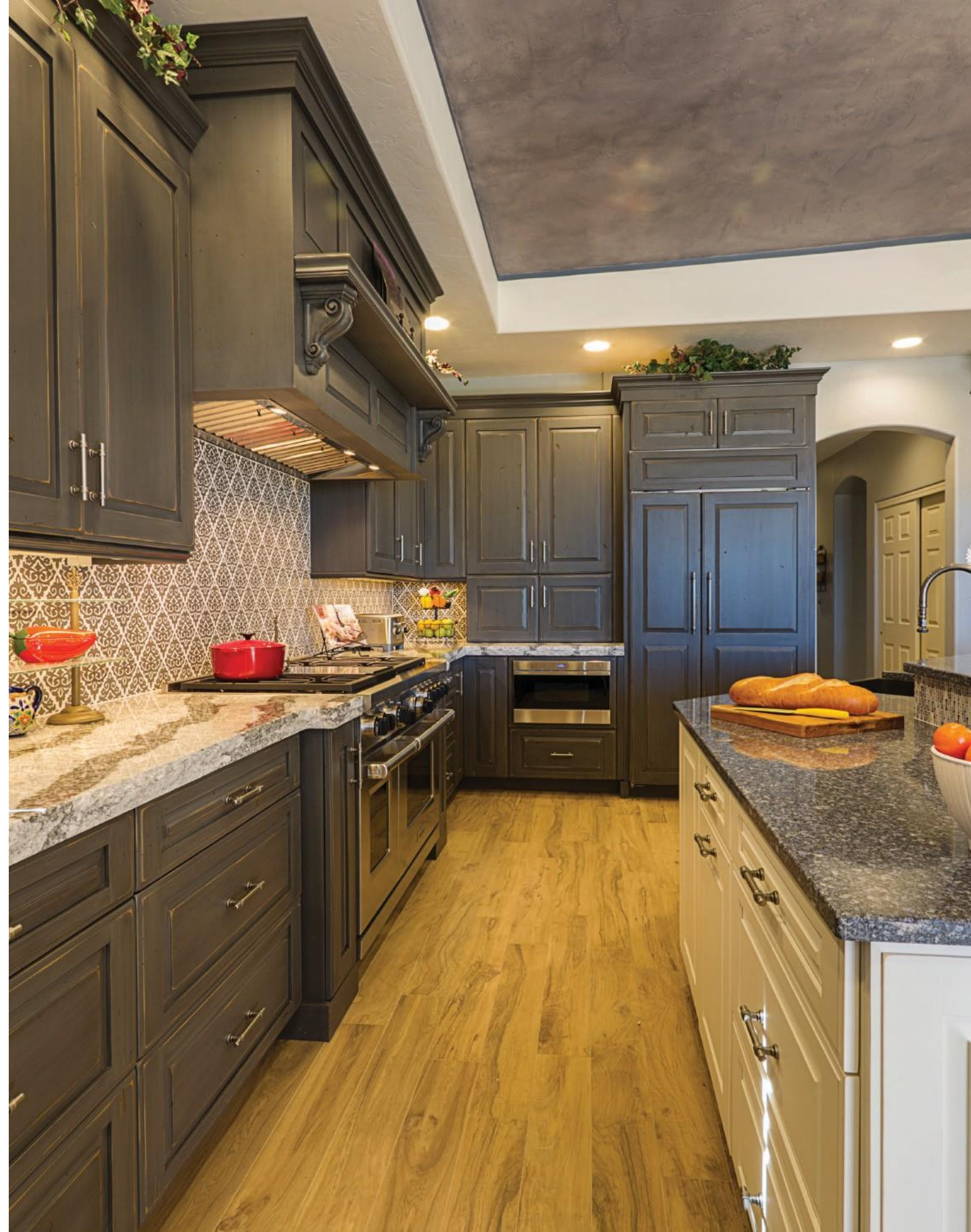
Portsmouth door, D-edge shape, Manor Raised drawer, Knotty Alder, Sawyer Smoke Stack Island: Portsmouth door, D-edge shape, Manor Raised Drawer, Maple, Heritage White