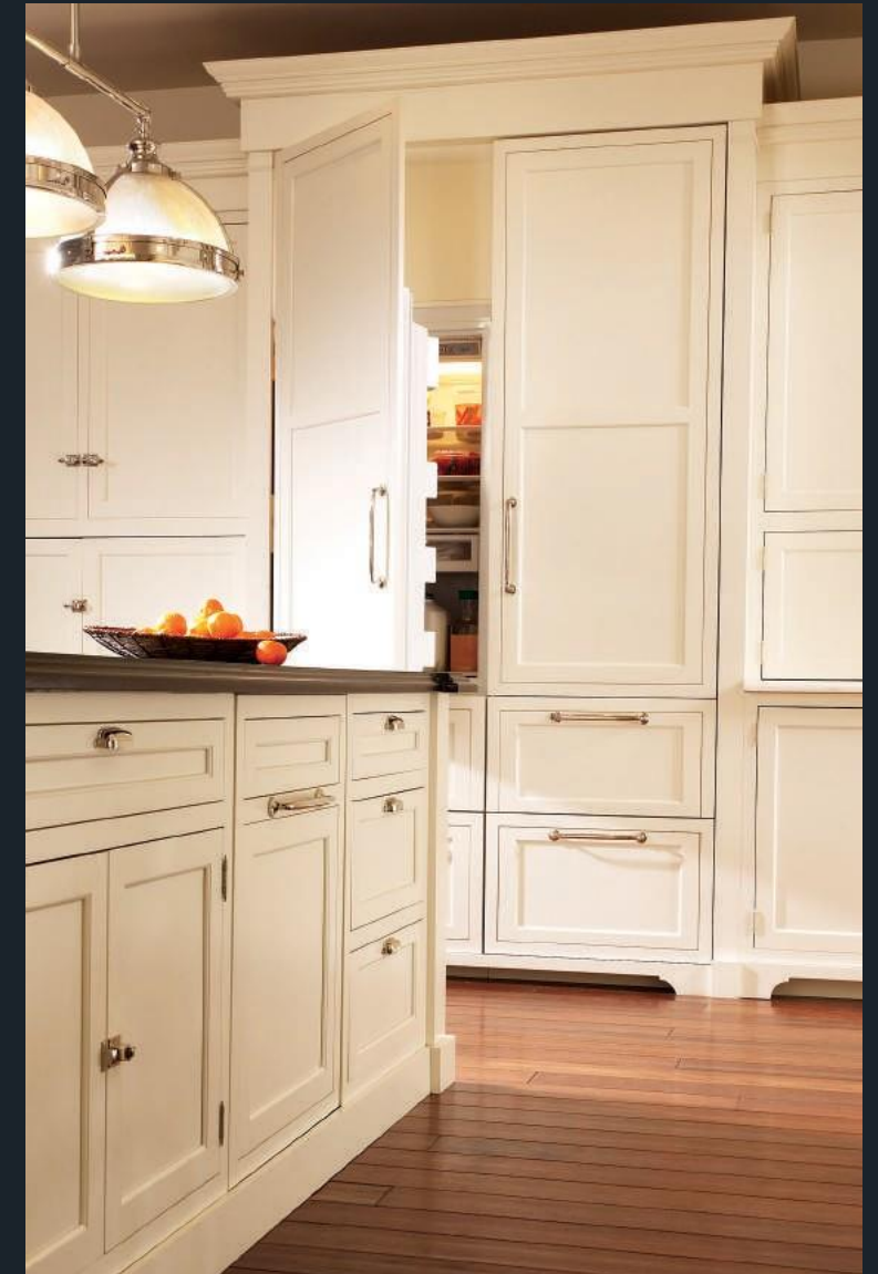
Integrated Appliance Panels