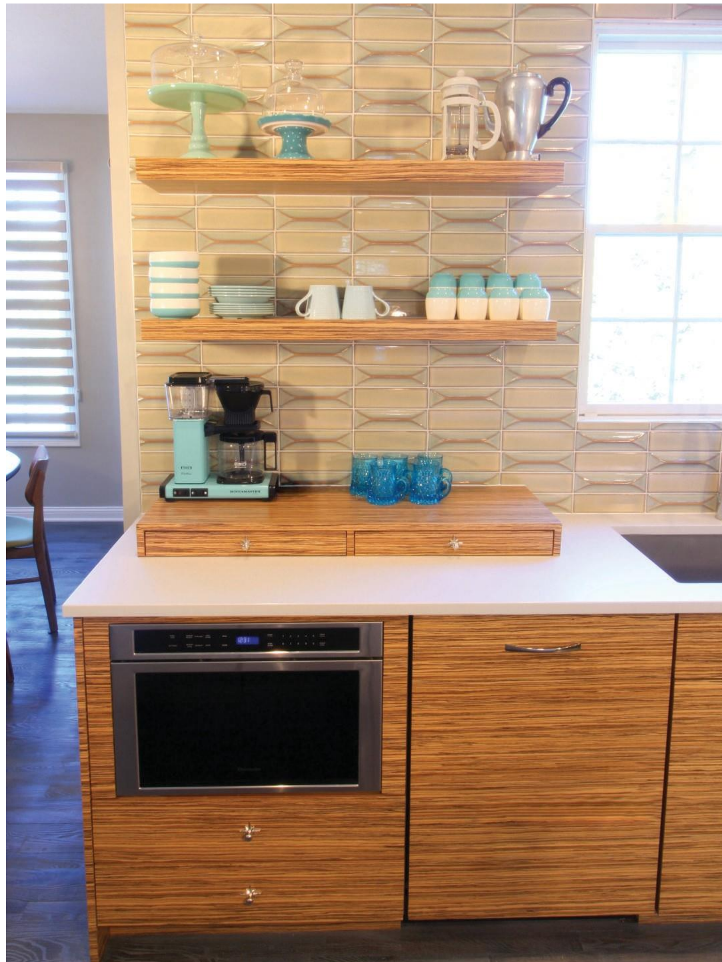
West End Elite door, Unique edge shape, Slab drawer, Reconstituted Zebrawood, Natural