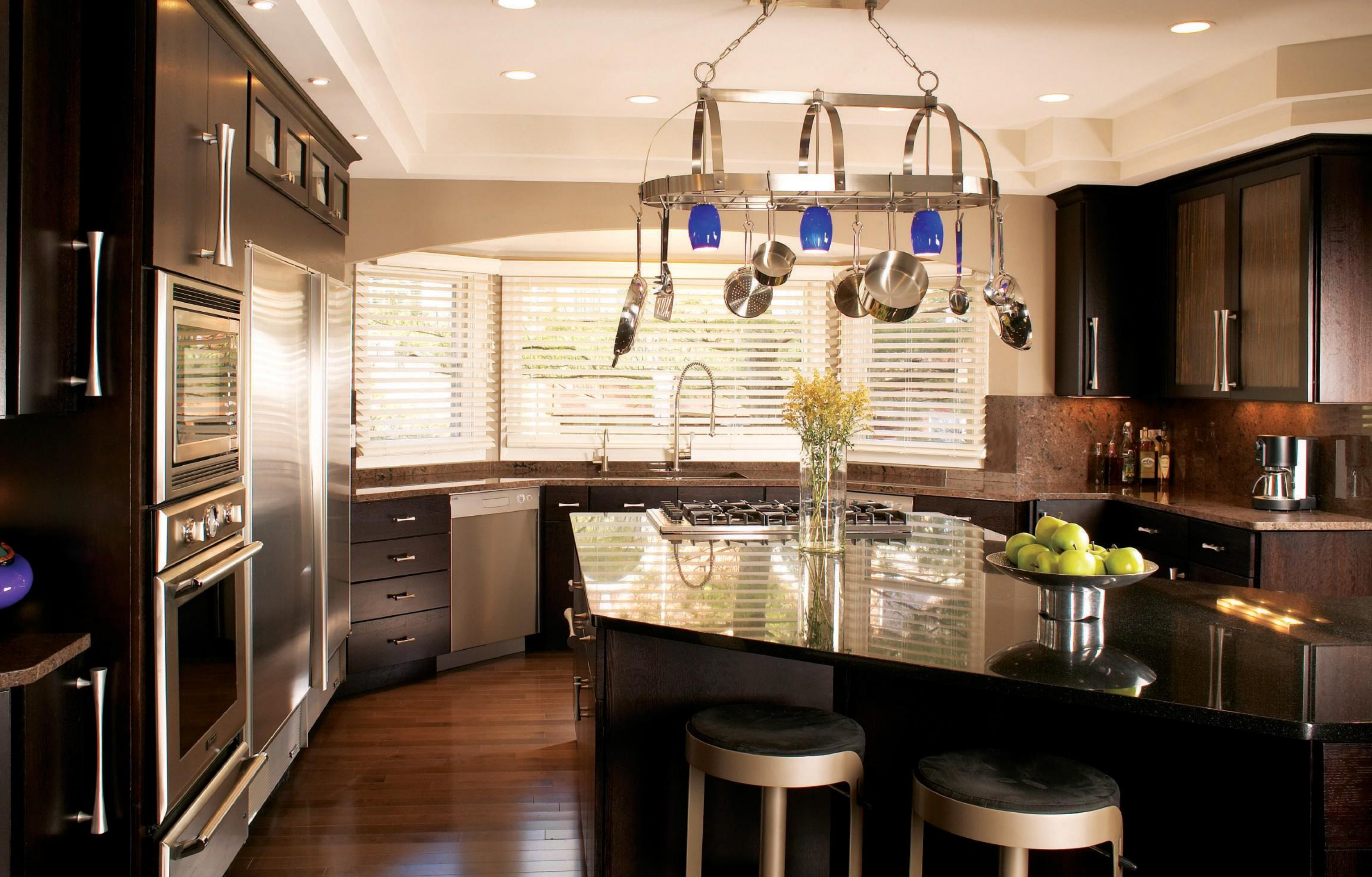
Cameron door, A-edge shape, Slab drawer, Quarter Sawn White Oak, Espresso (Full Overlay)