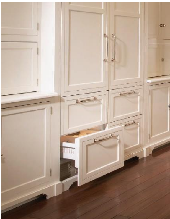
Integrated Appliance Panels