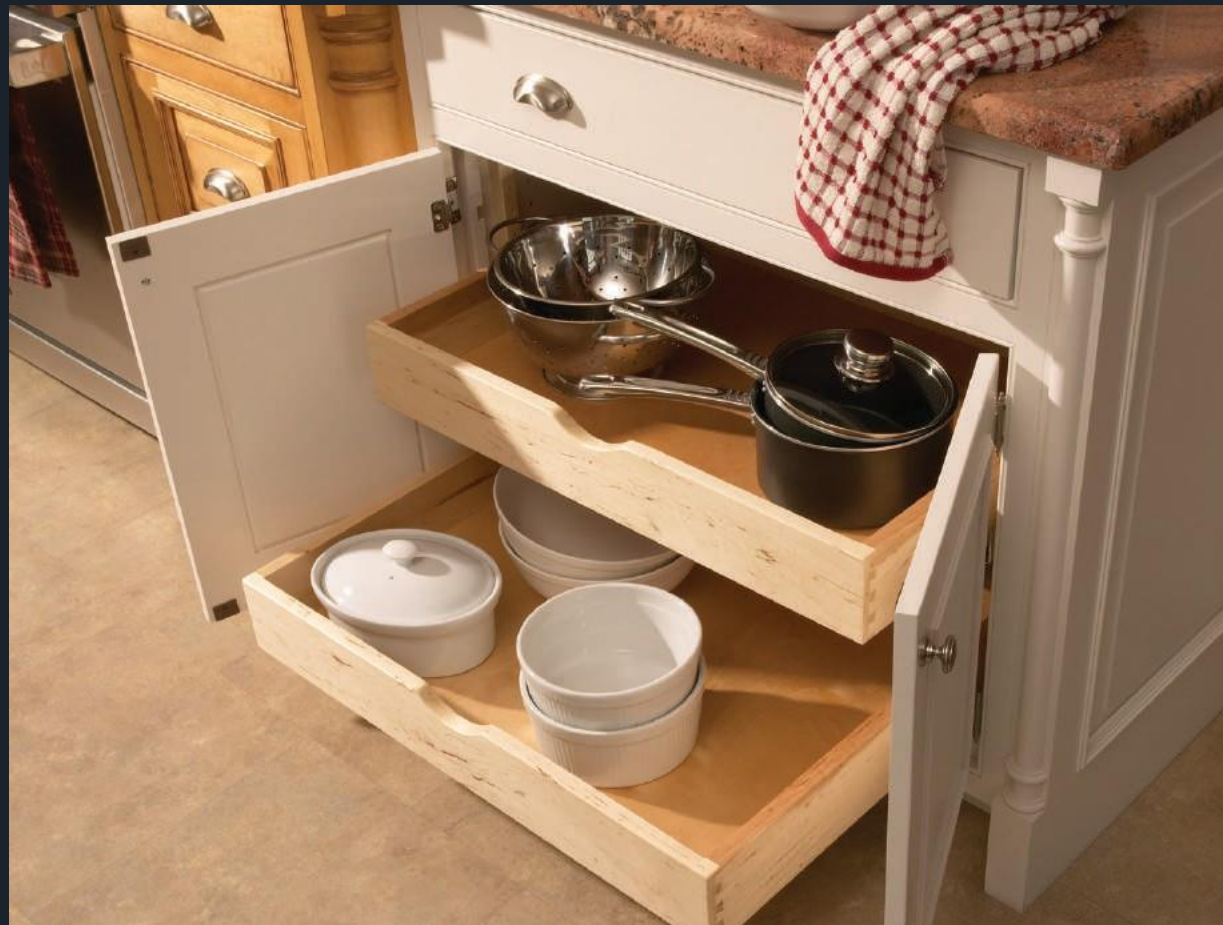
Maple Roll-Out Shelves