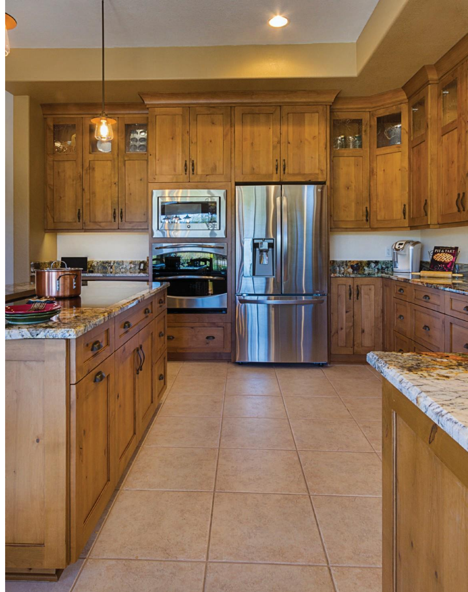
Seabrook door, S-edge shape, Manor Flat drawer, Knotty Alder, Rustic Timber