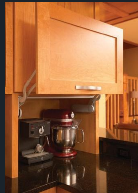
Appliance Garage Lift Up System