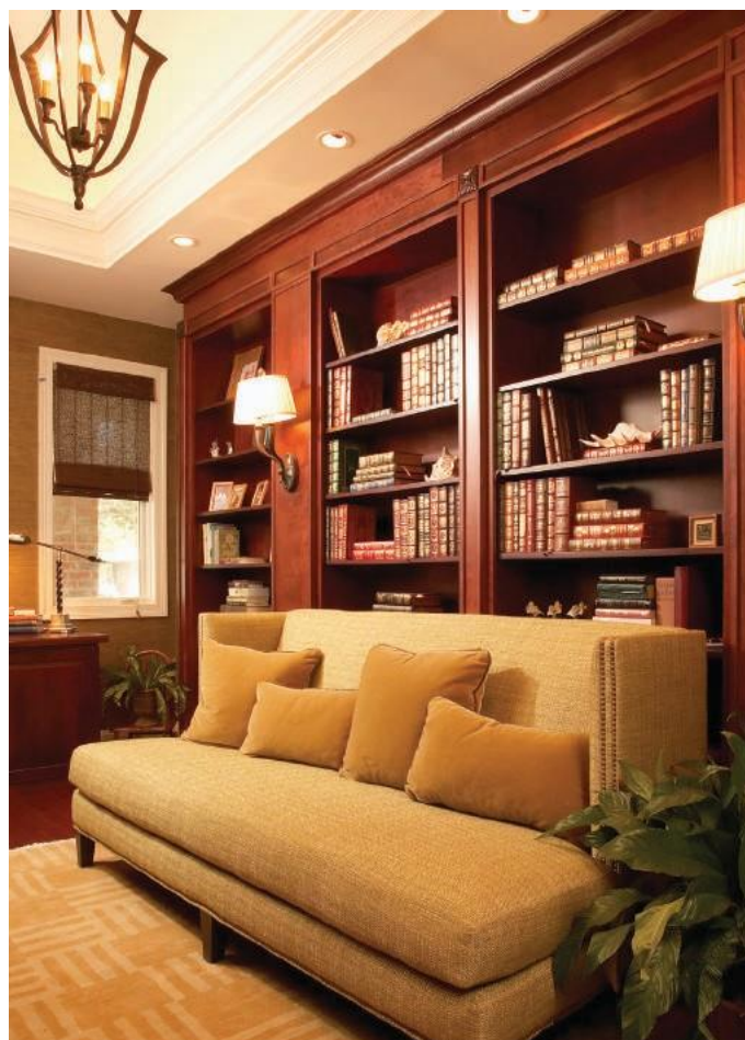
Cherry, Vineyard library shelves