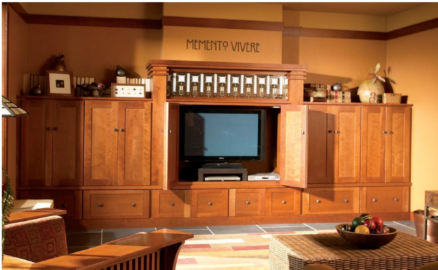
Seabrook door, Prairie profile, S-edge shape, Manor Flat drawer, Cherry, Clove