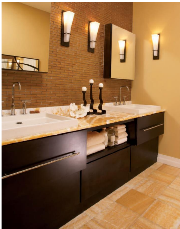
Cameron door, A-edge shape, Slab drawer, Cherry, Espresso