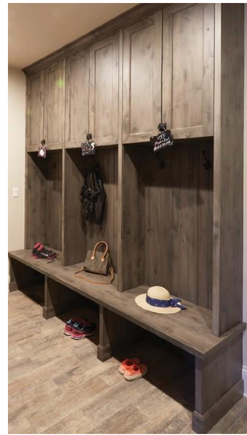
Seabrook door, Double Hip profile, A-edge shape, Knotty Alder, Weathered Silverwood (Frameless)