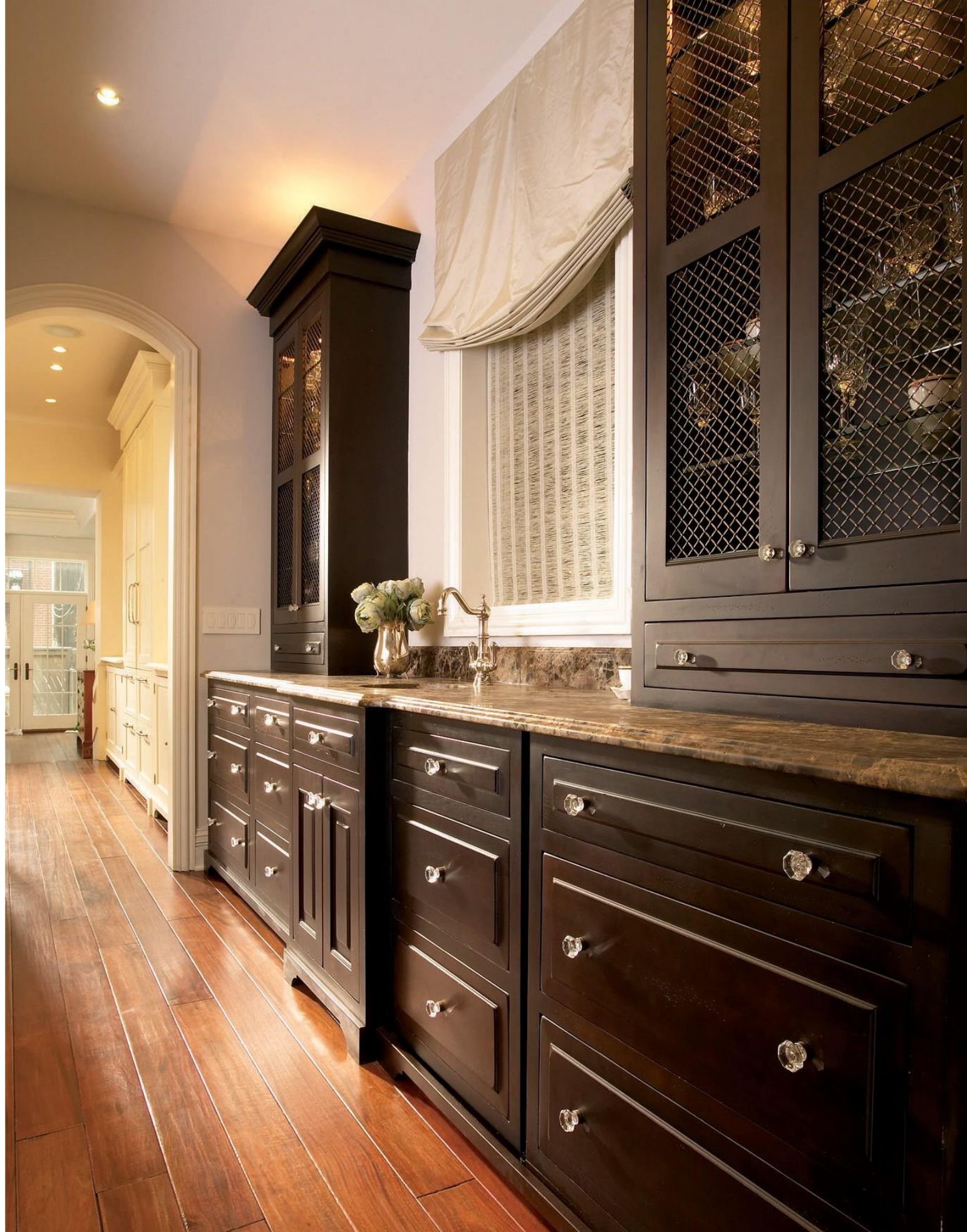
Chateaux door, A-edge shape, Classic drawer, Cherry, Espresso (Flush Inset)