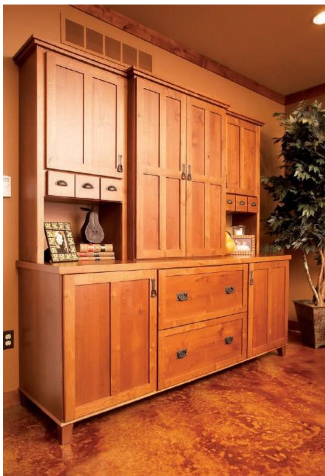
Seabrook door, Prairie Profile, A-edge shape, Manor Flat drawer, Knotty Alder, Clove