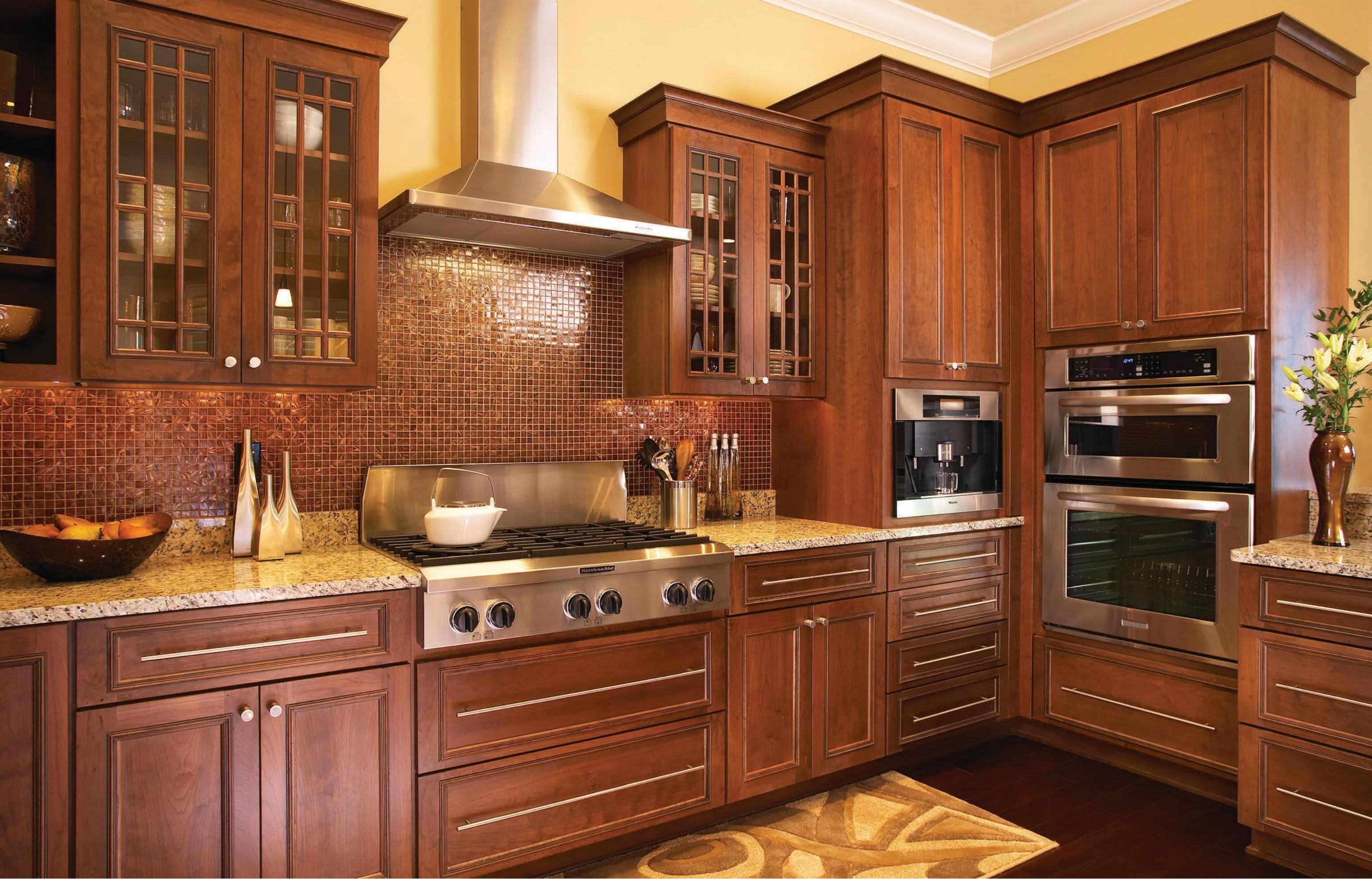
Somerlake door, Standard Hip profile, A-edge shape, Manor Flat drawer, Cherry, Walnut/Black Glaze (Full Overlay)

Design by: Mike May, Woodharbor Design Showroom