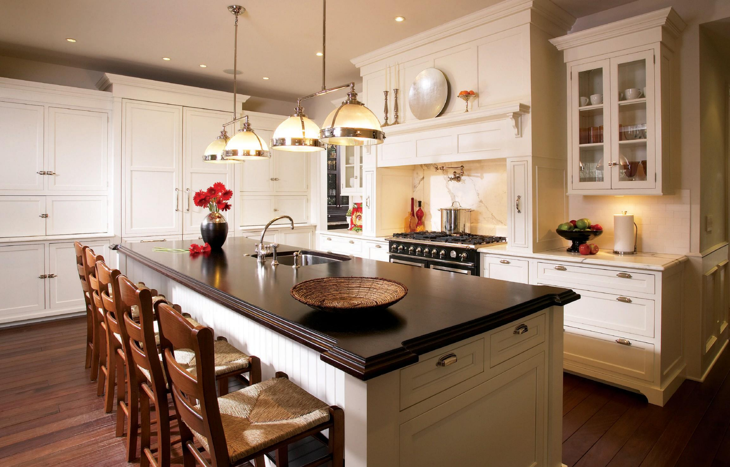
Madison door, Standard Hip profile, A-edge shape, Manor Flat drawer, Coastal White (Flush Inset)