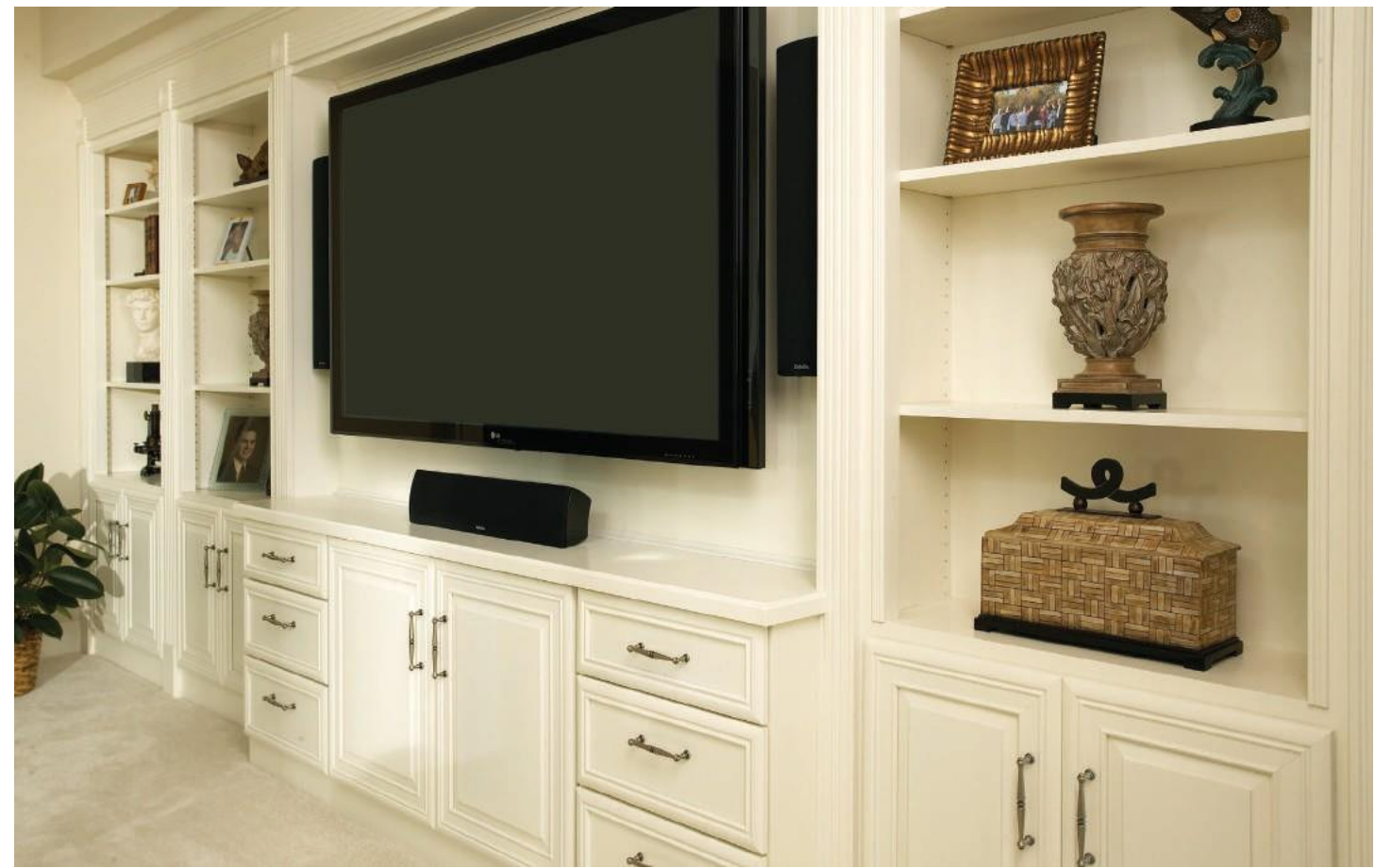
Georgetown door, Unique edge shape, Manor Flat drawer, Coastal White