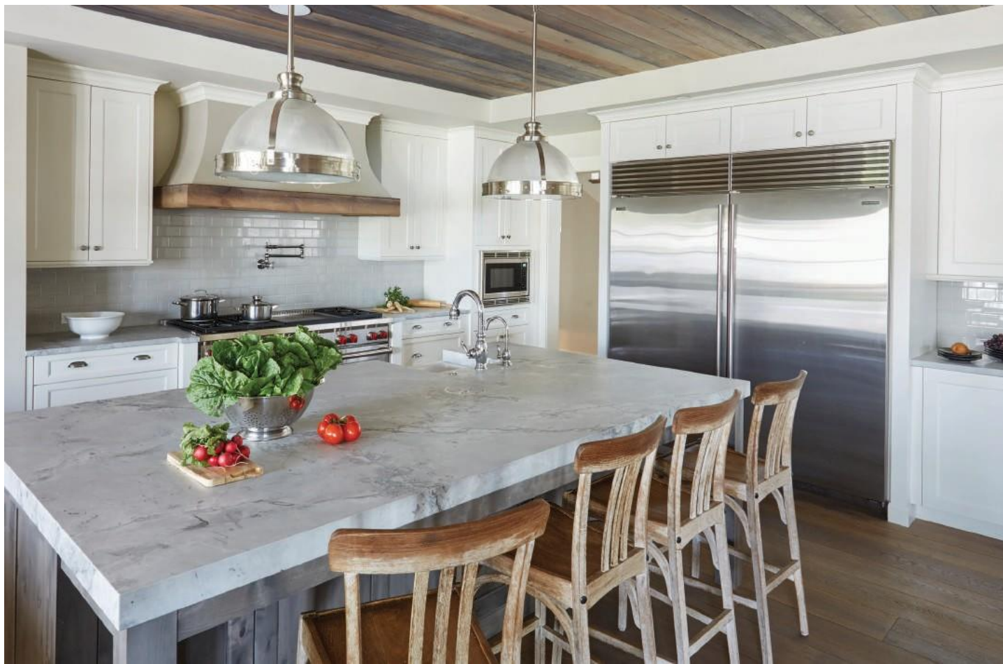
Perimeter Cabinetry: Oxboro door, A-edge shape, Manor Flat front, Maple, White Dove Island: Oxboro door, A-edge shape, Manor Flat drawer, Knotty Alder, Weathered Silverwood