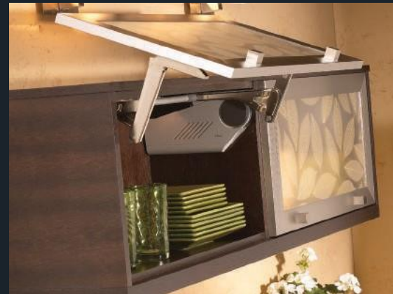
Up and Over Lift System