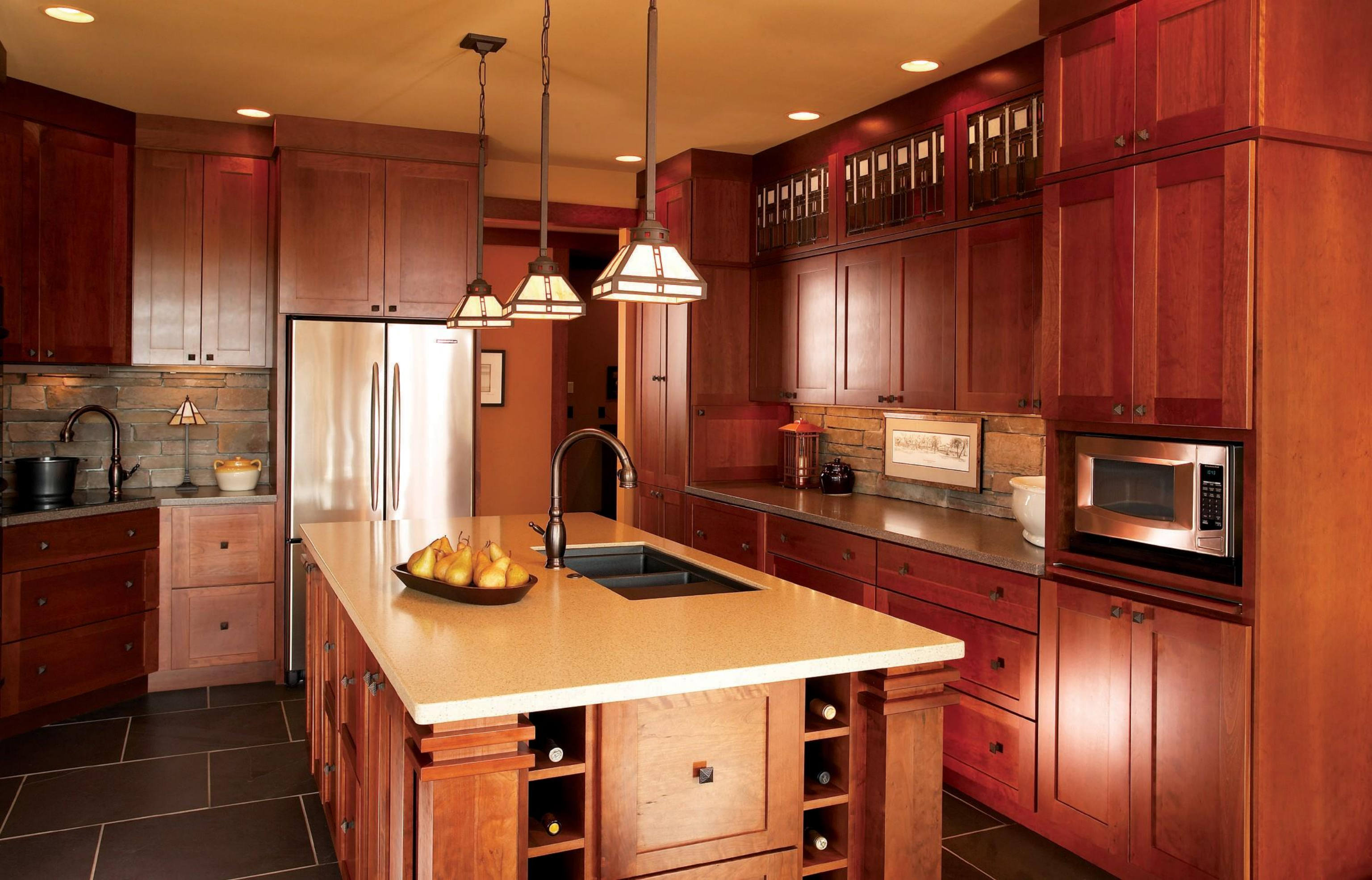
Seabrook door, Prairie profile, S-edge shape, Manor Flat drawer, Cherry, Clove (Full Overlay)