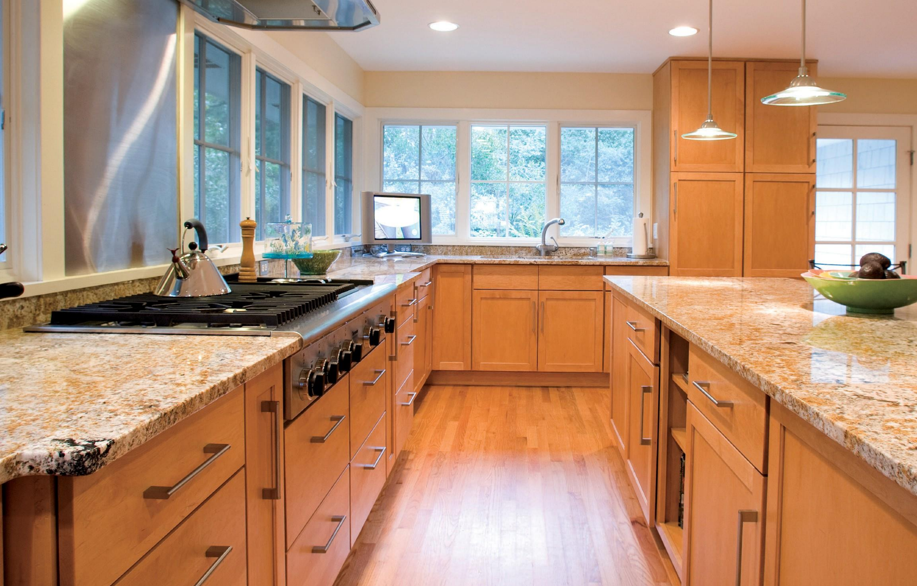
Madison door, A-edge shape, Slab drawer, Maple, Honey (Full Overlay)