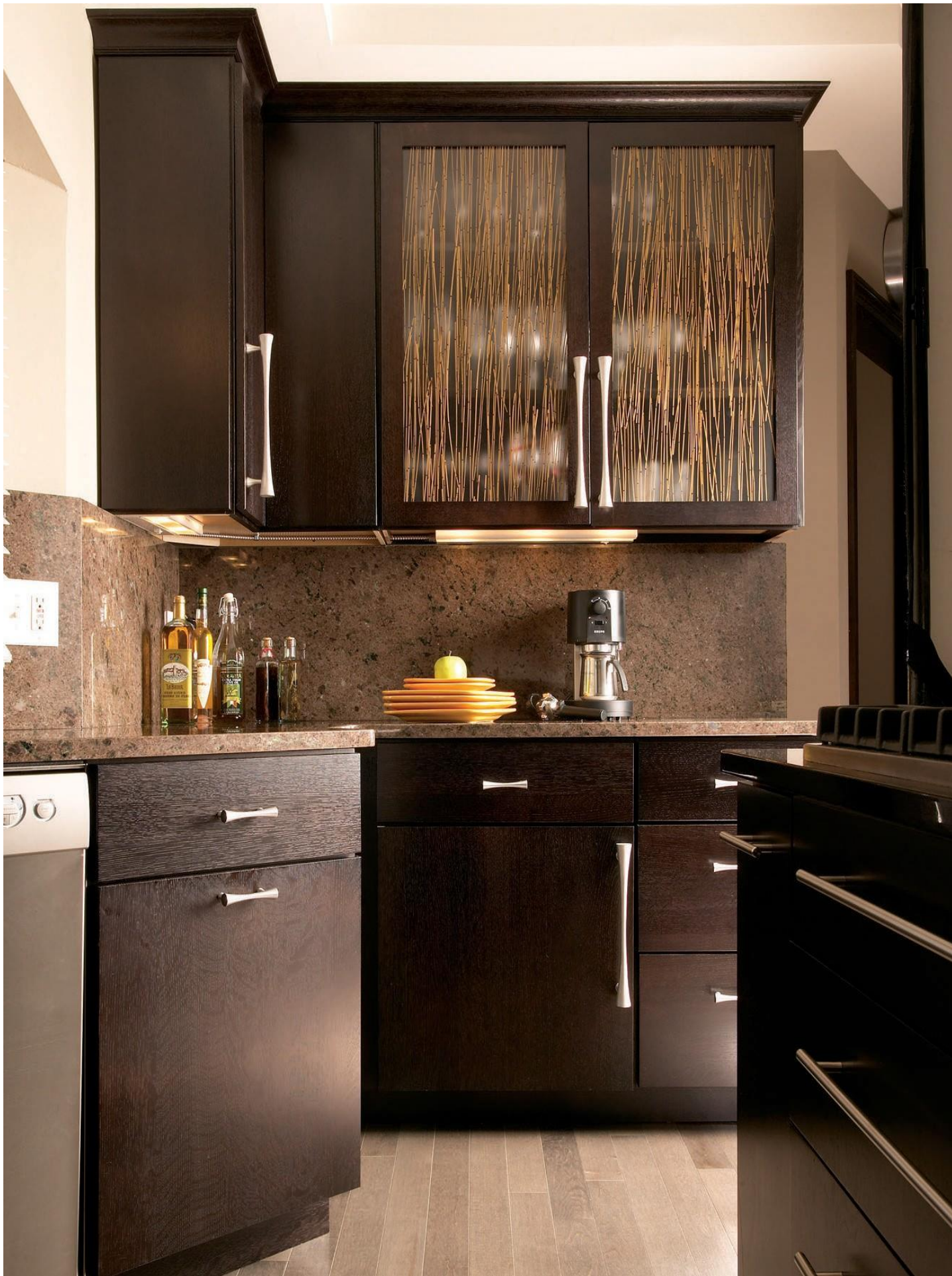
Cameron door, A-edge shape, Slab drawer, Quarter Sawn White Oak, Espresso