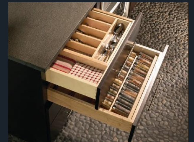
Cutlery Tray/Spice Tray