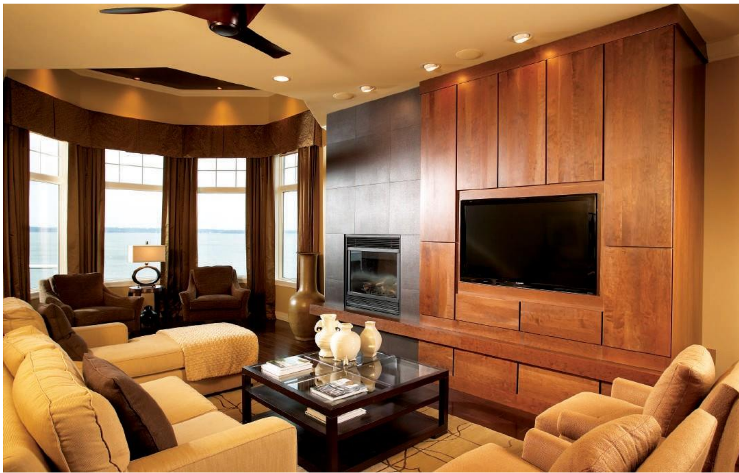
Cameron, A-edge shape, Slab drawer, Cherry, Walnut