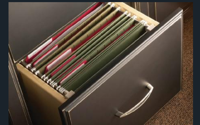
Integrated Filing System