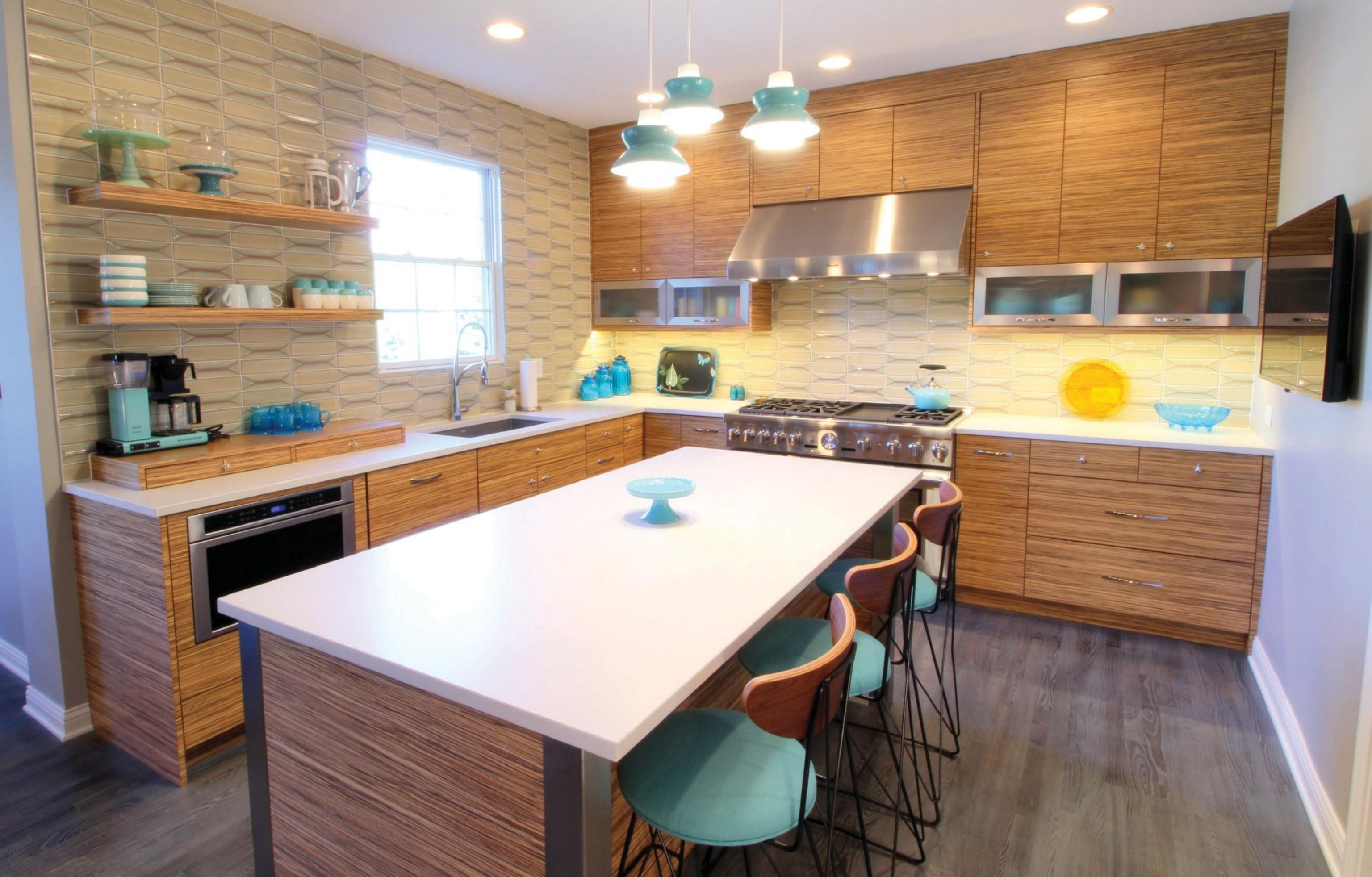
West End Elite door, Unique edge shape, Slab drawer, Reconstituted Zebra wood, Natural (Frameless)