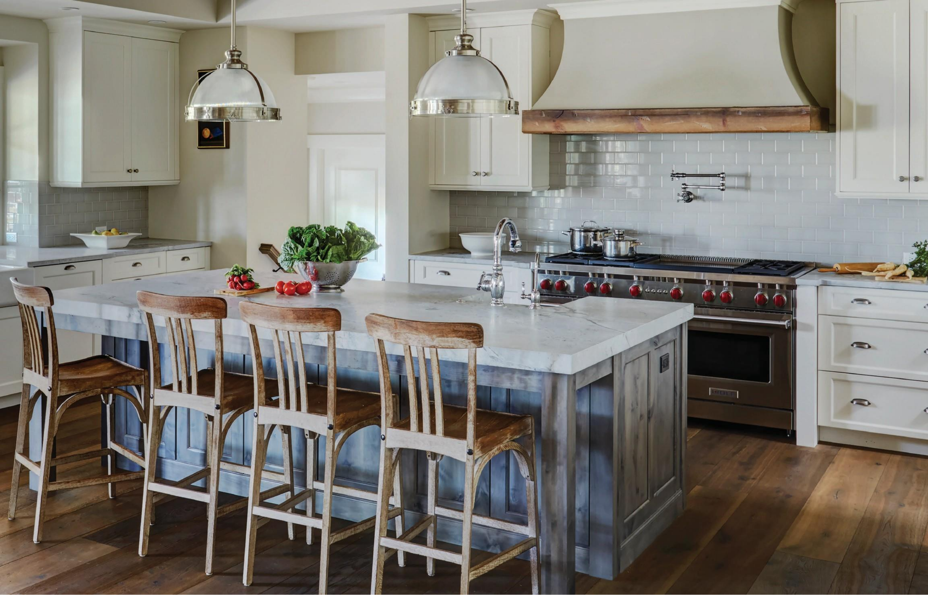
Perimeter Cabinetry: Oxboro door, A-edge shape, Manor Flat drawer, Maple, White Dove (Frameless) Island: Oxboro door, A-edge shape, Manor Flat drawer, Knotty Alder, Weathered Silverwood (Flush Inset)