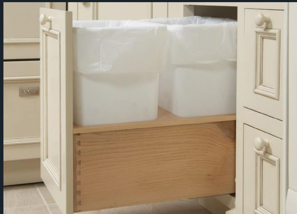
Double Roll-Out Waste