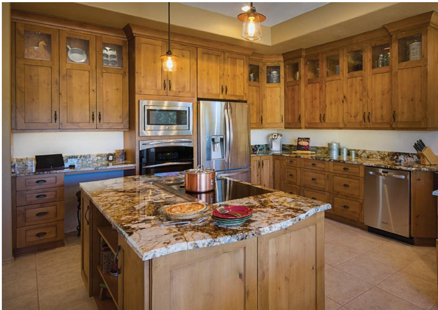
Seabrook door, S-edge shape, Manor Flat drawer, Knotty Alder, Rustic Timber