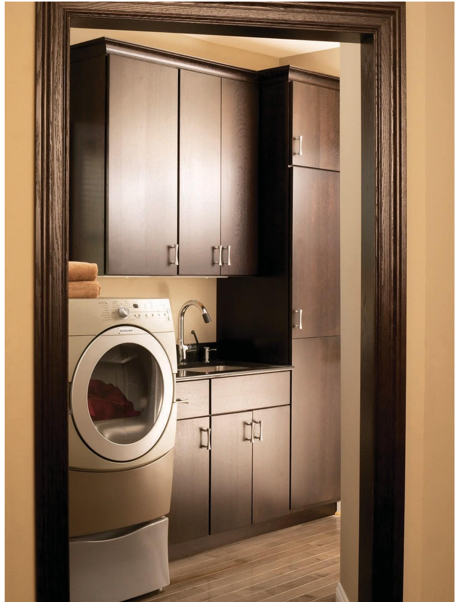
Cameron door, A-edge shape, Slab drawer, Quarter Sawn White Oak, Espresso