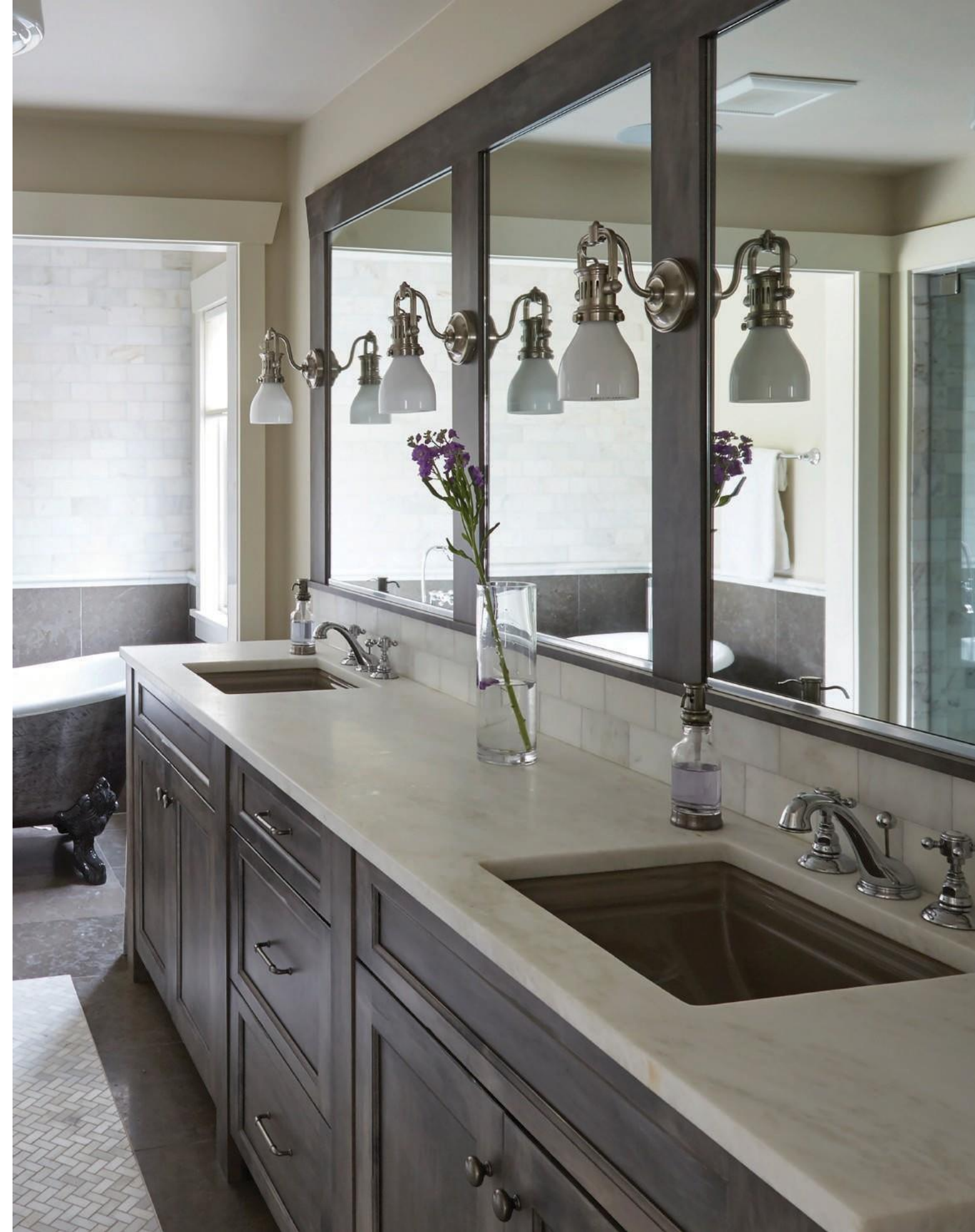
Seabrook door, Double Hip profile, A-edge, Manor Flat Drawer, Knotty Alder, Weathered Silverwood (Frameless)