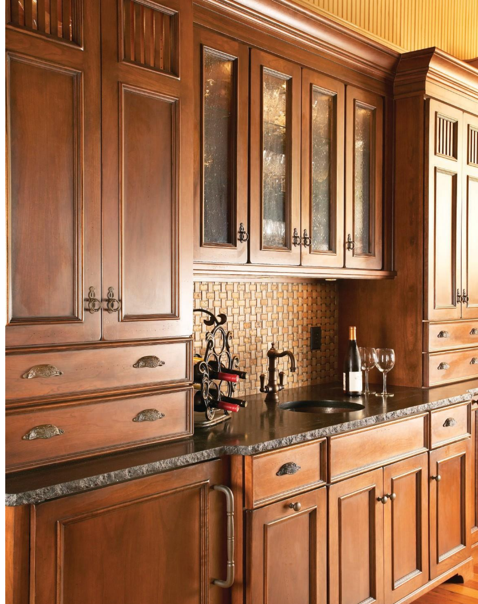
Nottingham and Brittany doors, A-edge shape, Brittany Styled drawer, Cherry, Rustic Chestnut (Full Overlay)