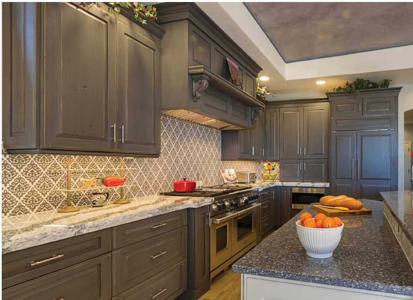
Portsmouth door, D-edge shape, Manor Raised drawer, Knotty Alder, Sawyer Smoke Stack