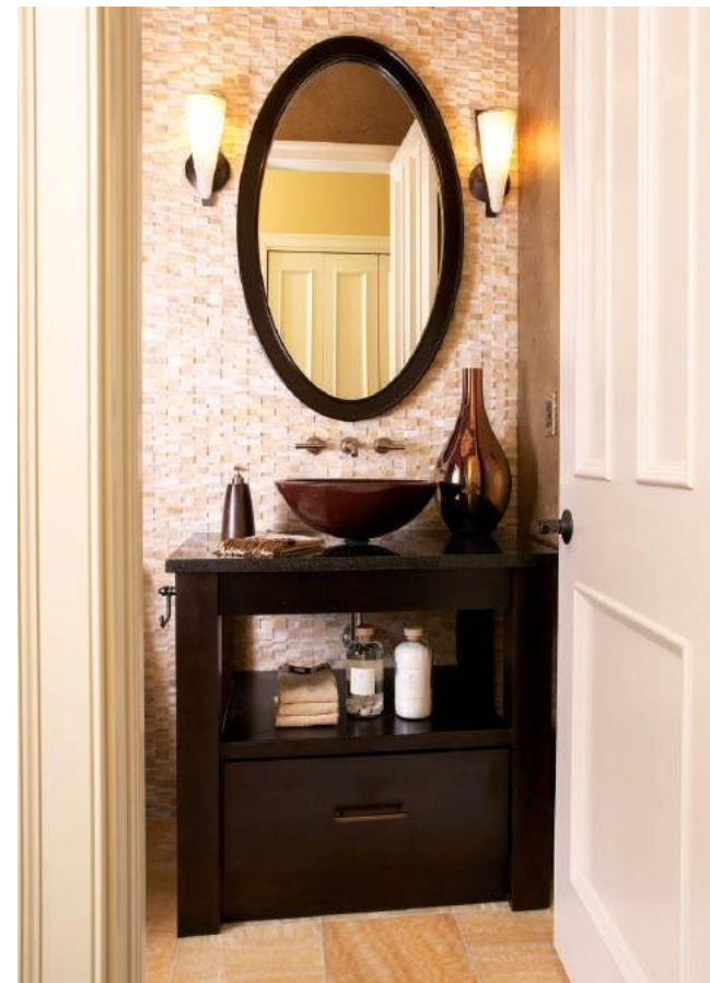
Cameron door, A-edge shape, Slab drawer, Cherry, Espresso