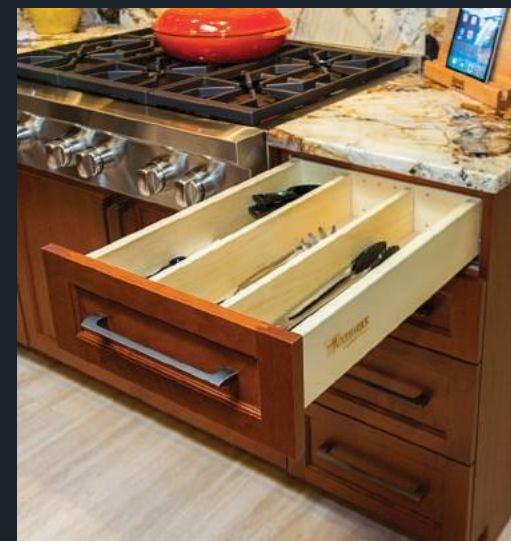
Adjustable Drawer Partitions