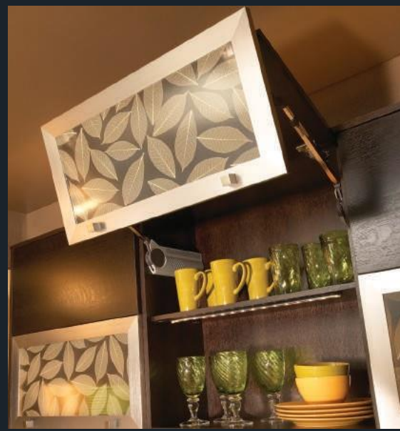
Bi-Fold Flip Up Lift System