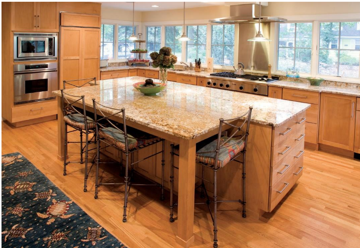
Madison door, A-edge shape, Slab drawer, Maple, Honey