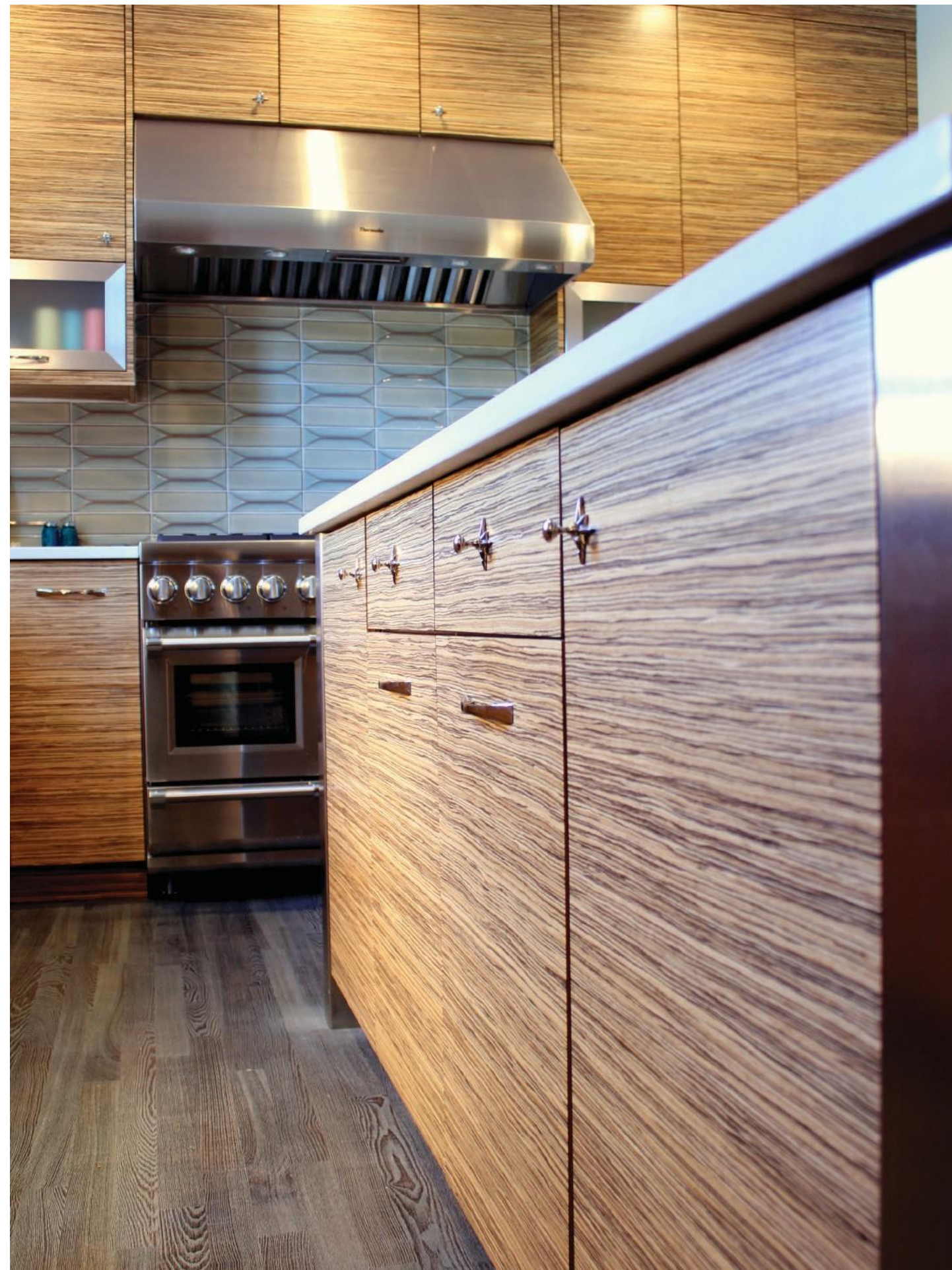
West End Elite door, Unique edge shape, Slab drawer, Reconstituted Zebrawood, Natural