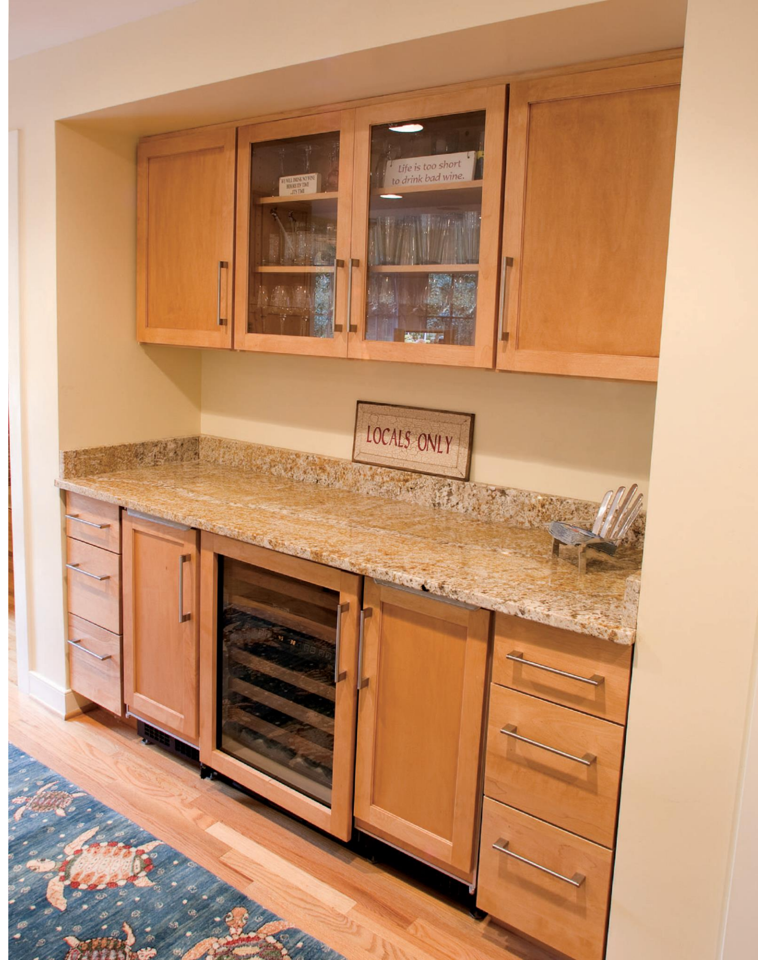
Madison door, A-edge shape, Slab drawer, Maple, Honey