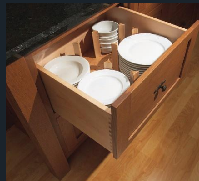
Dish Drawer Organizer