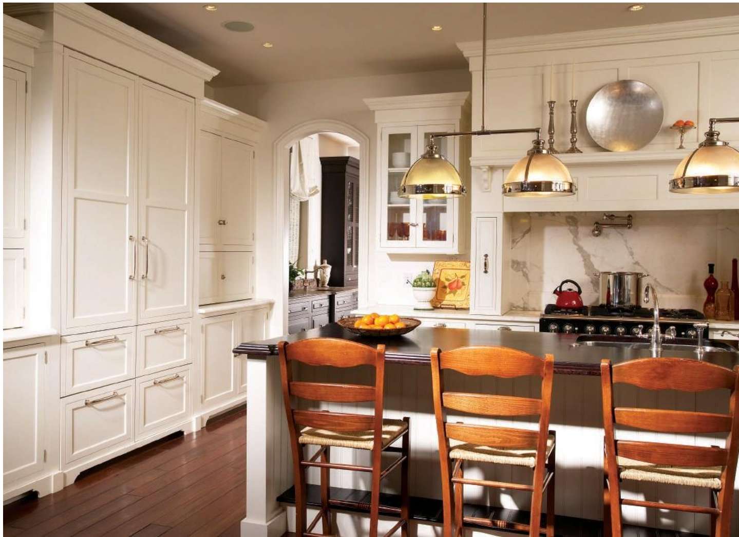
Madison door, Standard Hip profile, A-edge shape, Manor Flat drawer front, Coastal White