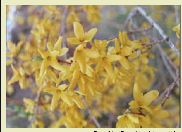
Forsythia ( Forsythia x intermedia )

• Extend your season from forced flowers (forsythia, fruit trees) in the spring; to berries (beautyberry, bittersweet) or bright foliage (oak) in the fall; to red berries and/or green foliage (hollies, pine, juniper, magnolia) for Christmas.