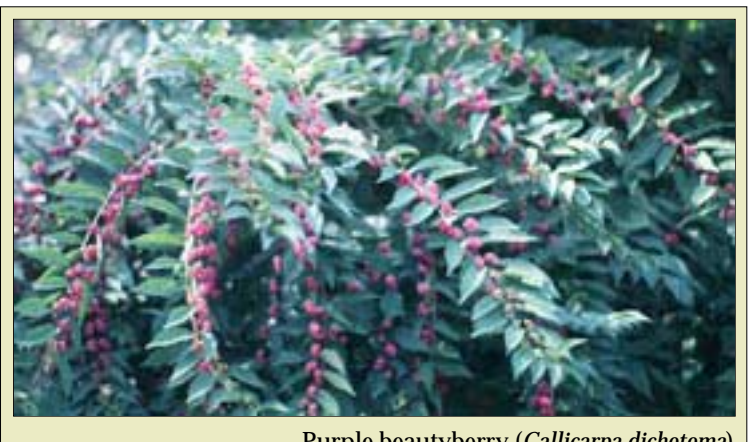
Purple beautyberry (Callicarpa dichotoma)