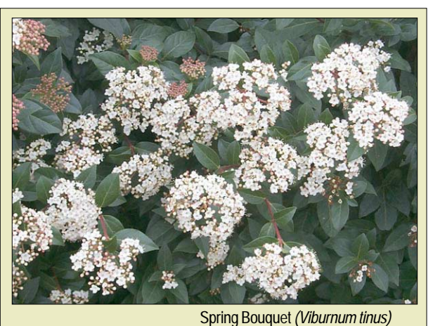
ATTRA //Woody Ornamentals for Cut Flower Growers