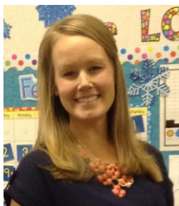
Grasty's Goodies on Facebook