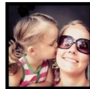
Leah Grasty on Pinterest