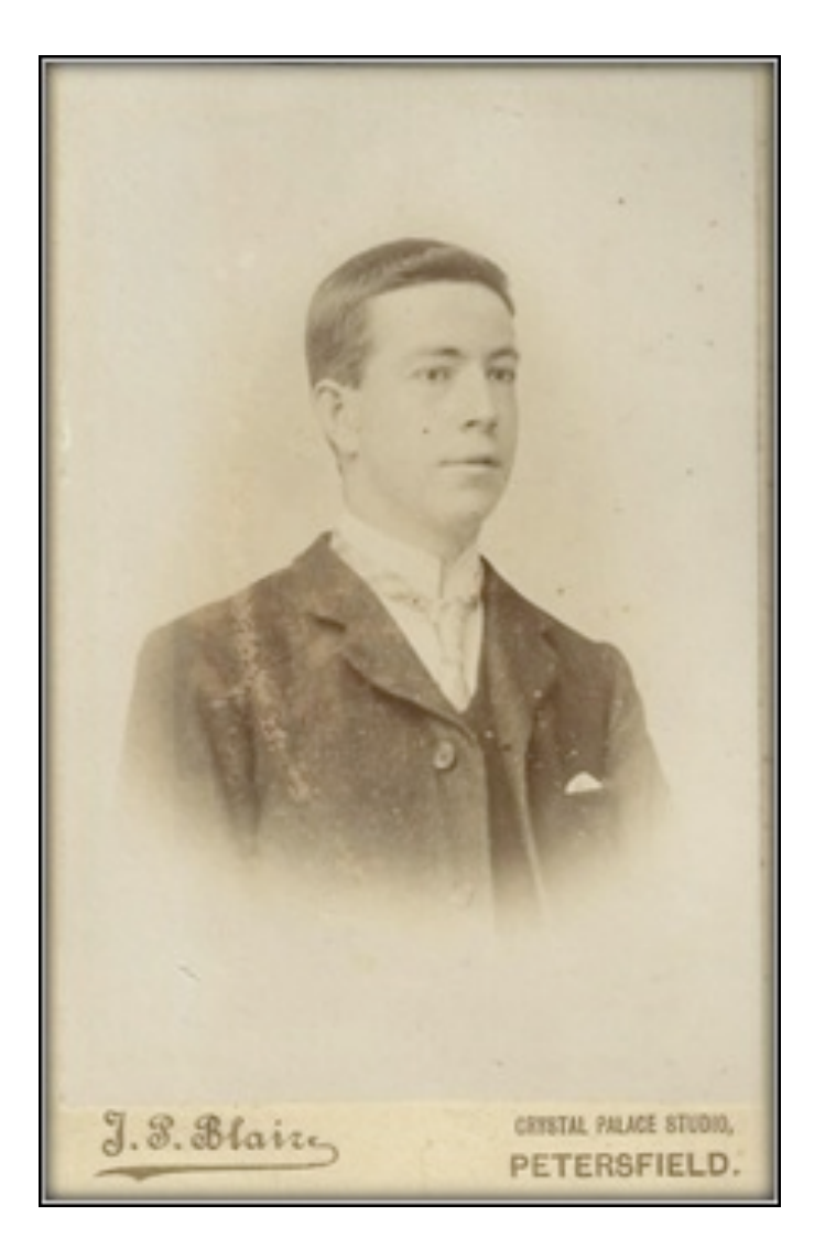
Figure 3: J. P. Blair of the Crystal Palace Studio, Peersfield, 'Untitled', c. 1902

prices with the slogan 'a bad photograph is dear at any price".<sup>11</sup> Joyce shared a similar affection for photographic images, and after seeing the Italian actress Eleonora Duse in La Gioconda and La Citta Morta he procured a photograph of her which 'for a long time stood on his desk'.<sup>12</sup> It is likely that the image of Eleonora Duse would have been a photographic postcard or carte de visite. By the end of the nineteenth century cartes de visite could be purchased in Dublin for half a guinea per dozen. Had half a guinea proved too expensive, cartes de visite could be purchased in sets of three for the cheaper price of three shillings and six pence at Lawrence's Photographic Galleries. Despite competition from amateur photographers, professional photography remained a viable career option during the early twentieth century, with the number of Irish residents listing their occupation as within the photographic industry increasing from 767 to 971 between 1901 and 1911.<sup>13</sup> The replacement of the collodion process with the gelatin dry plate in the 1880s enabled professional photographers to move outside of the photographic studio or portable darkroom. Joyce would have encountered these technological innovations by the time that his first major work was published in 1914, as he was photographed outdoors in 1904 by one of his closest friends, Constantine P. Curran.<sup>14</sup>