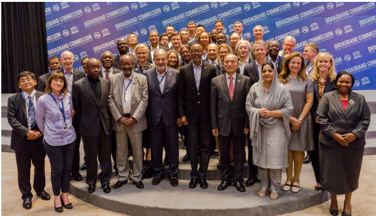
The United Nations Broadband Commission for Sustainable Development. Kigali, Rwanda. 07 May 2018

United Nations Broadband Commission for Sustainable Development