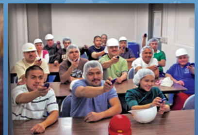
>> Group Training

>> Contact your Ecolab or Alchemy representative for more information.