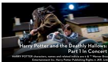
Harry Potter and the Deathly Hallows: Part 1 In Concert

HARRY POTTER characters, names and related indicia are © & ™ Warner Bros. Entertainment Inc. Harry Potter Publishing Rights © JKR. (s19)