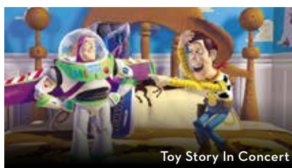
Toy Story In Concert

HARRY POTTER characters, names and related indicia are © & ™ Warner Bros. Entertainment Inc. Harry Potter Publishing Rights © JKR. (s19)