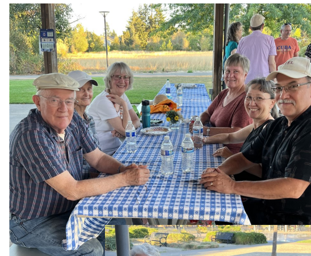
Pictures of the Music Potluck held September 8 on a perfectly beautiful day.

Speaking of impact, both Choir and Handbell Choir have begun rehearsals. You'd make a HUGE impact if you decided to join either one. Short termers are welcome. Four-six week commitments are absolutely welcomed. Contact Marcia at 971-387-6183 if you have questions about rehearsals times and such.