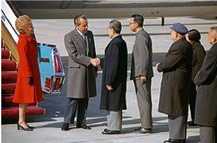
Zhou shakes hands with President Nixon

hand. As added insurance, a Secret Service agent blocked the aisle of Air Force One to make sure the president emerged alone.” 2