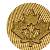
Laser mark micro-engraving with bullion DNA anti-counterfeiting technology