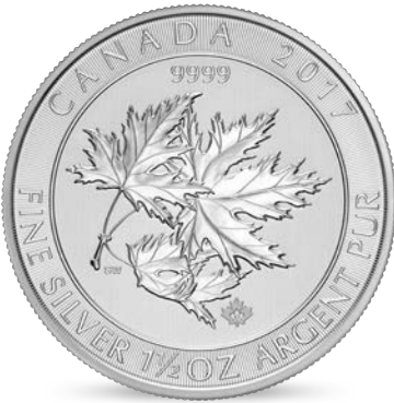
1.5 OZ. SILVER CANADIAN MAPLE LEAF – THE SUPERLEAF – EXCLUSIVELY FROM MONEX