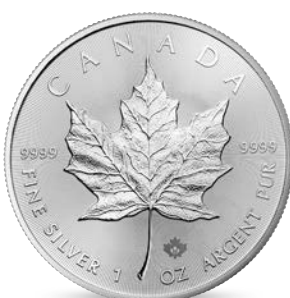
1 OZ. SILVER MAPLE LEAF COIN