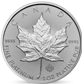
1 OZ. PLATINUM MAPLE LEAF COIN