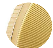
Radial line finish