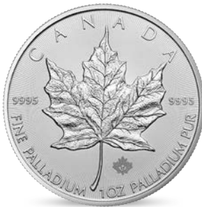
1 OZ. PALLADIUM MAPLE LEAF COIN