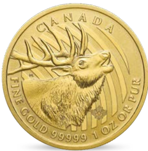
1 OZ. 99.999% PURE GOLD CALL OF THE WILD – ELK