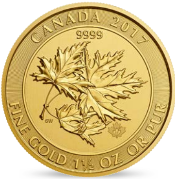
1.5 OZ. GOLD CANADIAN MAPLE LEAF – THE MEGALEAF – EXCLUSIVELY FROM MONEX