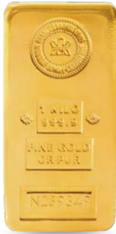
1 KILO GOLD BAR