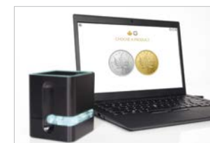
Monex is a member of the Bullion DNA Dealer program

The Royal Canadian Mint has replaced its traditional bullion finish with precisely machined radial lines that create a unique, identifiable light-diffracting pattern. As well, every Mint bullion coin features a laser-engraved maple leaf visible only under magnification as further proof of authenticity.