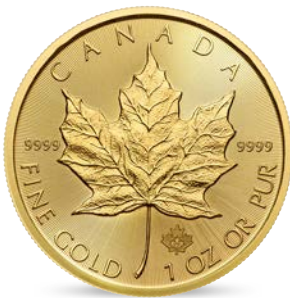
1 OZ. GOLD MAPLE LEAF COIN