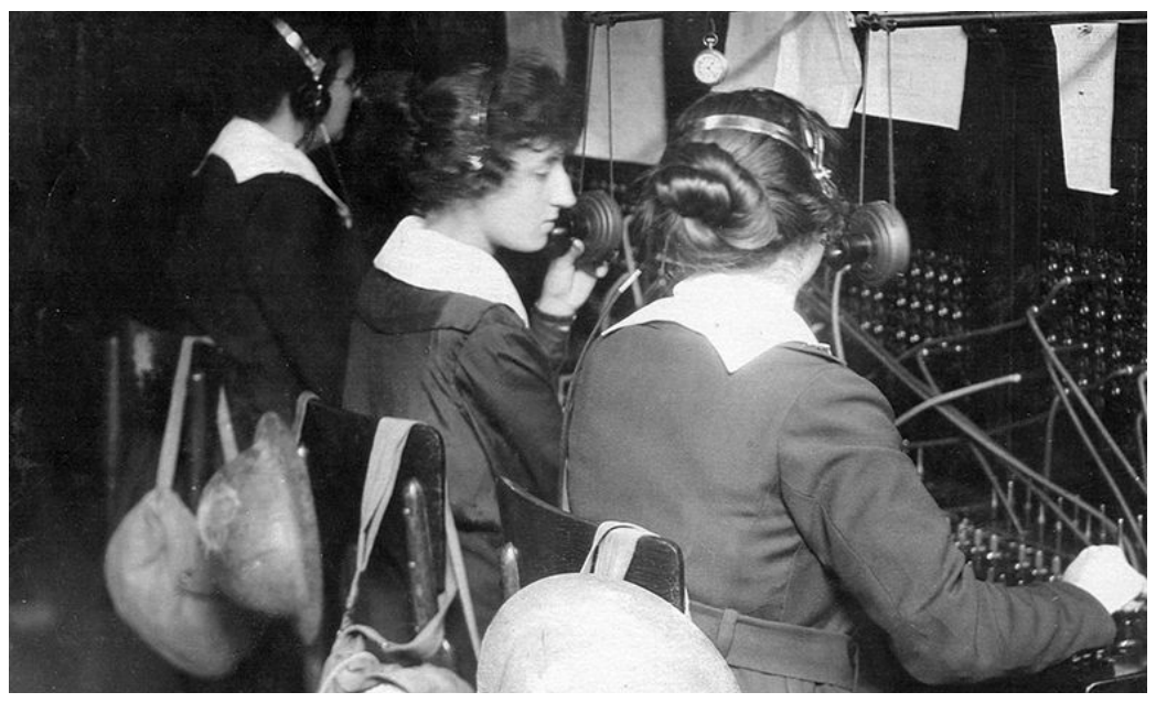
Women served on the frontlines of the war operating the switchboards linking telephones across the battlefields. The women, who had to be bilingual in French and English, worked for the Signal Corps and came to be known as the "Hello Girls." The U.S. World War I Centennial Commission is working with Congress on the Hello Girls Congressional Gold Medal Act of 2018.