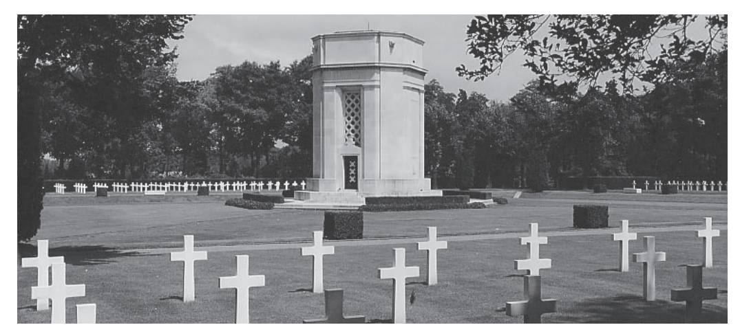
Flanders Field American Cemetery and Memorial in Waregem, Belgium.