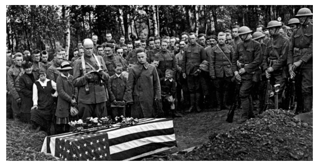
Chaplain (LTC) Francis Duffy performs an American soldier's burial Mass in France, 1918.