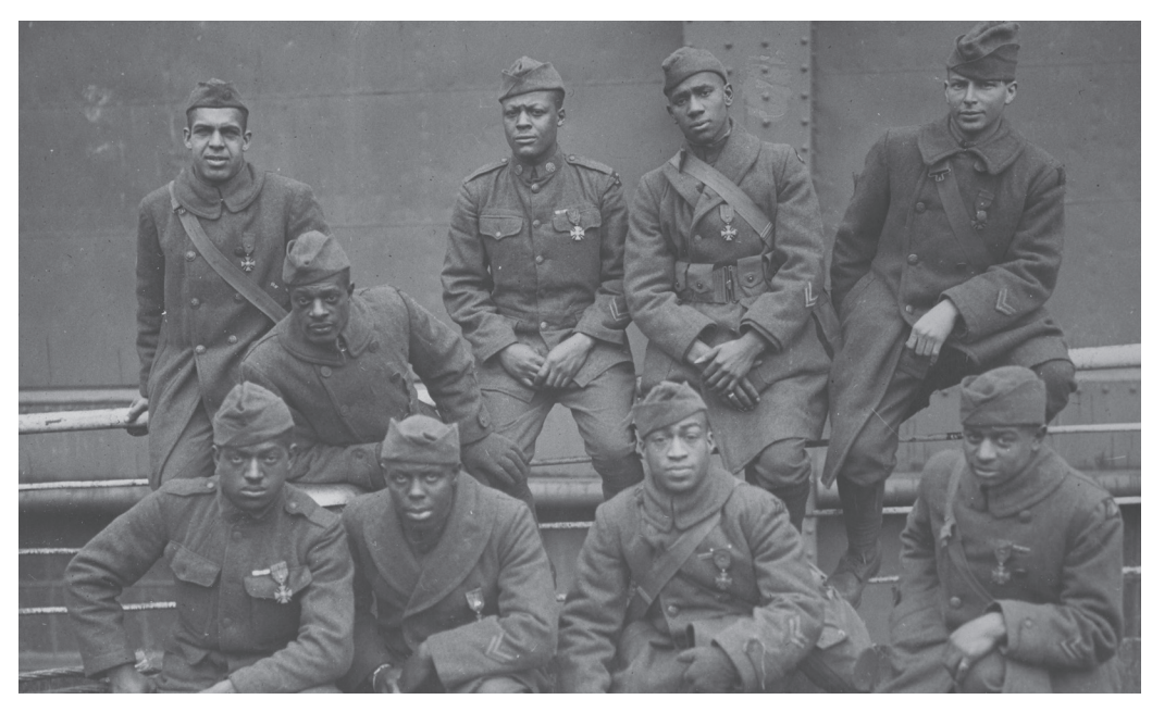
Members of the 369th (15th N.Y.) Regiment who received the French Croix de Guerre (Military Cross) for gallantry in action (visible on their uniforms). Photographed on the USS Stockton as they returned to the United States, 12 February 1919.