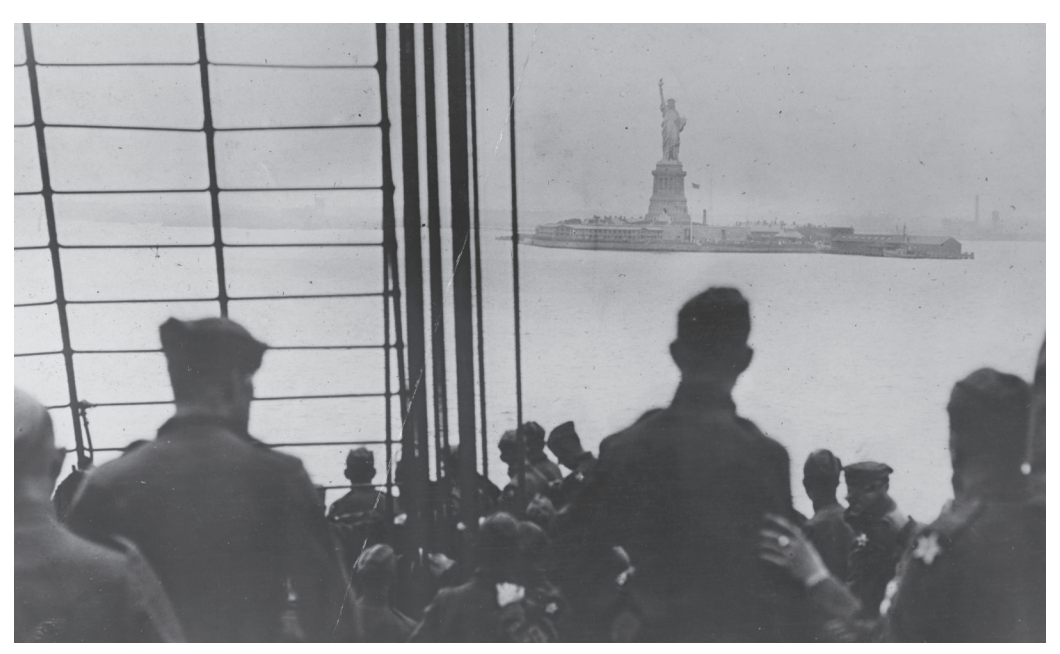
The Statue of Liberty greets the Second Division as it arrives in New York, NY, 8 August 1919.