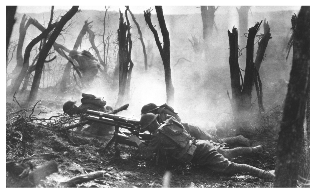
Gun crew from Regimental Headquarters Company, 23rd Infantry, 2nd Division, firing 37mm gun during an advance against German entrenched positions, 1918.