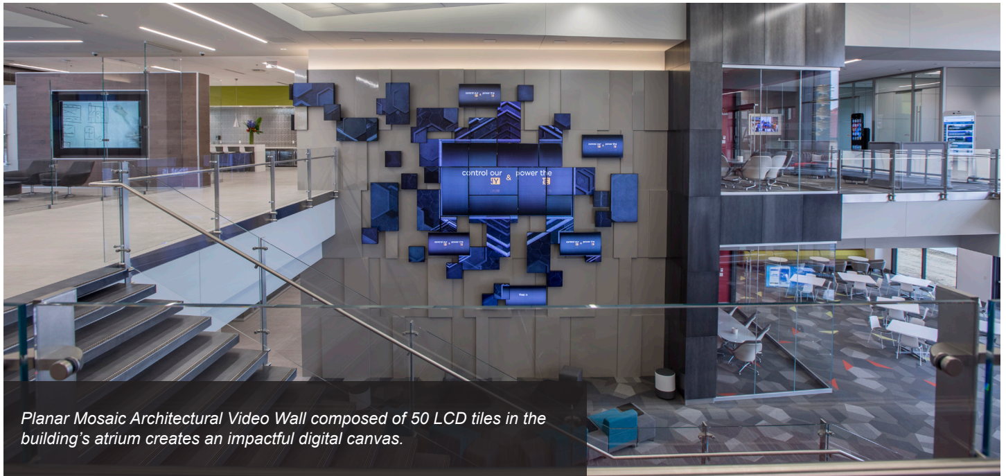
Planar Mosaic Architectural Video Wall composed of 50 LCD tiles in the building's atrium creates an impactful digital canvas.