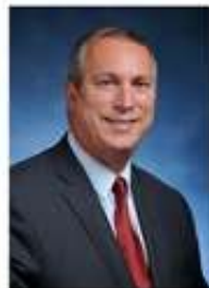
ADAM CLAYTON POWELL, IV