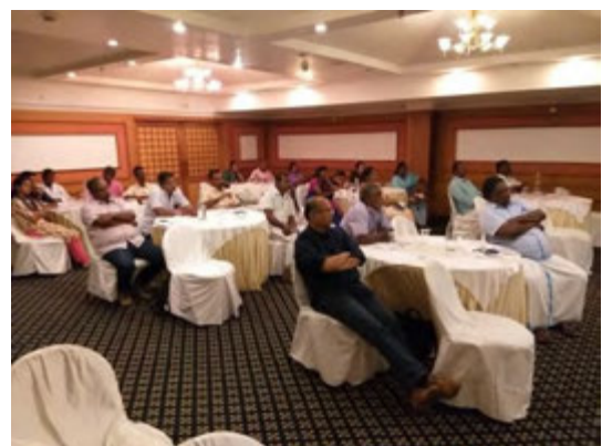
Workshop on Eco-Labeling & Fisheries Certification for Sustainable Fisheries Management