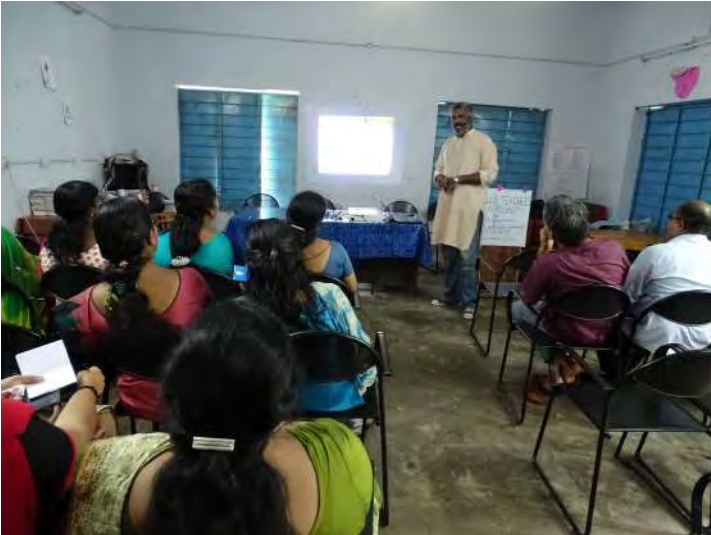
Teachers Training Workshop on Marine Turtle and ESD at Chavakkad