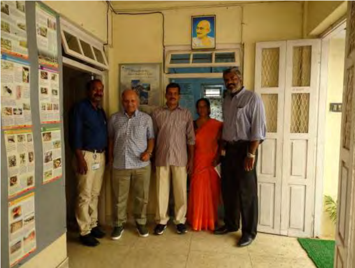
SG & CEO with staff