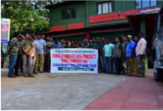
Bird Atlas Project