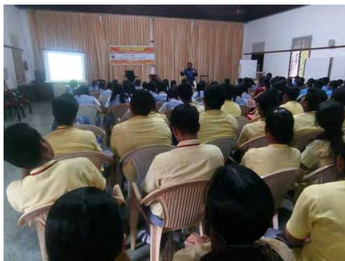
Friday Forum on Urban Wildlife