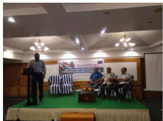
State Director addresses the participants