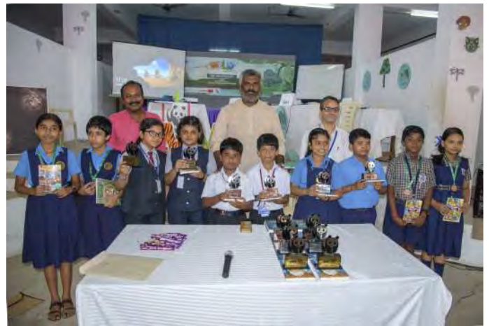
Winners of Junior Category at City Level