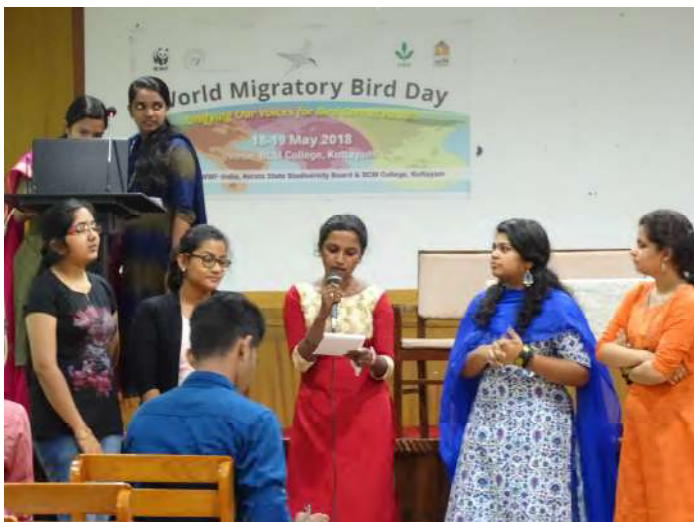
Presentation by participant students