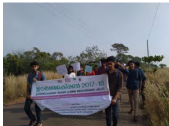
Urja Kiran 2017 – 18 – Awareness Programmes and Energy Conservation Rallies