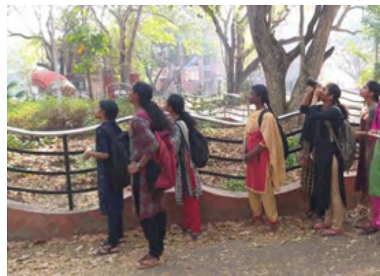
Common Bird Monitoring Programme – Orientation Session and Field Bird Watching