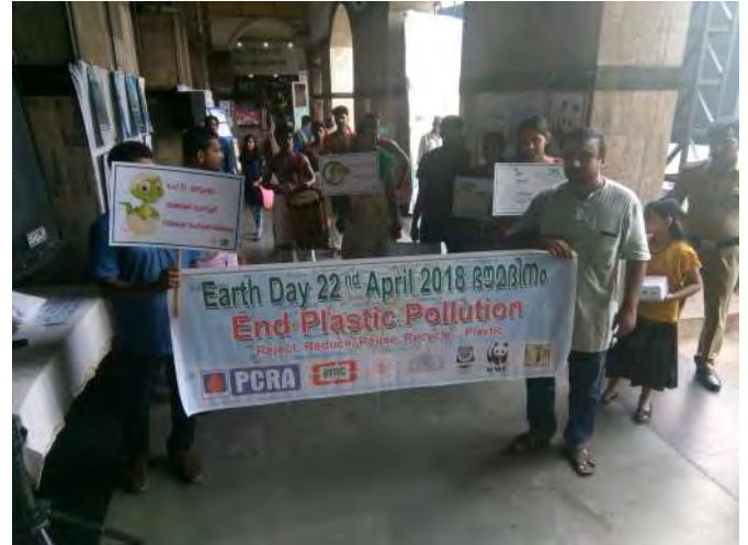
Earth Day - Rally at Railway Station