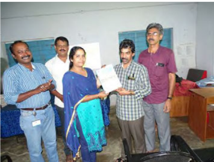
Ass. Educational Officer release the book on ESD during the Workshop