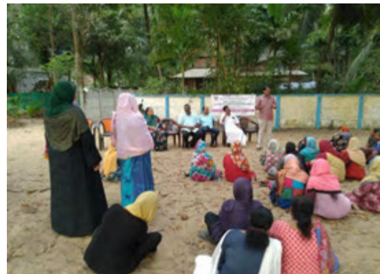
Marine Turtle Conservation – Awareness Programme for Kudumbasree Members