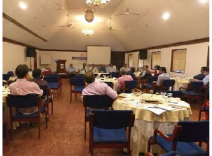
ANERT National Workshop