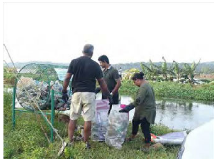
Litterbin Clearing in Punchakkari