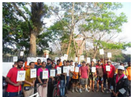
Earth Hour Cyclothon Flag-off and participants with the placards