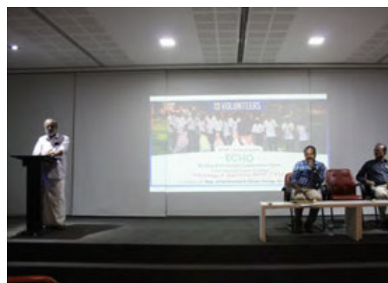
ECHO Orientation Workshop