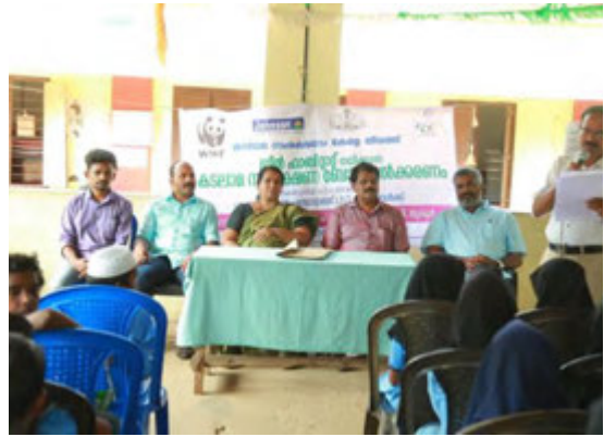
Marine Turtle Conservation – Awareness Programmes in schools in Chavakkad