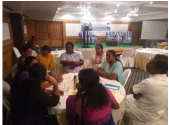
Group discussions at the Sustainable Fisheries Management Workshop