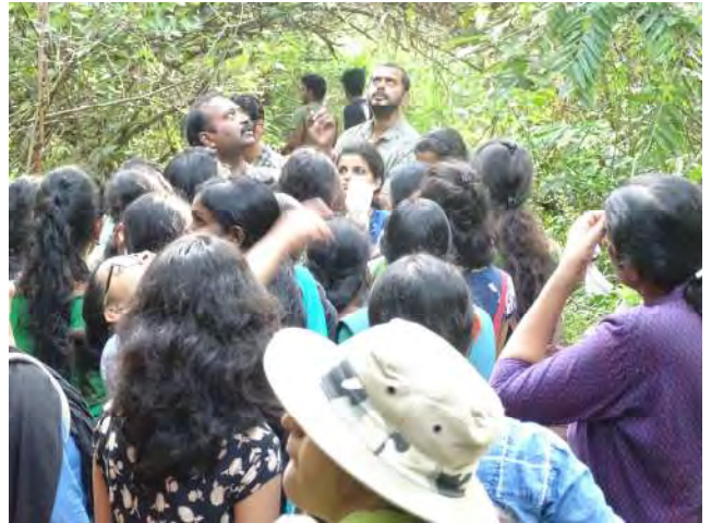
Participant students during the field trip