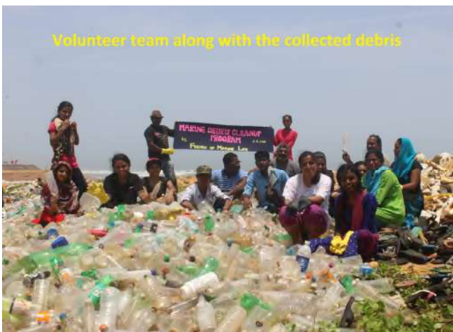
Volunteer team with the collected waste