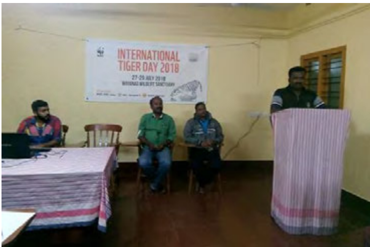
Inaugural Session of International Tiger Day 2018