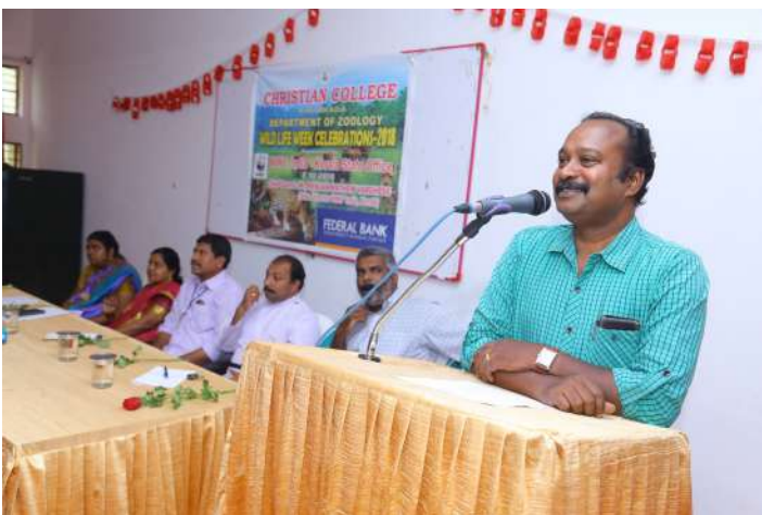
Address by Senior Education Officer