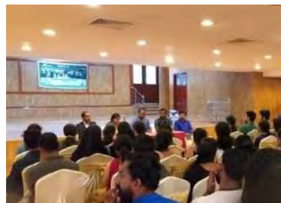
Volunteers Day at Kollam – Beach Cleanup Campaign & Get-Together