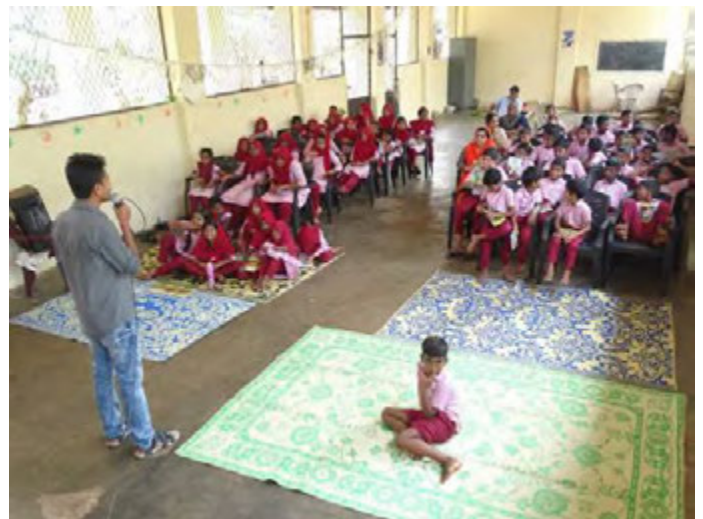
GFUP School, Kadappuram