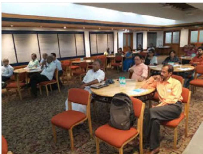
OPCC Stakeholder Consultation in Kochi