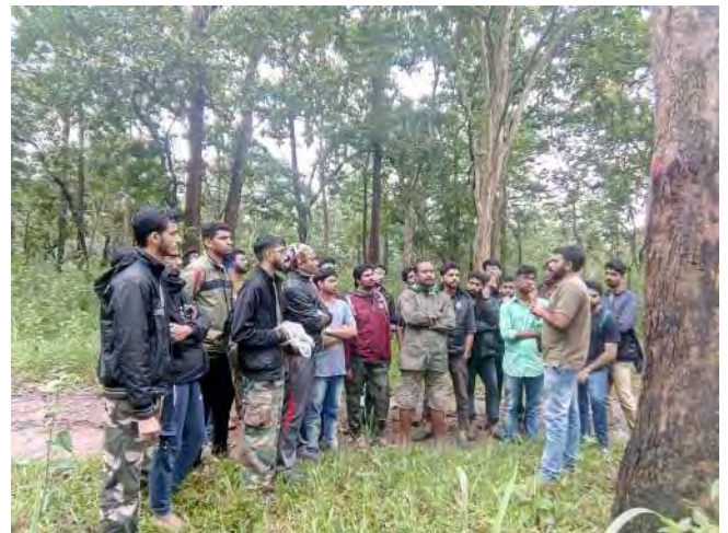
Field trip for volunteers during ITD 2018