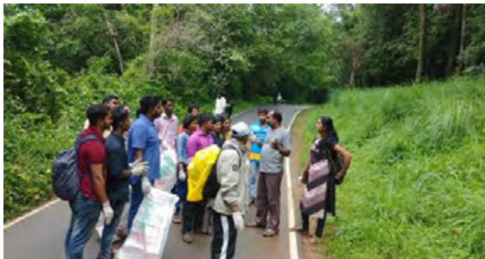
Participants during the field interpretation