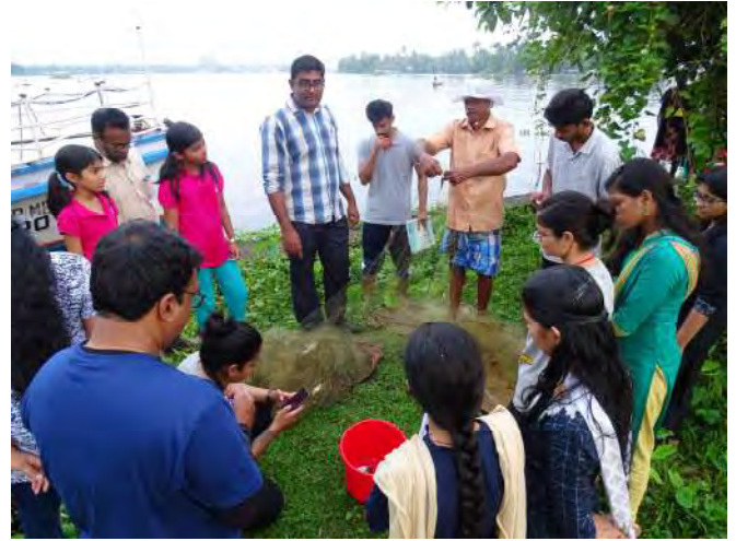
Vembanad Fish Count