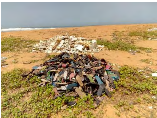
Heaps of plastic, thermocole and footwear wastes collected during the drive