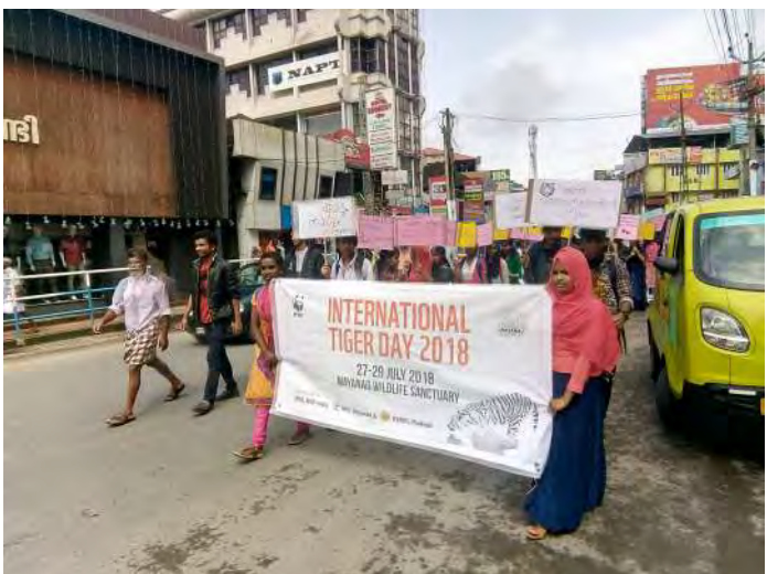
Tiger Conservation Rally proceeds