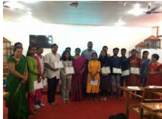
Observation of National Science Day and Science Quiz Competition at All Saints College