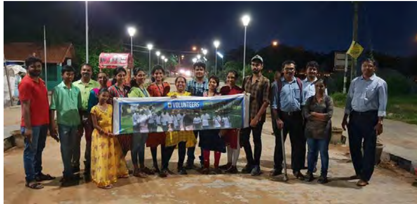
Observation of International Day for Volunteers