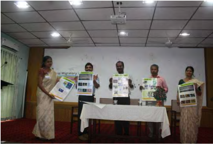
Poster Release and inaugural session