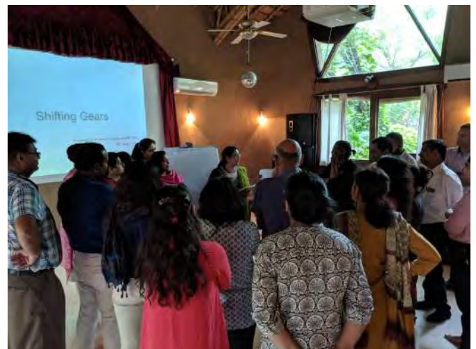
State Office Meeting at New Delhi