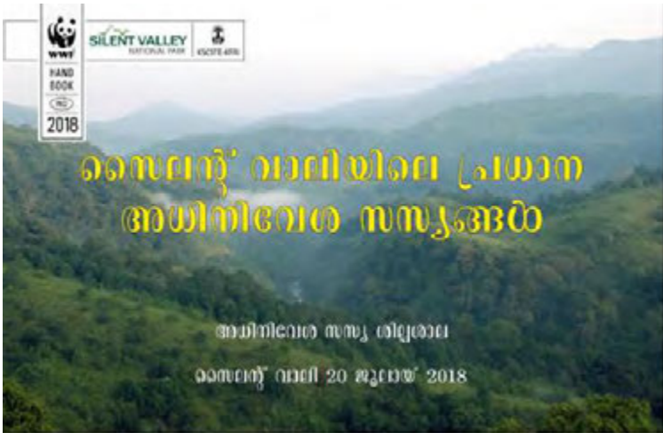
Handbook on Invasive Alien Species at SVNP