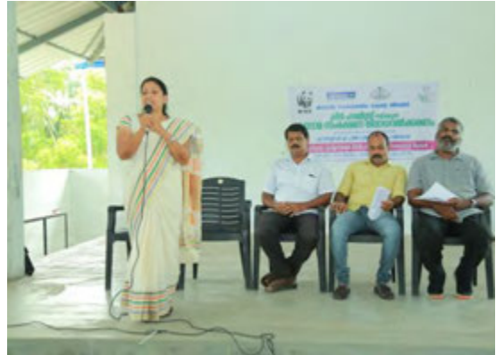
Marine Turtle Conservation – Awareness Programmes in schools in Chavakkad