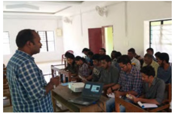
Workshop on Birds of Vazhachal