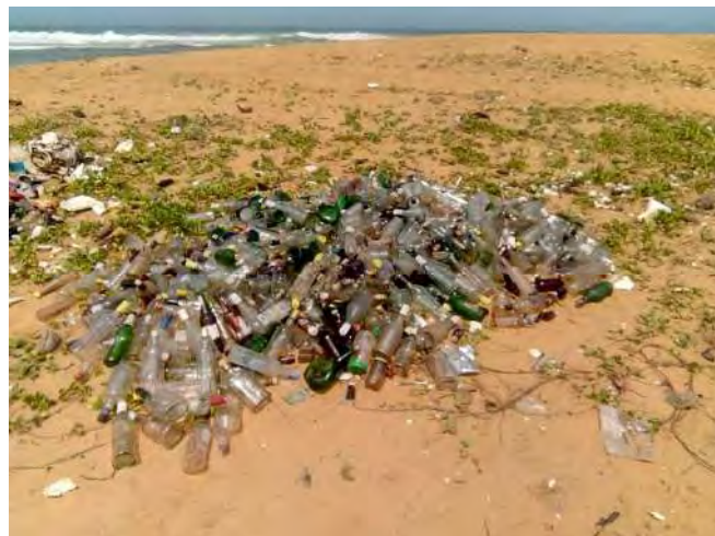
Clean up drive in Veli Estuary Opening