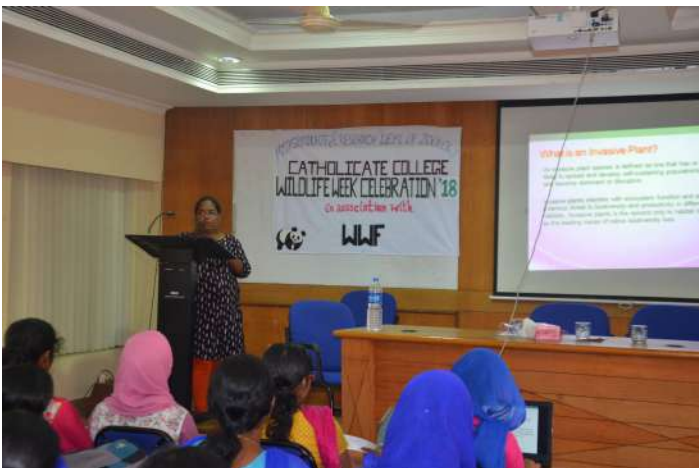
Session on Invasive Alien Species