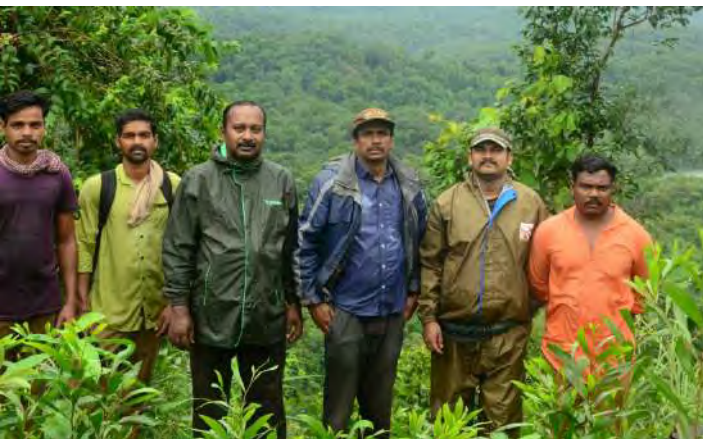
Senior Education Officer and Volunteers during the Bird Atlas data collection in Thiruvananthapuram