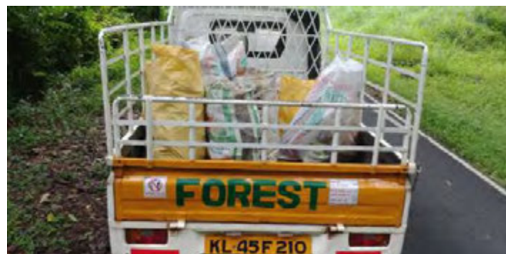
Proper disposal of collected plastic waste from forests areas by volunteers