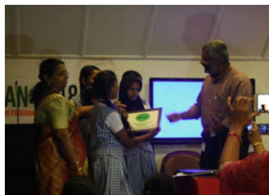
WIPRO earthian programme – Regional Recognition Event at Thiruvananthapuram