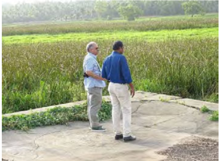
SG & CEO during field trip to Punchakkari wetlands with Senior Education Officer