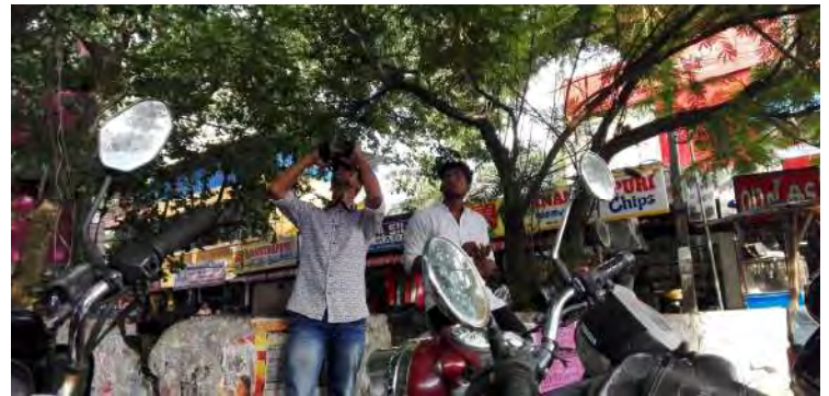
Herony count at Thiruvananthapuram