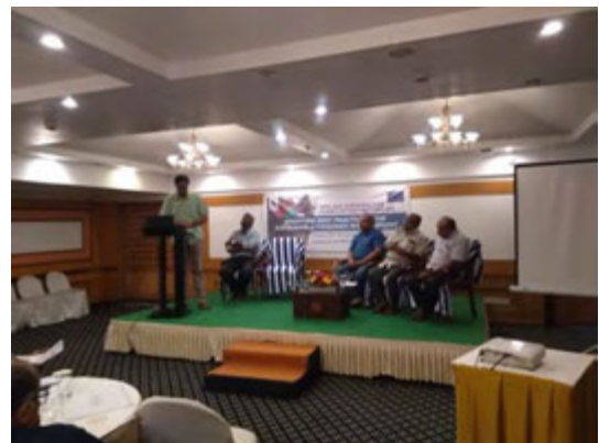
Fisheries Dept. representative speaking