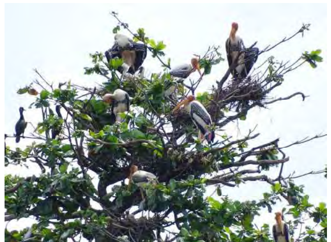
Herony of Painted Storks