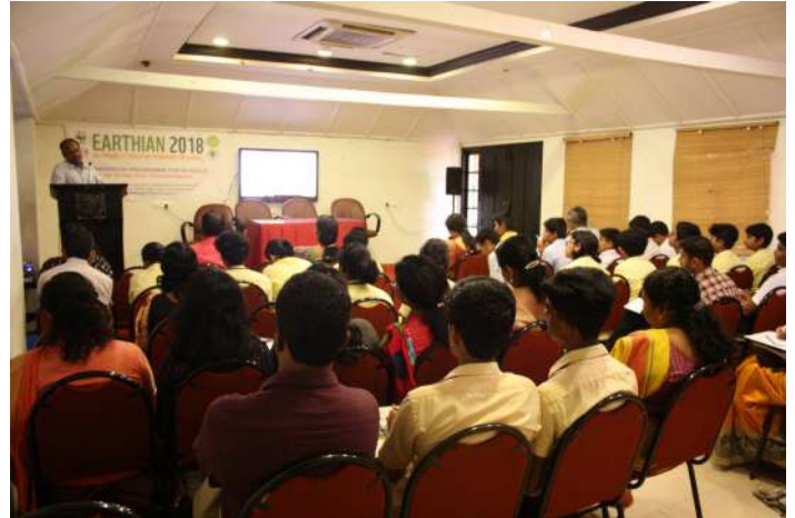
Introduction by Sri.U.T.Arasu