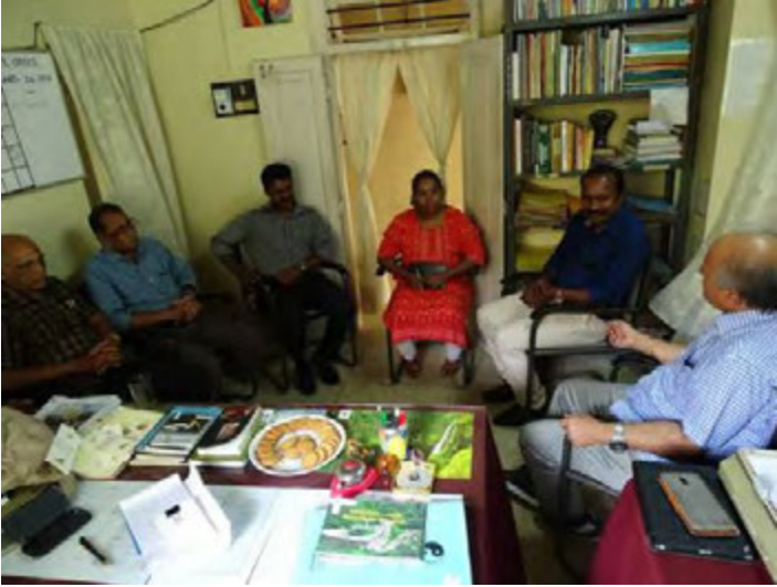
Interactive session of SG & CEO with staff and volunteers