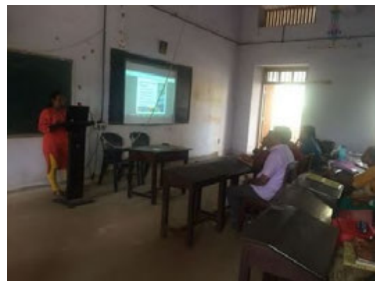
World Wetlands Day 2018 at SN College, Kollam