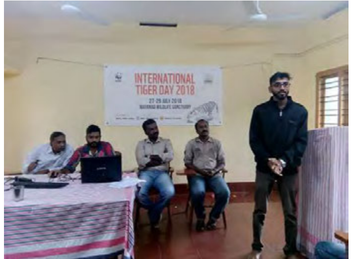
Feedback session by volunteers