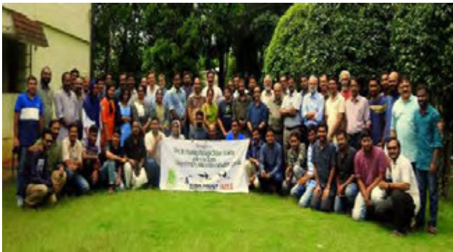
Birders Meet at Thrissur