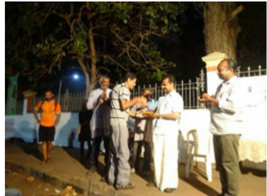
The Mayor signing the GIVEUP Campaign Pledge on behalf of Thiruvananthapuram Corporation