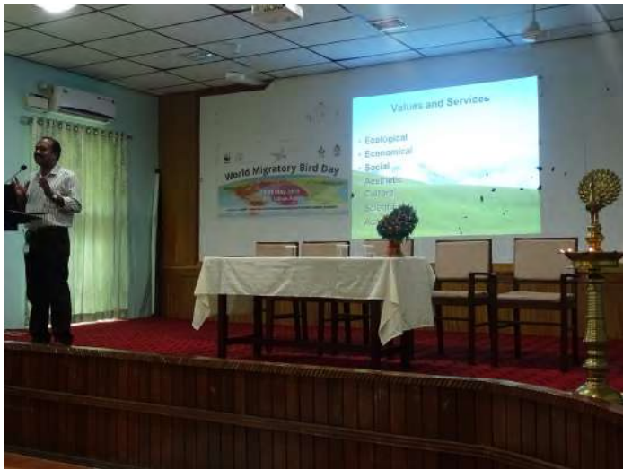
Session on Biodiversity by Senior Education Officer