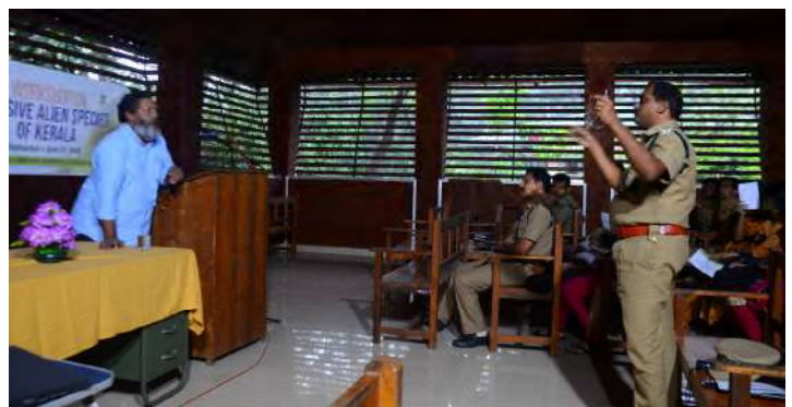
Discussion session of the workshop