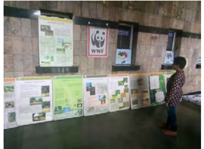
Earth Day - Exhibition at Railway Station