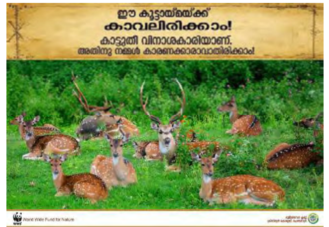
Posters published by Chengannur Christian College, on the theme of 'Forest Fires'