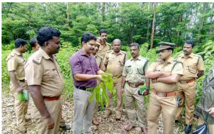
Identification of Invasive Alien Species during the field trip