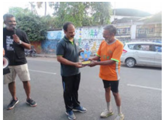
Earth Hour Cyclothon – Guests at the Flag-off