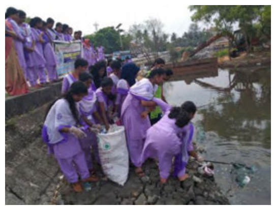
World Wetlands Day 2018 at SN College for Women, Kollam