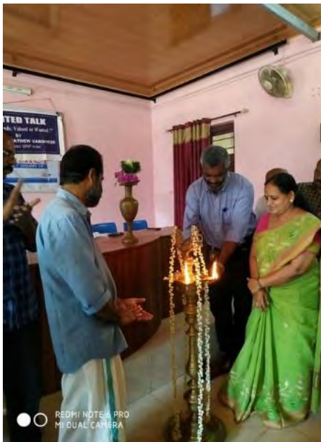
World Wetlands Day 2018 at DB College, Sasthamkotta