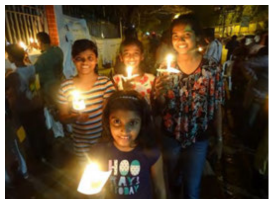
Earth Hour – Switch Off & Candle Light Vigil