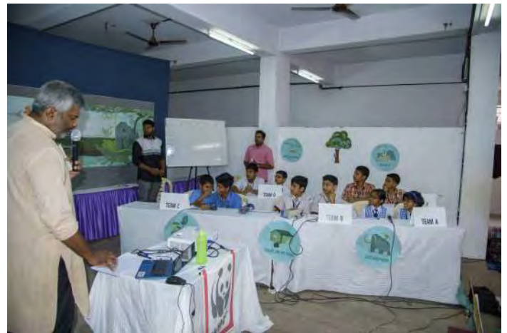
WWQ City Level for Middle category