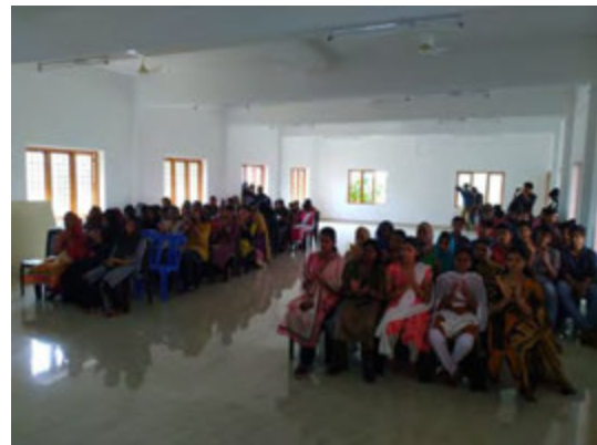
Urja Kiran 2017 - 18