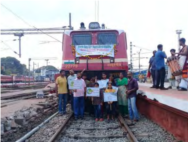
Earth Day - Rally at Railway Station