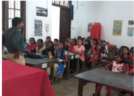
World Wetlands Day 2018 Awareness Programmes at Govt. Women's College, Thiruvananthapuram