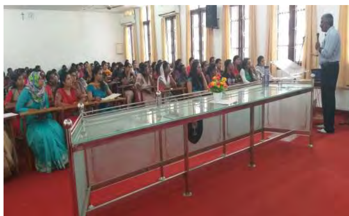
Ozone Day Observation