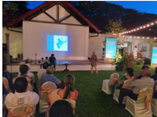
Elephant Conservation – Exhibition and Workshop at Kochi