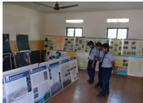
WWF Exhibition Stall