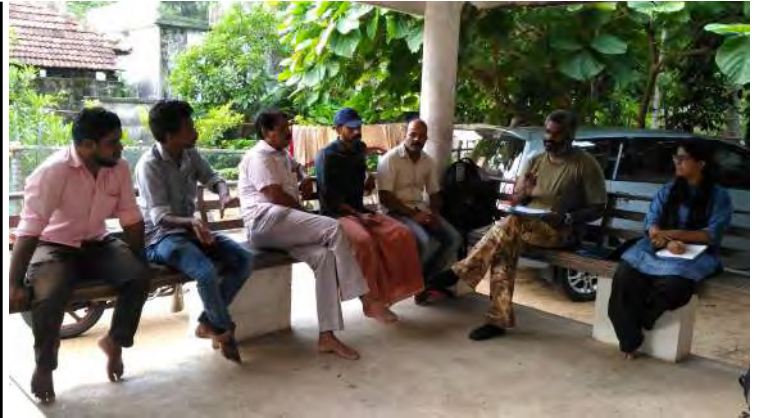
Field visit carried out at Chavakkad as part of Marine Turtle Conservation