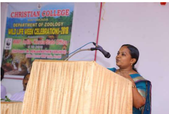
Address by Teacher-in-charge