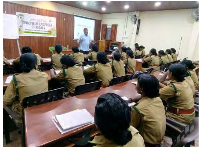
Workshop on Invasive Alien Species at SVNP