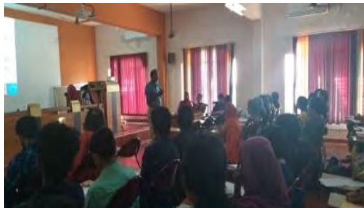
World Wetlands Day 2018 event at St Thomas College Kozhencherry