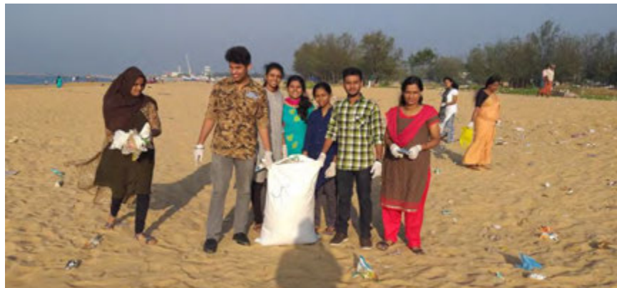
Volunteers Day at Kollam – Beach Cleanup Campaign