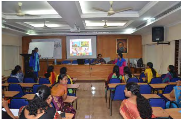
Quiz on Wildlife