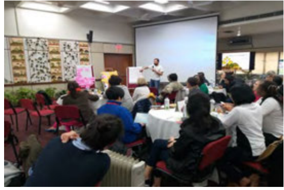
WWF Global Education Summit in WWF-India Secretariat, New Delhi