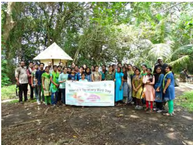
Participant students during field trip