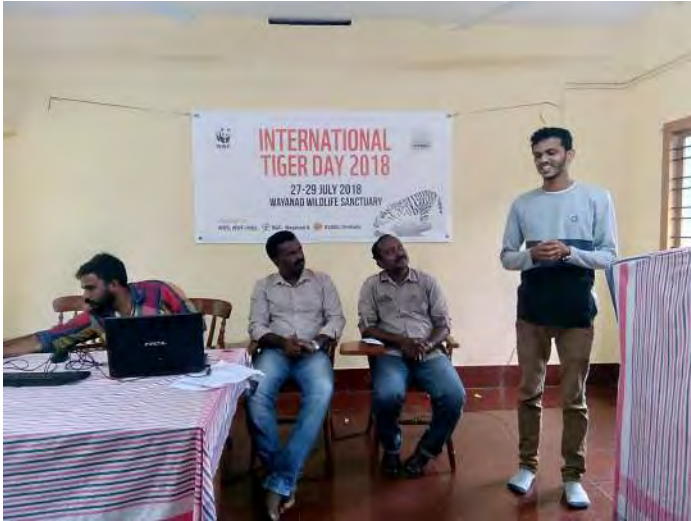
Feedback session by volunteers