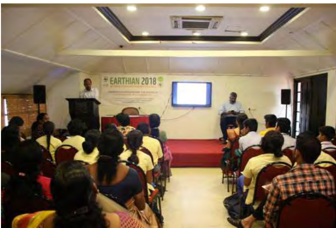
Session on Framework of the project