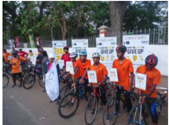
Earth Hour Cyclothon – ICE Members and students of LNCPE