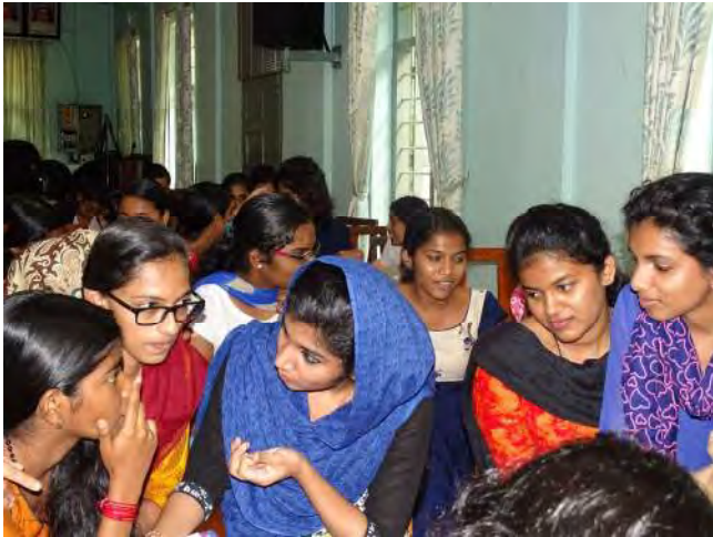
Group discussion by participant students