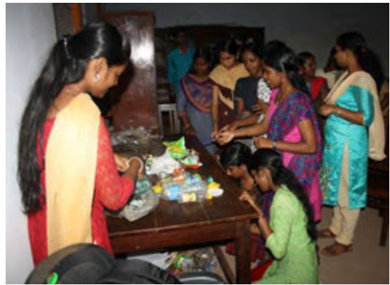
ECHO Orientation Workshops