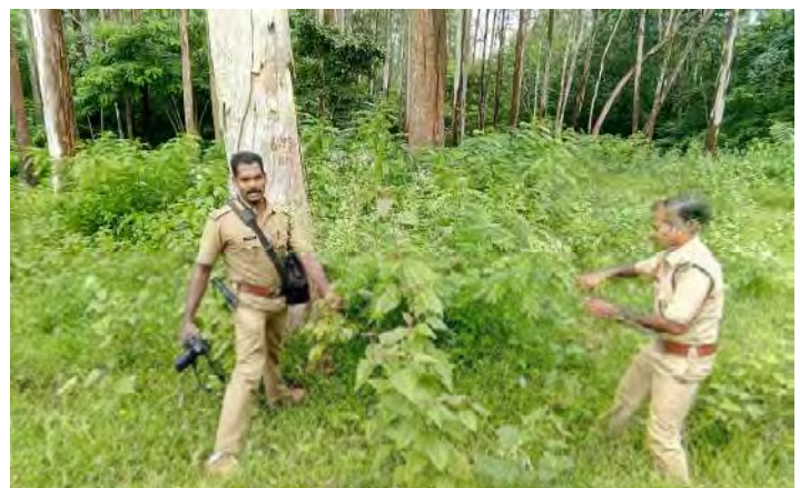
Eradication of Invasive Alien Species during the field trip