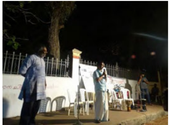
Earth Hour Evening Function at Manaveeyam Veedhi