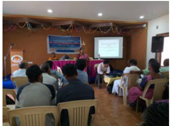
Workshop on the Impact of the Blue Economy on Fisheries organized by KMTF & NFF