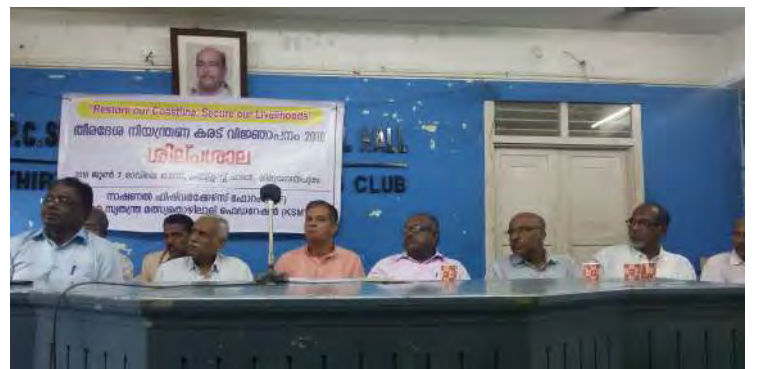
Workshop on 'CRZ Notification Amendment 2018