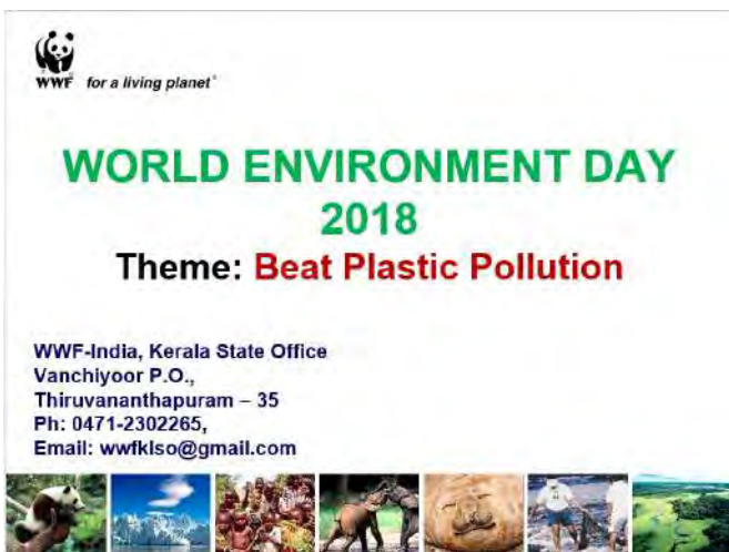
Resource Material Kit on World Environment Day 2018