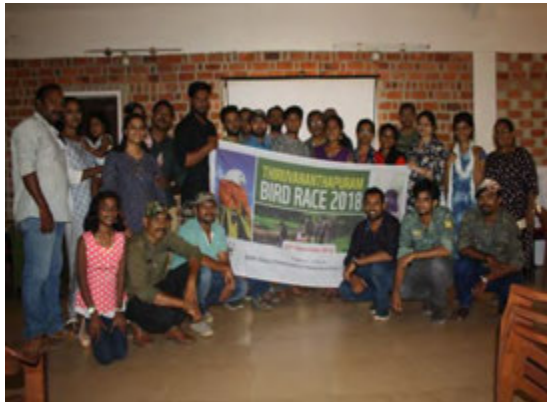
Thiruvananthapuram Bird Race 2018