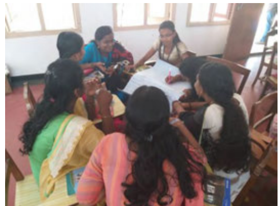
ECHO Workshop for students of All Saints College, Thiruvananthapuram