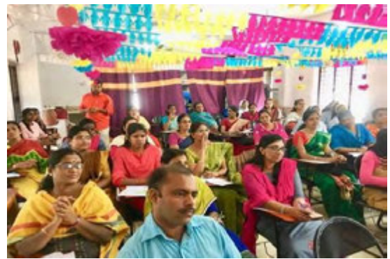
Paaristhithikam Project in Thrissur jointly with SSA Thrissur