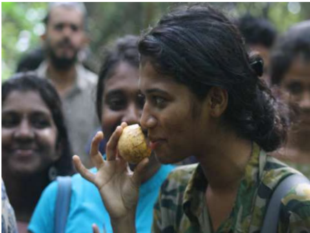
Participant students during the field trip