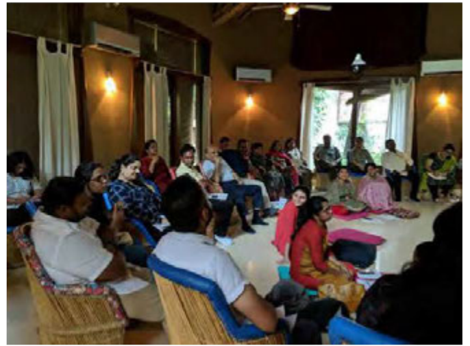
State Office Meeting at New Delhi