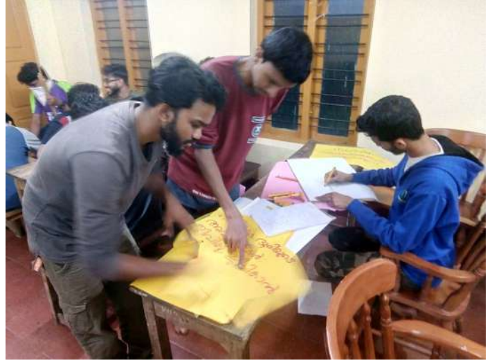
Volunteers engaged in slogan making and placard making