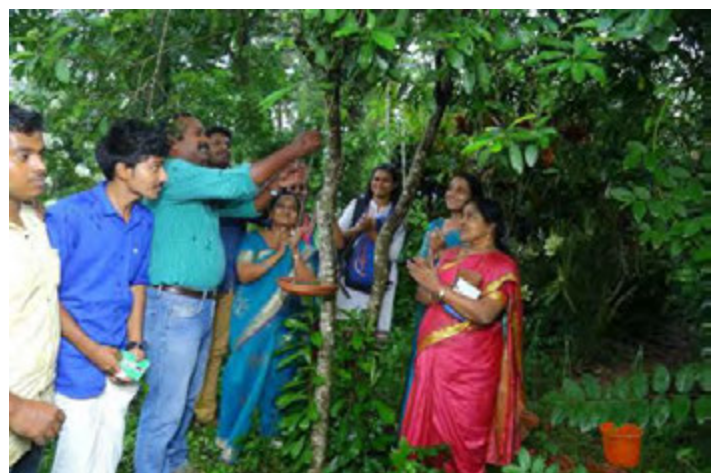
Installation of Bird baths