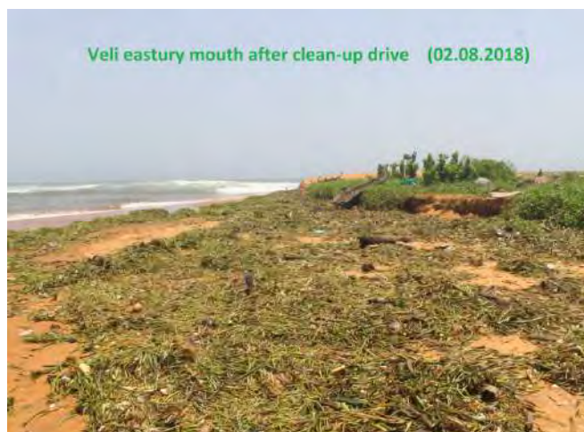
Veli Estuary after the clean up drive