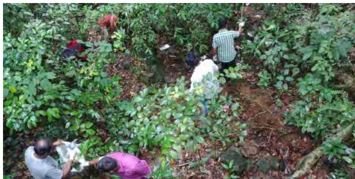
Volunteers collecting plastic waste from forests areas