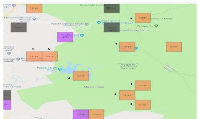
Bird Atlas sampling area map