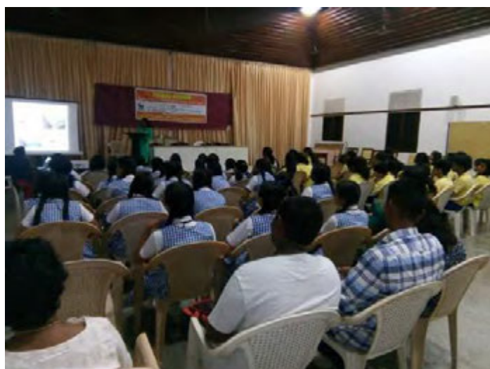
Friday Forum on the topic 'Our Ocean & Coast – Challenges and Conservation Action'