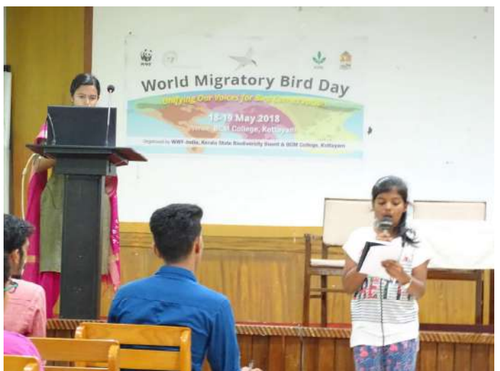
Presentation by participant students