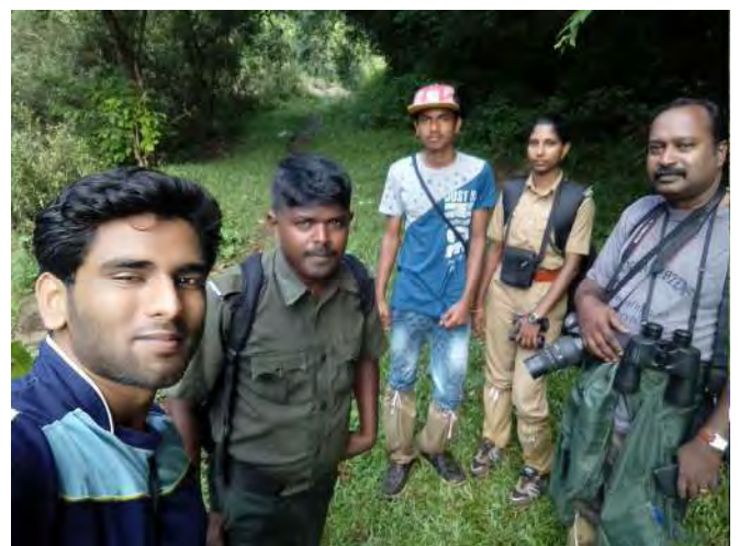
Participants of Periyar Tiger Reserve Bird Survey