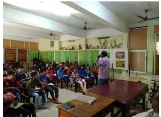
Talk in Nature Camp at Neyyar WLS