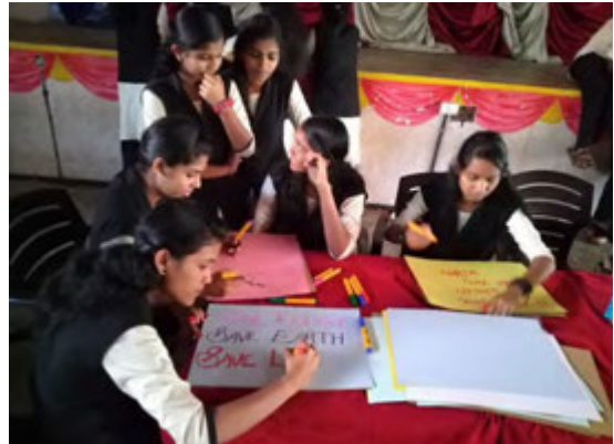
Urja Kiran 2017 – 18 – Awareness Programmes and Energy Conservation Rallies