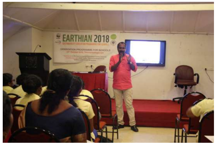
Session on Biodiversity and Sustainability