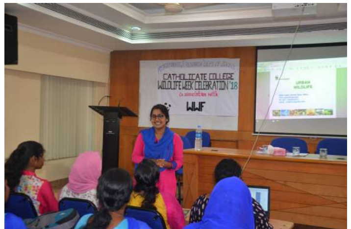
Session on Urban Wildlife