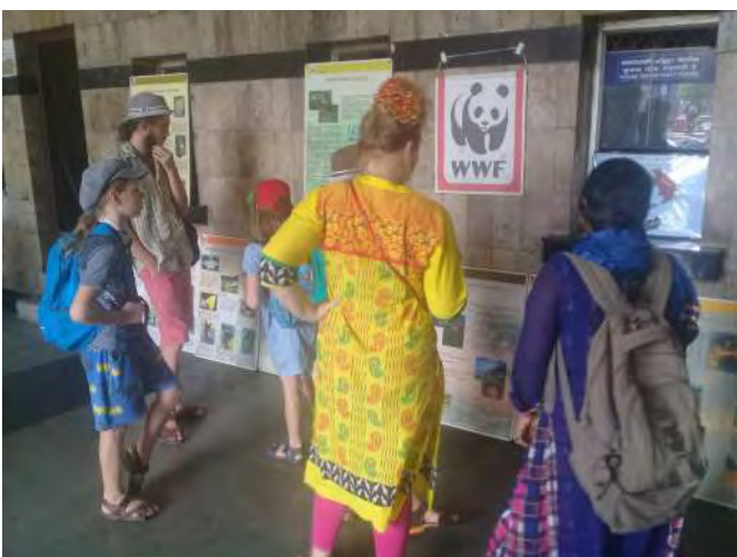
Earth Day - Exhibition at Railway Station