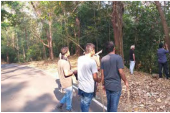
Field activities on Birds of Vazhachal