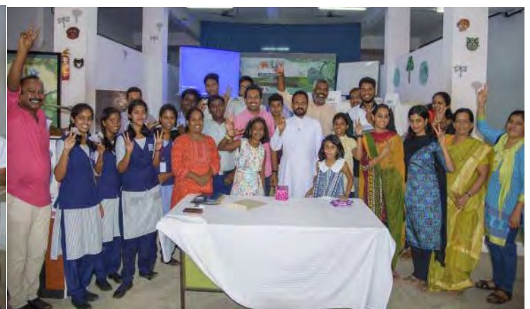
Volunteers and staff during the Quiz