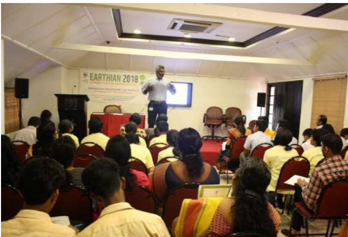
Session on Water and Sustainability