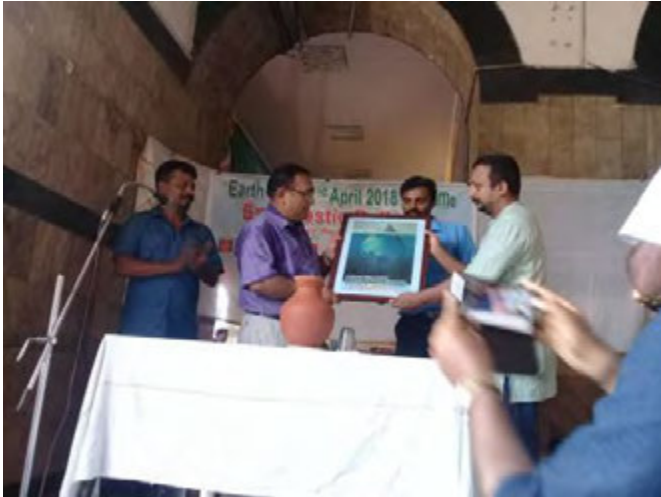
Earth Day - Inaugural session