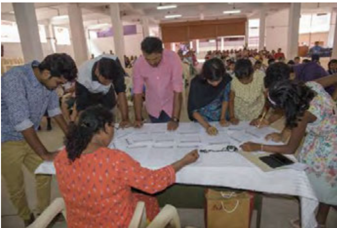
Volunteers in action during the Quiz