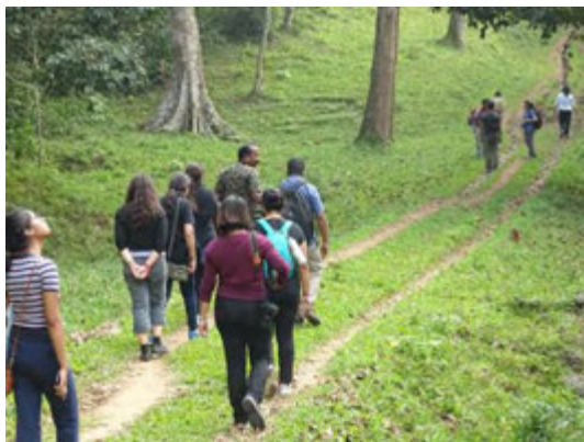
Field Study Trip for students of MSc Wildlife Science of TERI University