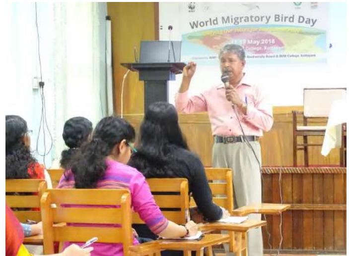
Session on Biodiversity Conservation initiatives by