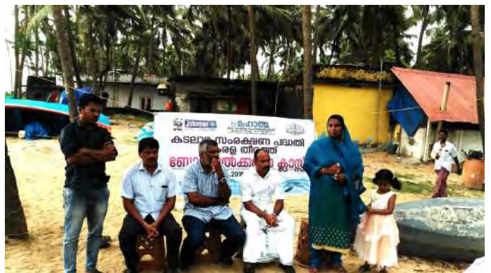
Interaction with the fishermen community