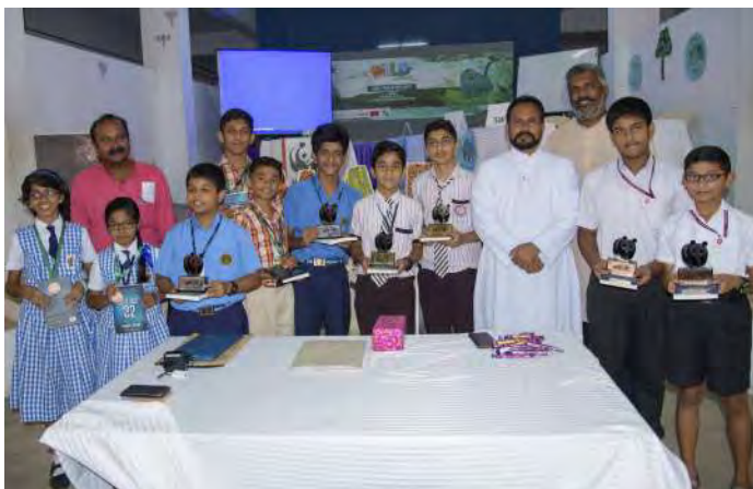
Winners of Middle Category at City Level