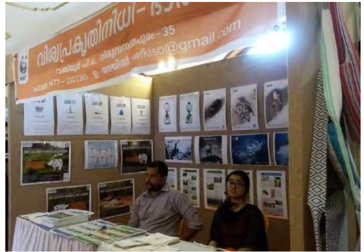
World Environment Day 2018 – WWF Exhibition Stall in the State Level Observation