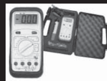
Underground Tank Anode Test Kit

Cathodic Protection Anode Testing & Line Locating Equipment