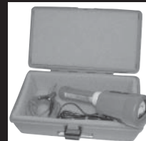
Underground Tank Anode Test Kit