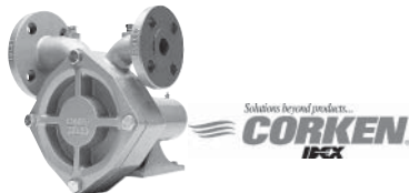
Solutions beyond products... CORKEN IFCX