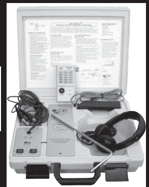
Cable Hound DSP Pipe & Cable Locator

Contact GEC to Schedule On-Site Training in Cathodic Protection