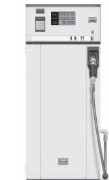
Parafour Innovations, LLC