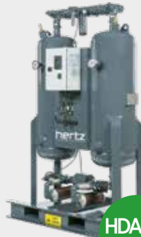
HDA US SERIES