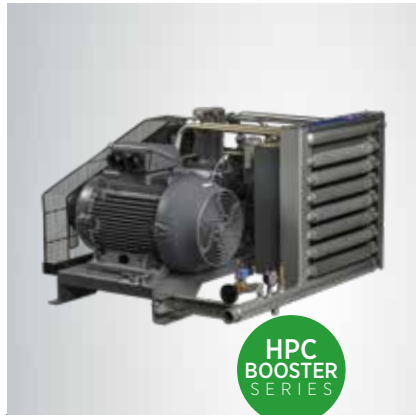
HPC BOOSTER SERIES