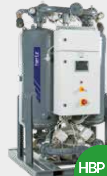
HBP US SERIES