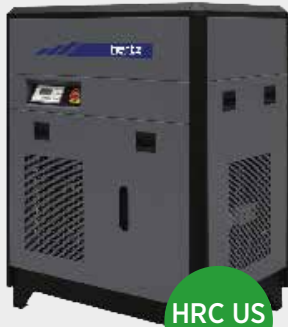
HRC US SERIES