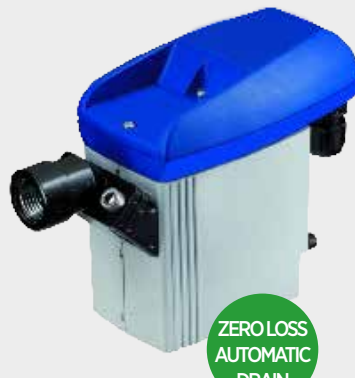
ZERO LOSS AUTOMATIC DRAIN