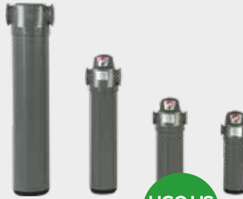
HGO US SERIES