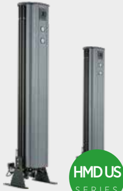
HMD US SERIES