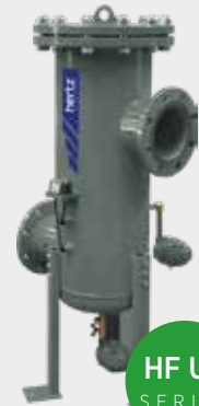
HF US SERIES