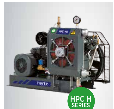
HPC H SERIES