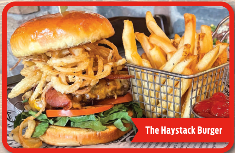
The Haystack Burger

Fire roasted pineapple, shaved ham, pepper jack cheese, lettuce and tomato.