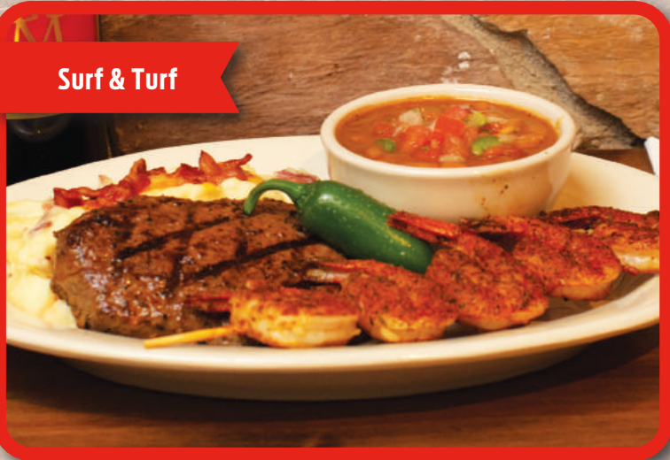
Surf & Turf

Hand breaded and tossed in our spicy wing sauce. Served with ranch or bleu cheese dressing and fries.