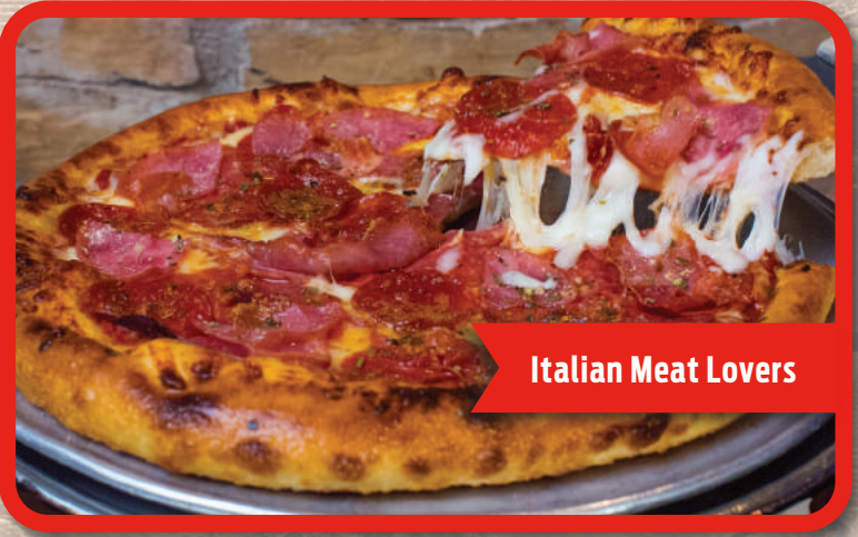
Italian Meat Lovers

Alfredo sauce, mozzarella, fresh baby spinach and charbroiled chicken breast.