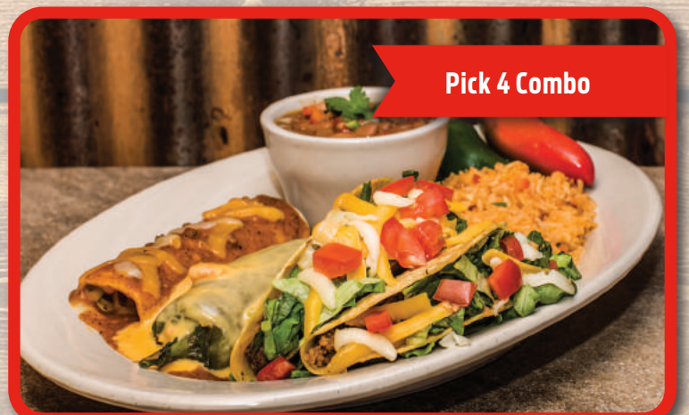
Pick 4 Combo

Available sauces: red, tomatillo, sour cream or queso