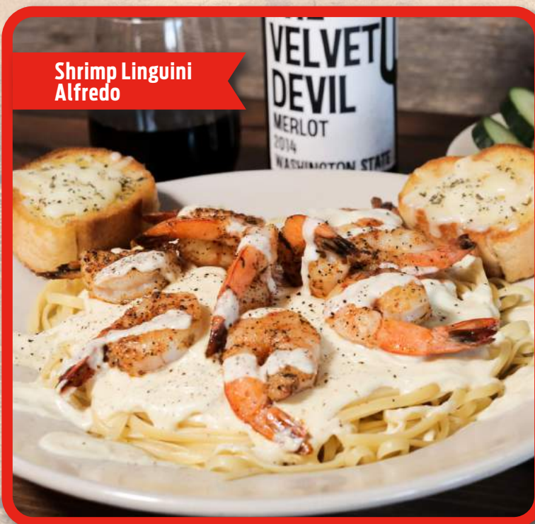
Shrimp Linguini Alfredo

House or Caesar side salad or cup of soup 2.00 with any meal.