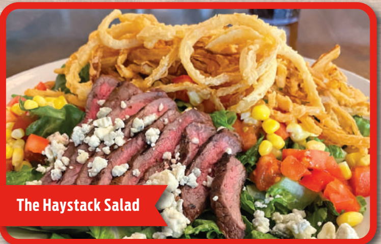
The Haystack Salad

Haystack Salad 13 NEW Mixed greens, sirloin steak, bleu cheese crumbles, kernel corn, tomatoes, and crispy onion strings. Your choice of dressing.