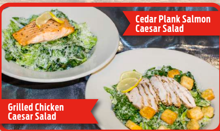
Cedar Plank Salmon Caesar Salad

Bowl of Soup 6 Choose from Creamy Potato Soup or Chicken Tortilla Soup.