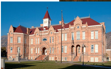
Provo's historic Academy Library