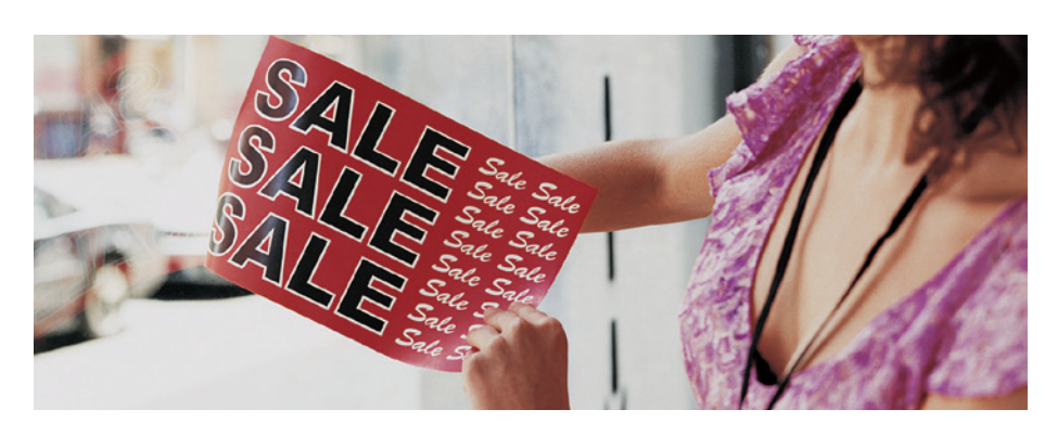
Xerox® NeverTear Window Signs

Our special polyester EA Low Melt Toner fuses the output to polyester using a proprietary chemical bonding methodology, ensuring superior image quality on specialty substrates including polyester and more. Our EA Toner including Premium NeverTear is water, oil, grease and tear resistant.