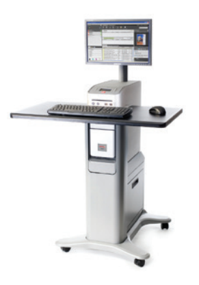
Xerox® EX C60/C70 Print Server Powered by Fiery®

Powerful server with color tools, workflow capabilities, and blazing speed, all at your fingertips. The ultimate in control and consistency.