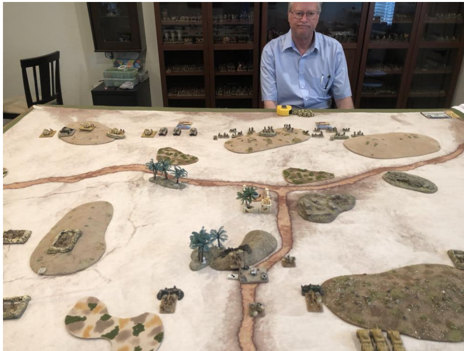
(General Irons contemplating the attack)

The British armor division under General Irons was ordered to take the Faid southern passes. Thus at dawn they launched a surprise attack on the weak Italian line.