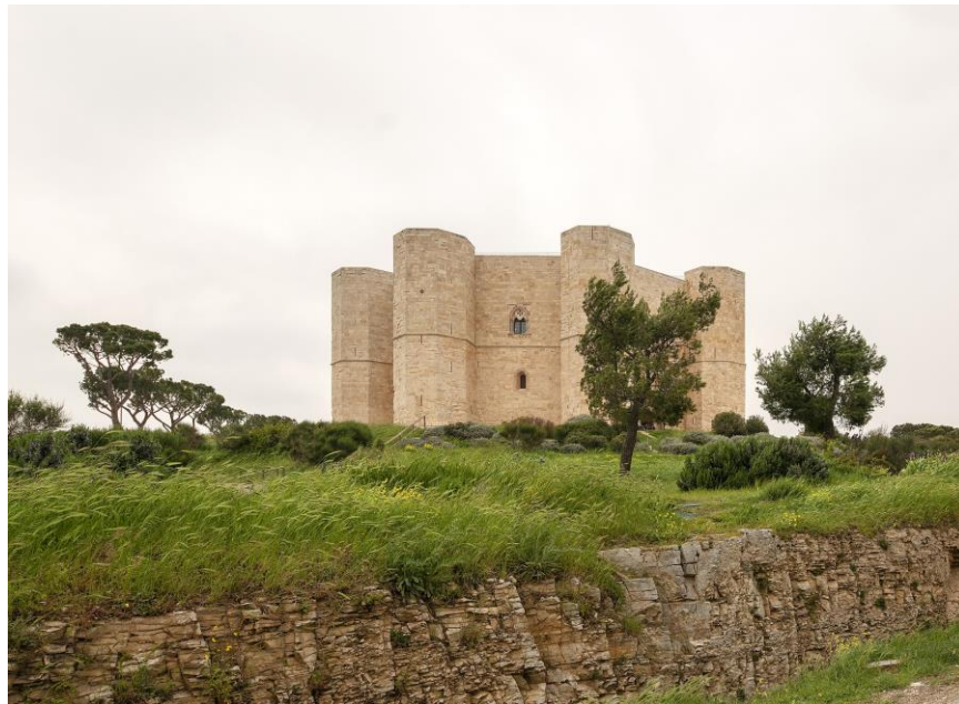
Castel del Monte, built during the 1240s by the Emperor Frederick II.