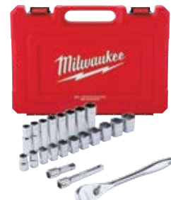
22-Piece 1/2" Drive Ratchet & Socket Set - S.A.E. MIL48-22-9410 $209.50 ea.