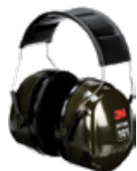
MMM7A - $26.95/pr Over-the-Head (NRR 27dB)