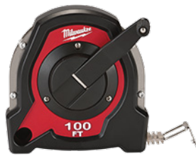
100ft Closed Reel Long Tape MIL48-22-5101 $26.00 ea.