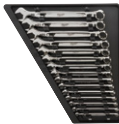
15-Piece Combination Wrench Set - Metric MIL48-22-9515 $125.35 ea.