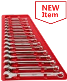
15-Piece Combination Wrench Set - S.A.E. MIL48-22-9415 $125.35 ea.