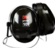
MMM7B - $28.15/pr Behind-the-Head (NRR 26dB)