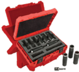
9-Piece SHOCKWAVE™ 1/2" Deep Well Socket Set MIL49-66-4484 $92.70 ea.