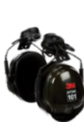
MMM7P3E - $20.50/pr Cap Mounted (NRR 24dB)