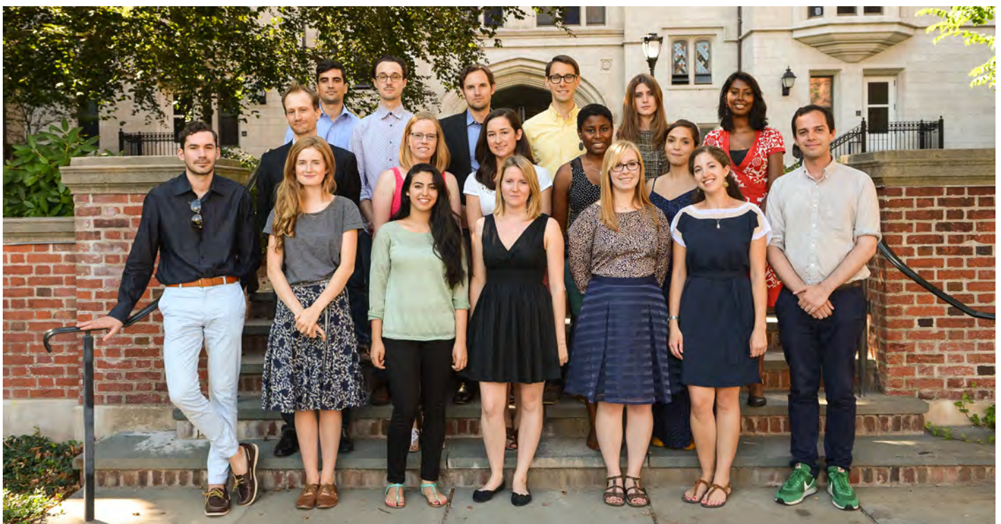
Below: Graduate Students in The Yale Department of French, Fall 2014