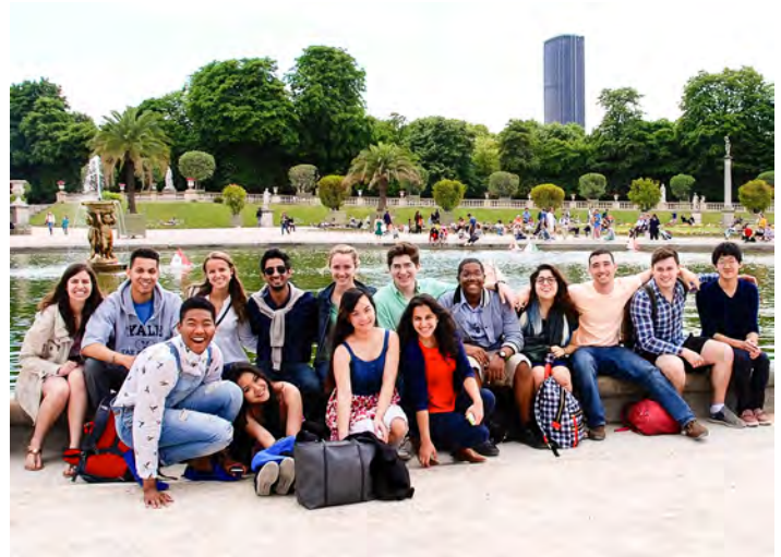
Summer 2014 Yalies at the Jardin du Luxembourg

In a short four weeks in the Elm City, MATUKU NGAME and CANDACE SKORUPA prepared the 13 students of the L1/L2 level (FREN 110/120) for their 4 weeks in Paris. Most activities in Paris were inspired by French in Action locales, from the Closerie des Lilas to the Jardin du Luxembourg. The students loved visiting the Opéra Bastille for the ballet Notre-Dame de Paris , as well as their adventures to the medieval town of Provins (the hometown of Colette in French in Action! ), with a dégustation of all things rose, and to the Loire Valley to visit Chenonceaux, Chambord, and Blois (though we did not see Hubert!).