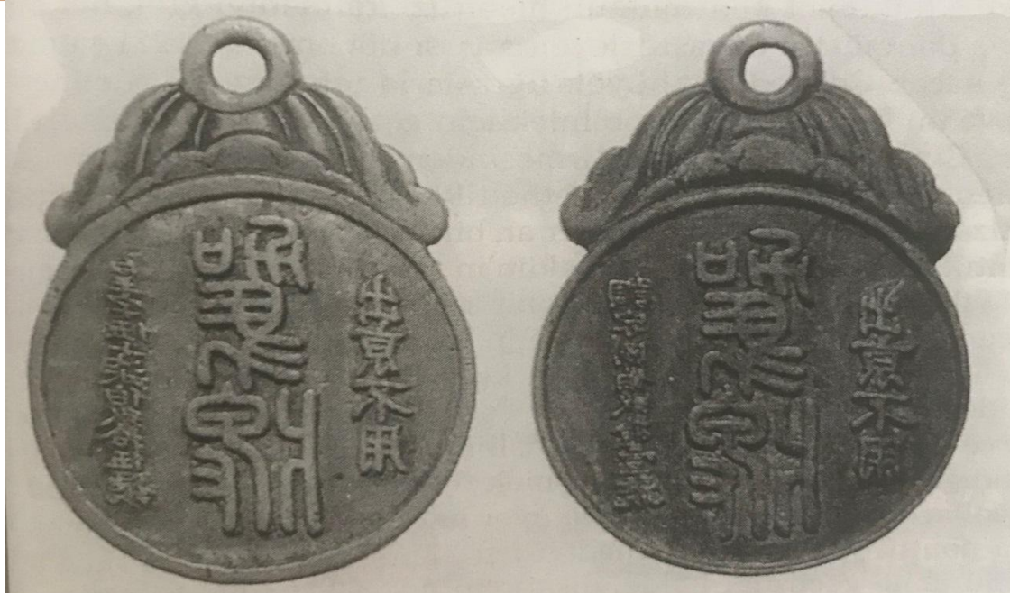
Figure 1: Bronze payza sample that messengers carried as identity. 6