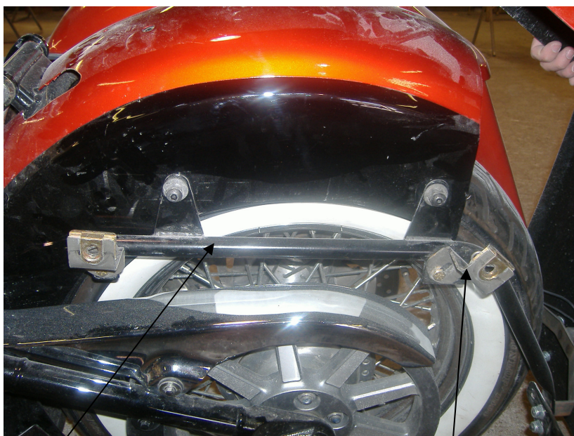
Upper Bag Support