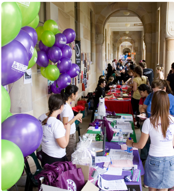
"O Week" activities.

You can join more than 100 clubs and societies, so if you have a special interest or hobby, there's bound to be one for you. Join the Medieval Society, the Hip Hop Society, or just join in the fun.