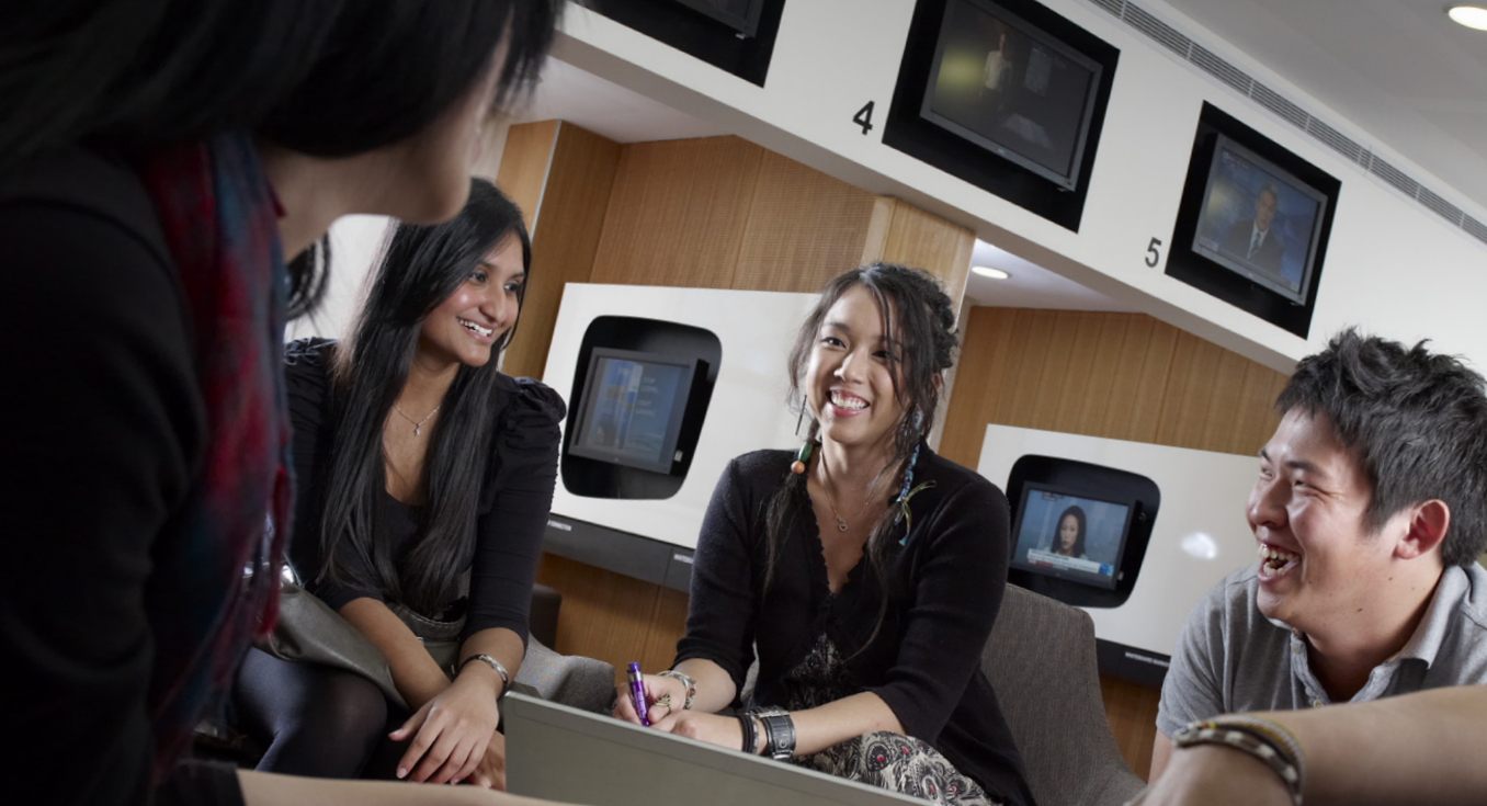
Students in the School of Journalism's Ideas Space