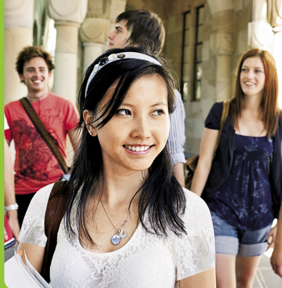
UQ students in the Great Court cloisters, St Lucia.