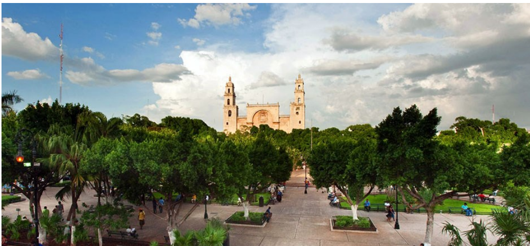
Yucatan's capital city, Mérida. Text credit: www.yucatansecrets.com

haciendas, as well as restaurants, travel agents, car rental companies, and much more.