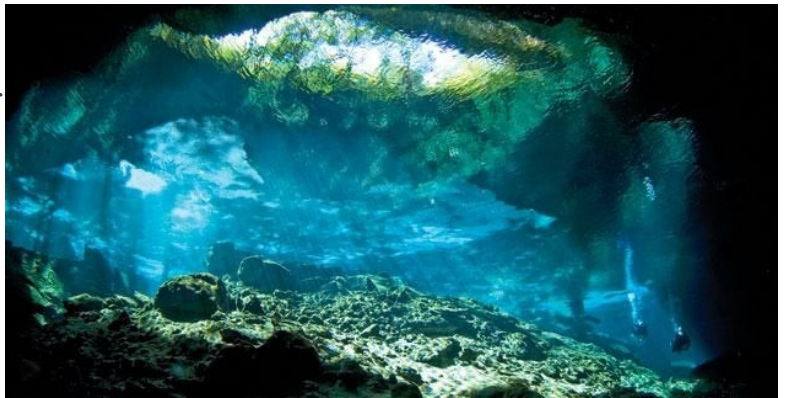
One of the famous cenotes of Yucatan.

Between the 16th and 19th centuries Yucatan was involved in various armed conflicts, such as pirate attacks off the coast and indigenous uprisings against the Spaniards. At the same time, the people of Yucatan produced and exported the plant known as henequen or sisal, which triggered the growth of the capital city of Merida; during this period, the Paseo de Montejo Avenue was founded, with European-style residences and many haciendas built around the state, where the sisal plant was processed.