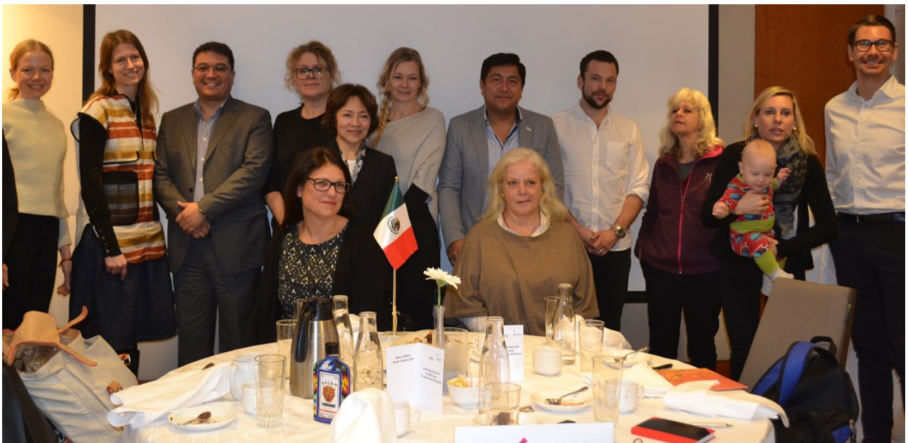
Tour operators, agents and journalists at the Puerto Vallarta tourism event organised by the Embassy of Mexico.

At this very successful meeting, representatives from the most important agencies and tour operators of Sweden were in attendance, such as TUI and Ving, which are currently the only operators established in Stockholm that offer charter flights to Mexico. Also present were members of important media publications, such as the magazines RES and Vagabond, the two main publications specialising in tourism in Sweden. In addition, representatives of other travel agencies with interest in Mexico and their new destinations, as well as important independent journalists and bloggers, also participated.