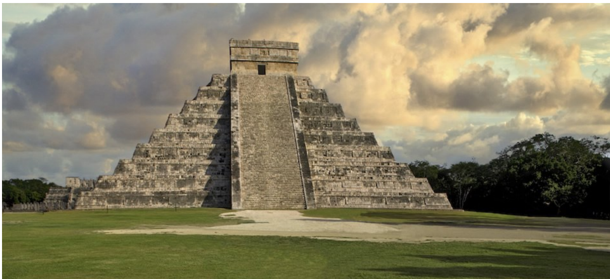
Chichén Itzá, Yucatán. Photo and text credits: www.visitmexico.com