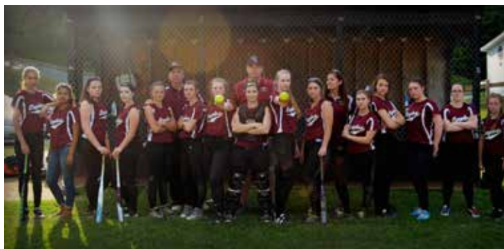
Varsity Softball makes Final Four for third straight year.