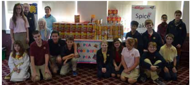
Junior High Student Council Service