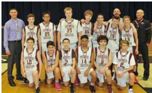
Grade 7-8 Boys Basketball win GENH League Championship.