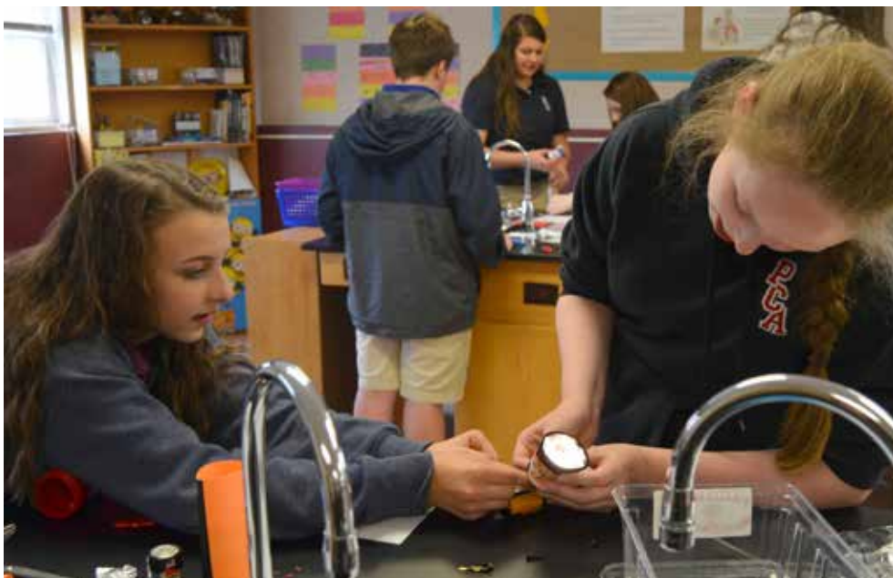
Eighth graders ENGINEERING flashlights