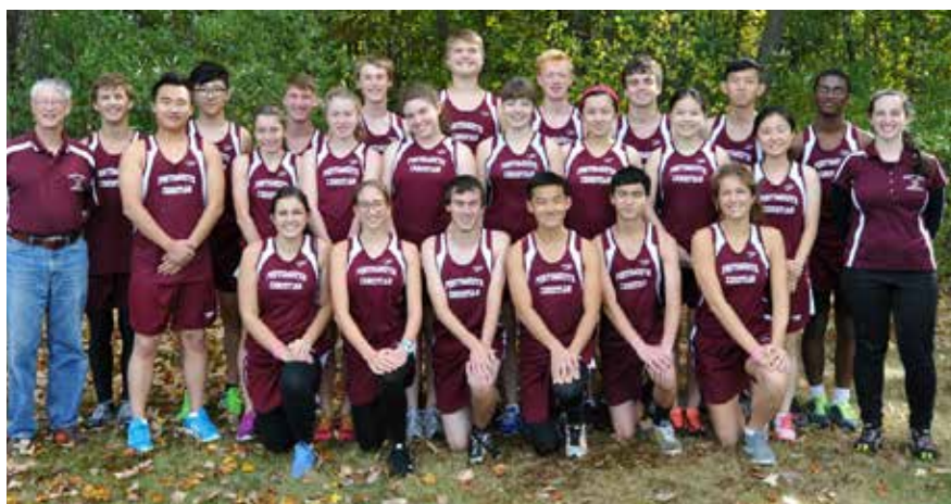
The 2015-16 Varsity Cross Country team was the largest in school history and both Boys and Girls were runners up in D4.