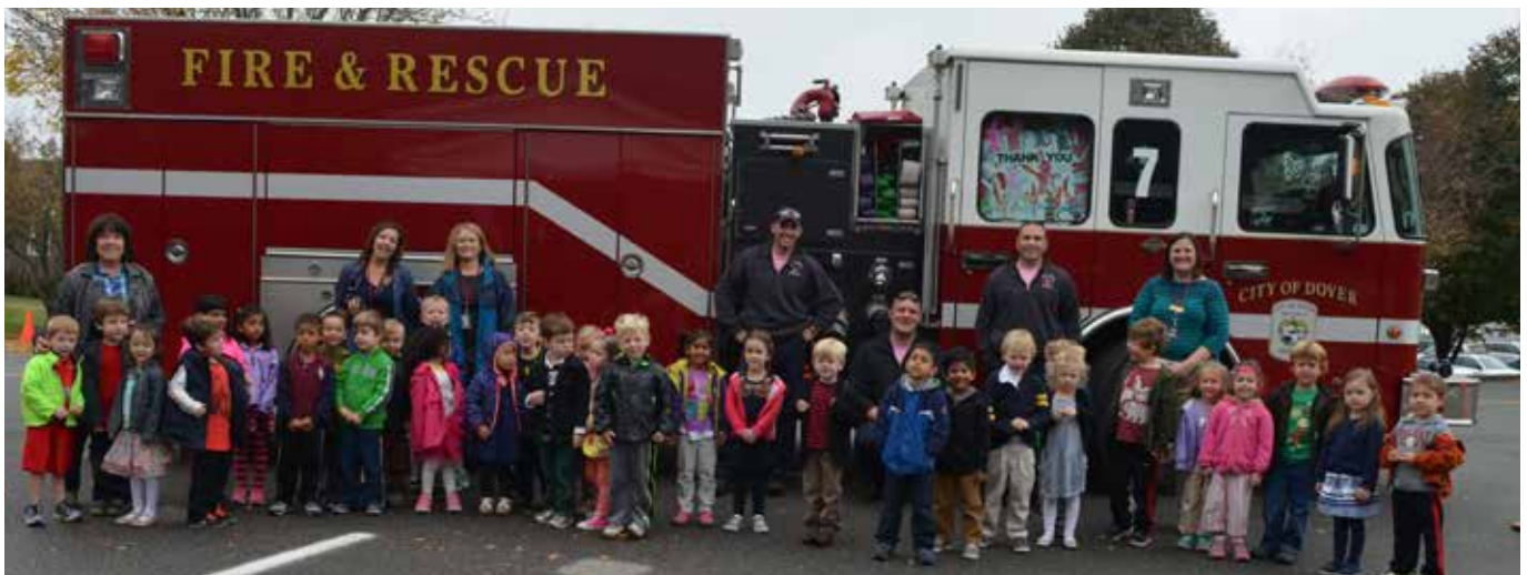
Dover Fire Department visits PCAP