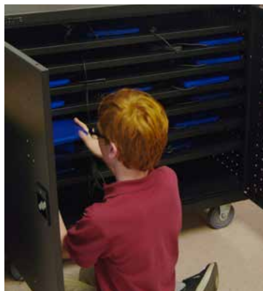
Malcolm Beal inspects the MATH lab