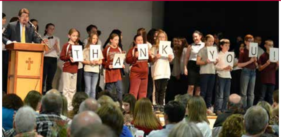
PCA students thank bidders at the Annual Auction for supporting the Tuition Assistance Program

Find out more about partnering in support of PCA's mission at pcaschool.org/giving .