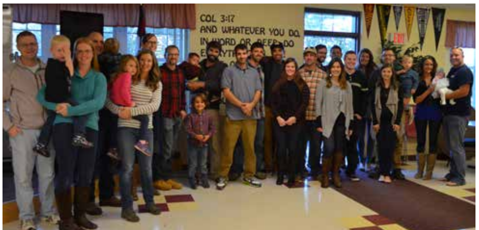
Members of the Class of 2005 celebrate their reunion at Homecoming