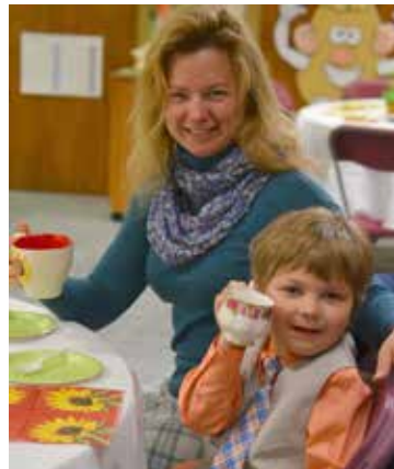
Mother's Day Tea Party