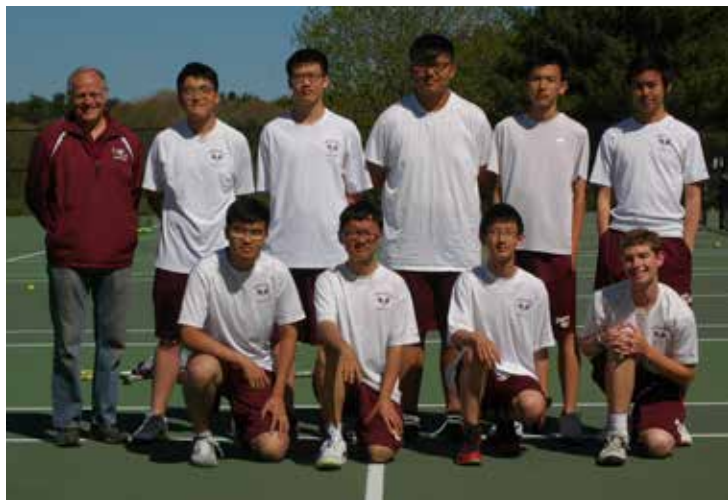
PCA Varsity Boys Tennis Team is first to make the playoffs.