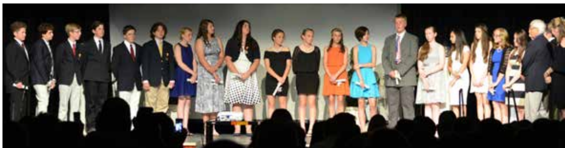
8th Grade Milestone Ceremony