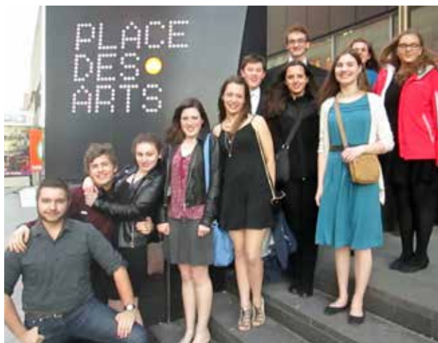
Students visit Quebec on a combined Music and French trip.