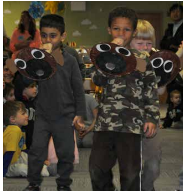
Monkeys in the annual telling of the Kapok Tree story