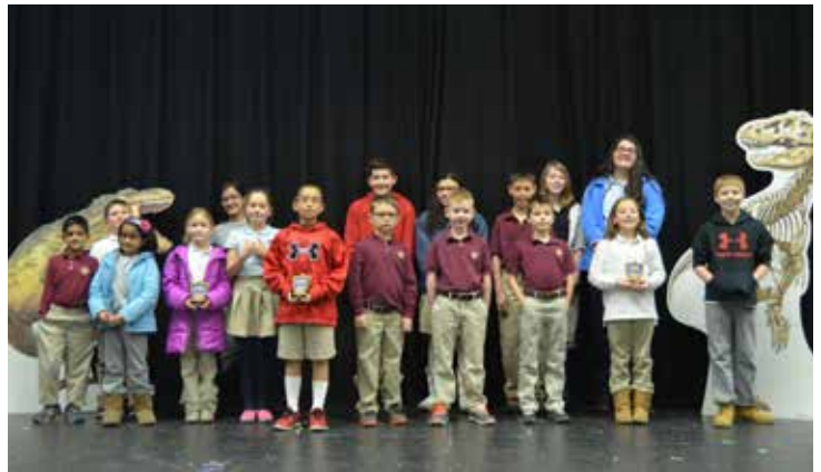
Read-a-thon Class Winners