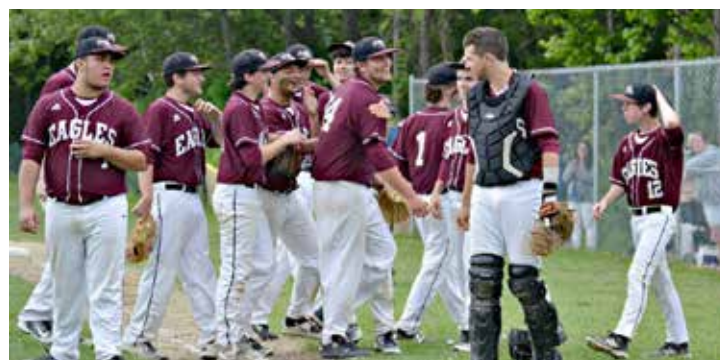
Varsity Baseball followed up their 2015 championship with another visit to the Final Four this year.