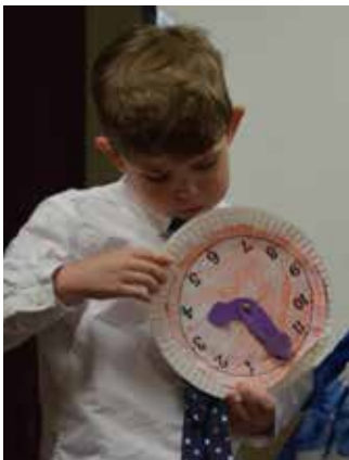
Learning to tell time in PCAP