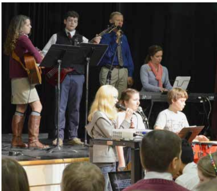
The Chapel Worship Team leads praise singing.