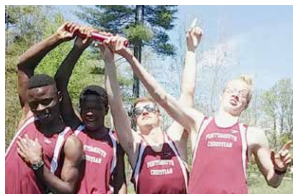
Varsity Track Boys 4x800 finished fourth in the D3 Championship.

Cross Country and Track had amazing seasons with many records broken!