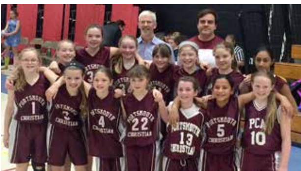
Grade 5-6 Girls Basketball completed their season undefeated.