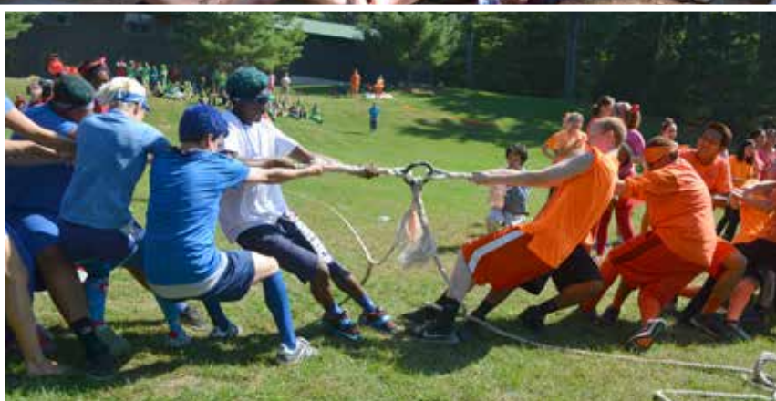
The Upper School kicked off the school year with Fall Spiritual Emphasis Days and the annual retreat at Camp Brookwoods.