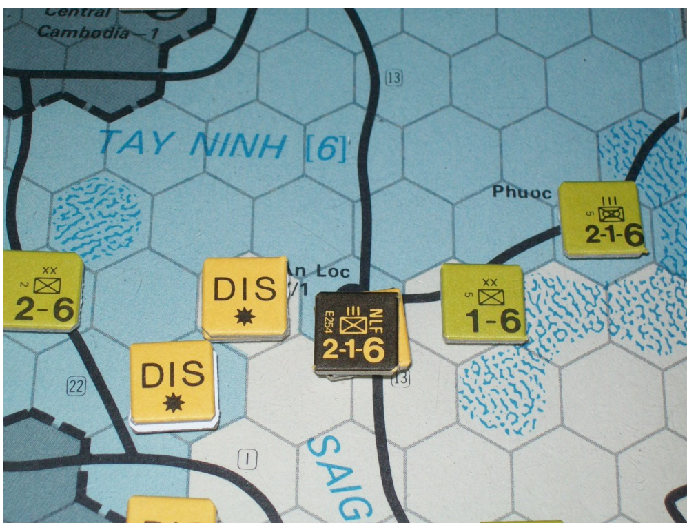
South Vietnamese Player