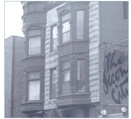
The Steak Joynt

Today at Adobo Grill you’ll find Mexican cuisine