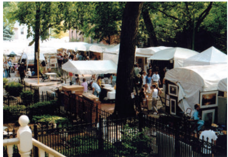
Looking forward to a perfect summer for our 64th Old Town Art Fair

In other art fair news, you might have noticed that our Facebook page is growing week by week at www.facebook.com/oldtownartfair . So