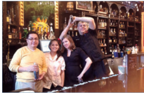
Friendly faces and superb drinks at Adobo Grill