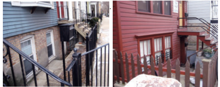
(L to R) A brick and frame structure today at 1616 N. Cleveland with its raised sidewalk. A frame structure today at 1625 N. Mohawk with its raised sidewalk.

The sewer installation-street raising efforts required landfill, dredged from the Chicago River or, later, gathered from Fire rubble. Next time you see a street being dug, you might spot the evidence... or even find a man on his horse. 🇺🇸