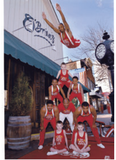
The Lawson triplets with Illinois Secretary of State, Jesse White and the other Jesse White Tumblers"

While it is a challenge to have four boys in four different Chicago Public Schools, I feel very blessed and grateful to be living in Chicago and in our neighborhood. My boys are all able to get to school on their own because of our great location and public transportation. It seems like just yesterday when we cruised the sidewalks of Old Town, North Avenue Beach, the zoo and the many playgrounds in the Runabout® triplet stroller. 🌈