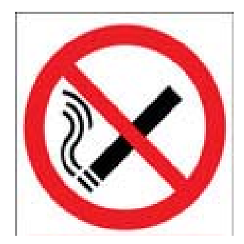
Figure 1: No Smoking

See the guidance document Inspection and Approval of Agrochemical Stores by Pollution Control and Fire Prevention Officers for BASIS Registration Ltd; see Annex 6 for details.