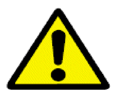
Figure 3: General Danger (BS 5378)

If you store more than 25 tonnes of dangerous goods, then the requirements of Regulations 5 and 6 of the Dangerous Substances (Notification and Marking of Sites) Regulations 1990 (which are enforced by the Fire Authority) should be followed. The hazard warning symbol and hazard warning text on such signs will depend upon the types of hazards stored.