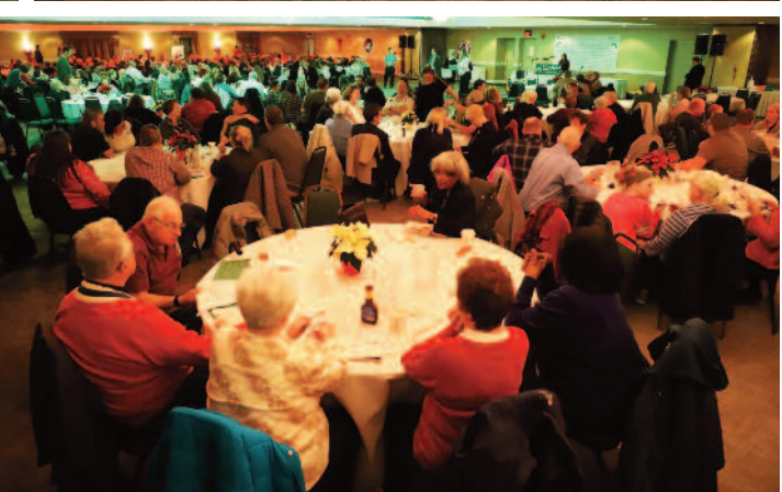
A full house: Westland residents and Chamber members look forward to this culinary extravaganza every year!