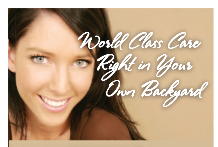
Comprehensive, Complete Family Dental