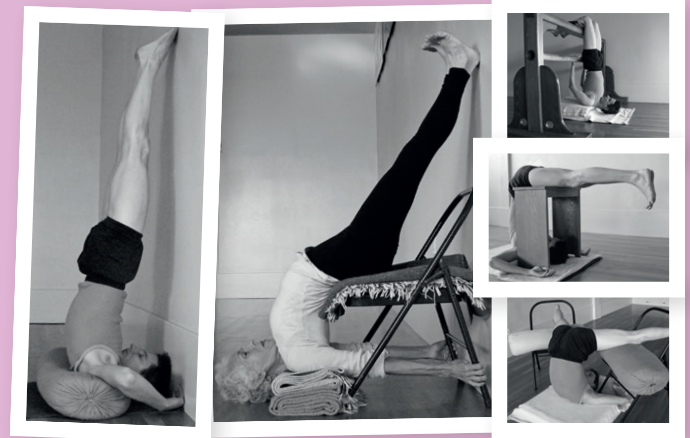
Different variations with props of Sarvangasana (shoulderstand) cycle. CLOCKWISE FROM LEFT Niralamba Sarvangasana at wall benefits systemic problems (endocrine, etc.) relieves mental fatigue, benefits reproductive organs; Sarvangasana on Chair increases chest opening (cardiac patients, shoulder problems), reduces pressure on head and lungs (high blood pressure, asthma, neck problems, mental fatigue), abdominal organs relax (gastrointestinal problems, pregnancy); Sarvangasana at trestle improves spinal alignment (disc, sciatica, back ache), increases circulation around spine (arthritis, degeneration, of disc/bone), relieves neck pain; Ardha Halasana with bench rests body and mind, decreases insomnia, relaxes back muscles; Supta Konasana with legs on bolsters on chairs opens pelvic region and widens buttock bones (constipation, hemorrhoids, pregnancy) and increases circulation to pelvic region.

ways so that the poses can be held for optimal amounts of time. Inversions are a critical tool to aid the immune system and props enable students to hold inversions for prolonged periods for maximal benefit.