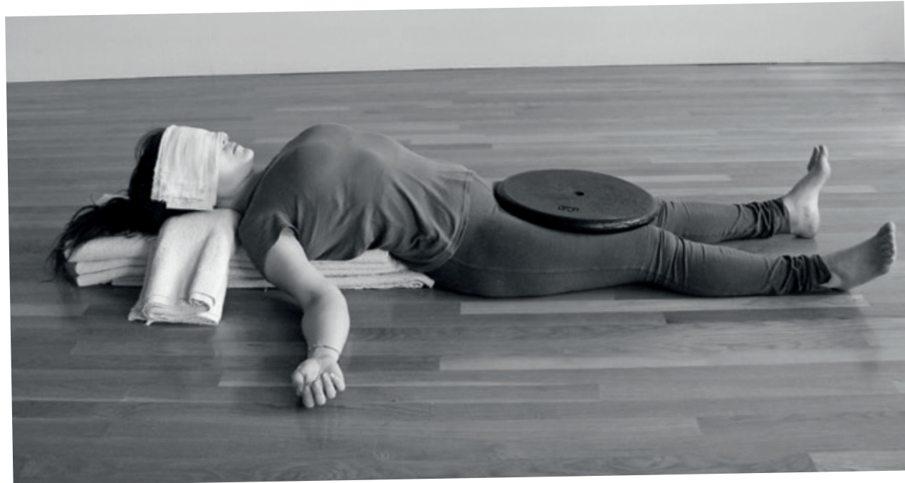
Supported Savasana with blankets, eye bandage and weight

the nervous system and mind. In order to cultivate the body and the mind for pranayama, it can be practiced in a supine position in a supported version of Savasana (Corpse pose) rather than in a seated position. The brain and nerves relax while one is lying down. The prop support improves respiratory functioning and allows the organs involved in the respiratory process to broaden and take the shape required for stress-free pranayama practice.