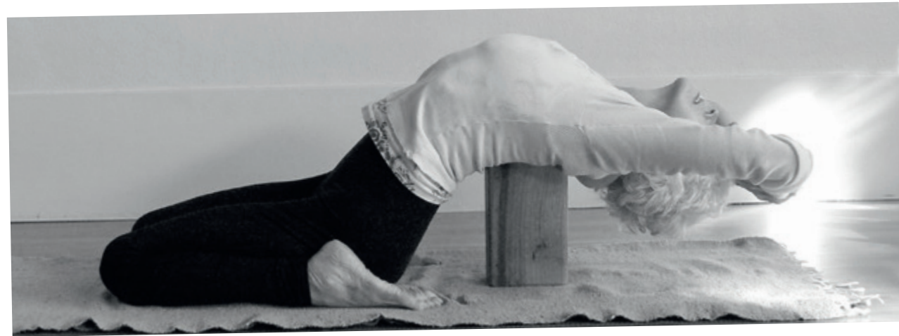
Paryankasana with brick

enable the surrounding body to relax while the targeted areas work more intensively. The prop can transform a pose that could be potentially harmful when done incorrectly, to a pose that brings tremendous relief.