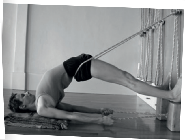
TOP LEFT Setubandha Sarvangasana over cross bolsters creates space in pelvis and relaxes pelvic organs (menstruation) BOTTOM LEFT Setubandha Sarvangasana on bench nourishes heart, lungs (asthma, colds), helps with immune disorder, fatigue RIGHT Setubandha Sarvangasana (Bridge Pose) with ropes gives lumbar extension and open chest cavity