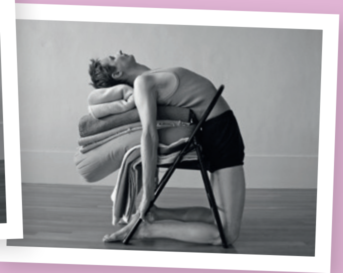
LEFT Ustrasana (Camel Pose) RIGHT Ustrasana with chair and bolster and blankets

As a support, a prop can also help the patient overcome fear (of falling, losing balance, etc.). Fear can prove to be an impediment in the yoga practice. The protection response to fear can frequently cause one to hold the breath,