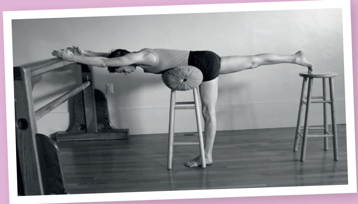
Virabhadrasana III with support of trestle & stools

to tighten the very muscles and organs that need to relax and extend, or to compensate with gross misalignments in the pose that can destabilize the pose and make one vulnerable to injury.