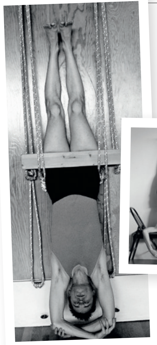
LEFT Sirsasana (Headstand) on ropes RIGHT Sirsasana between two chairs

In a therapeutic prescription the sequence of the poses, the manner in which the pose is executed (the form and alignment) and the amount of time each pose is held is as important as the poses prescribed. In their supportive capacity, props can enable the student to hold the pose for a much longer duration than when performed independently. Whereas a patient with yoga experience may be able to hold Viparita Dandasana (an inverted backbend) for one minute, he or she can more easily hold the pose for 5-10