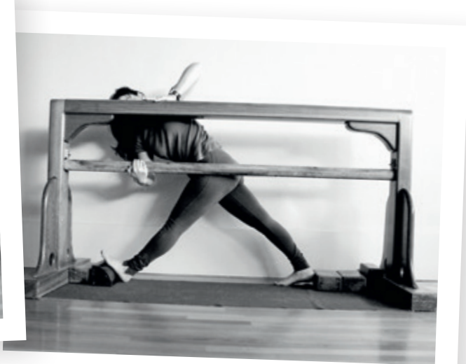
Parivrtta Trikonasana at trestle/horse