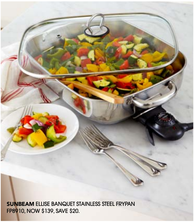
SUNBEAM ELLISE BANQUET STAINLESS STEEL FRYPAN FP8910, NOW $139, SAVE $20.