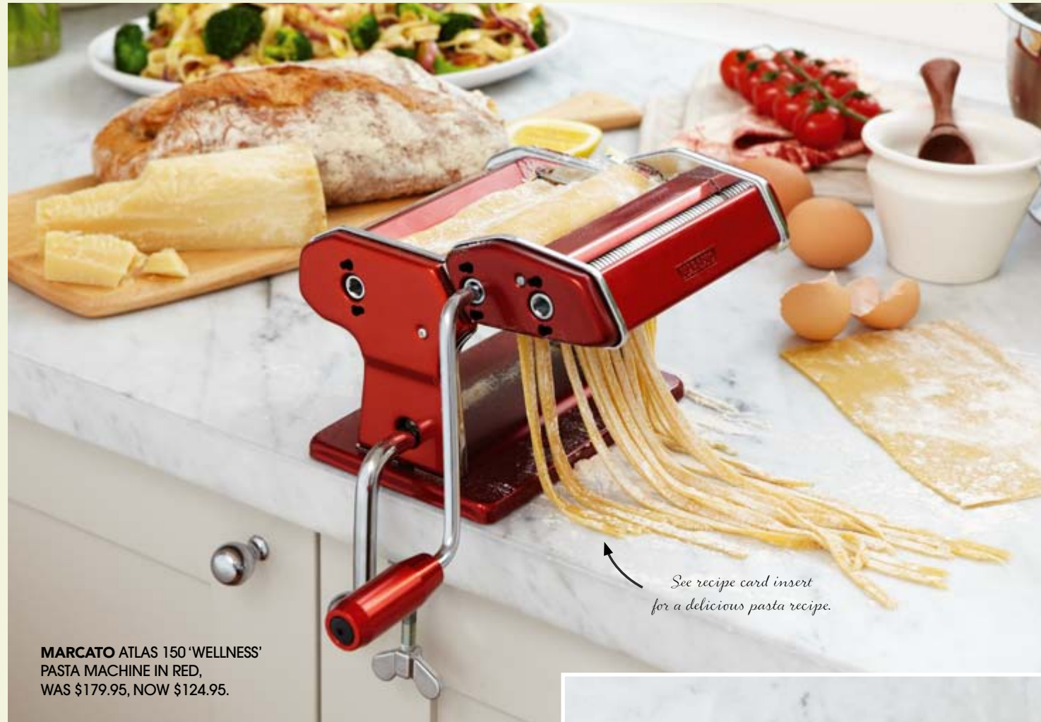
MARCATO ATLAS 150 'WELLNESS' PASTA MACHINE IN RED, WAS $179.95, NOW $124.95.

See recipe card insert for a delicious pasta recipe.