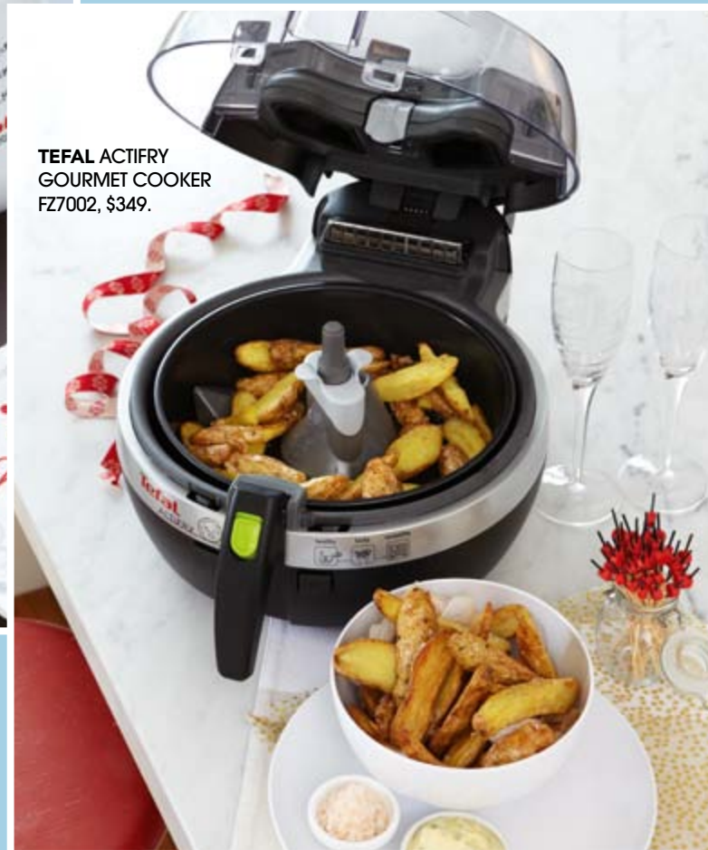
TEFAL ACTIFY GOURMET COOKER FZ7002, $349.