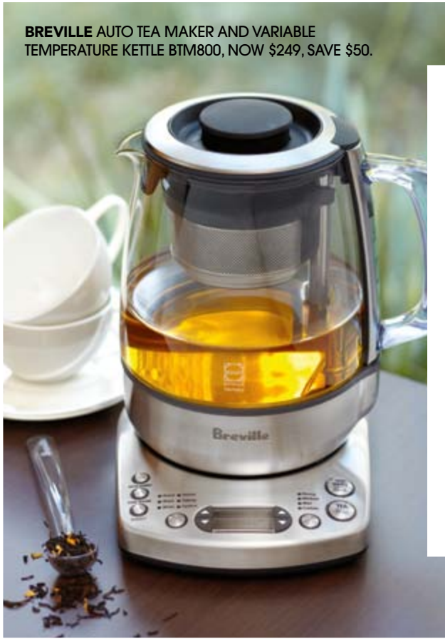
BREVILLE AUTO TEA MAKER AND VARIABLE TEMPERATURE KETTLE BTM800 , NOW $249, SAVE $50.

Tea for two, or your favourite brew? These kitchen wizards will ensure you wake up to the best for breakfast.