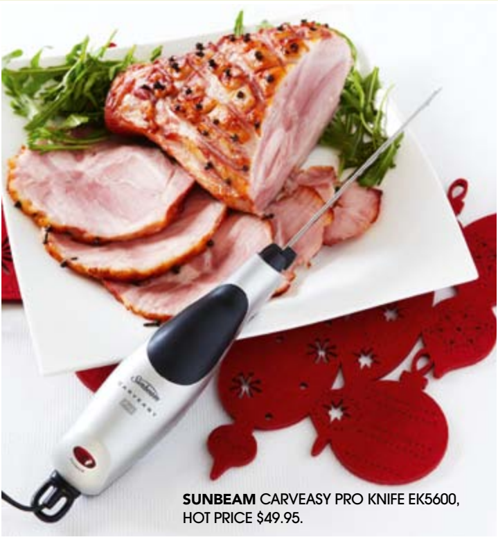
SUNBEAM CARVEASY PRO KNIFE EK5600, HOT PRICE $49.95.

From simple snacks and sauces to masterful main meals and delicious sweet treats, let the feasting begin!