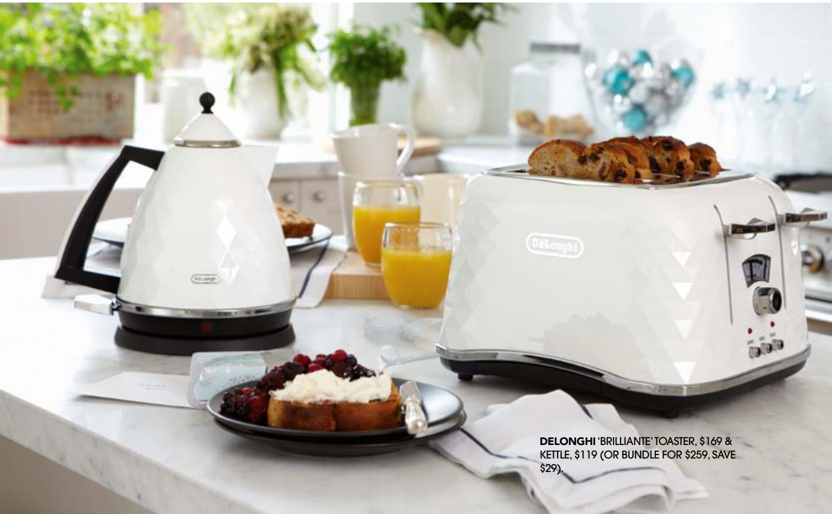
DE'LONGHI 'BRILLIANTE' TOASTER , $169 & KETTLE, $119 (OR BUNDLE FOR $259, SAVE $29).