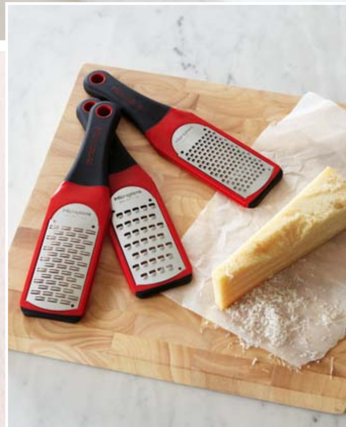
ABOVE: MICROPLANE GRATERS , WERE $22.95EA NOW $15.95EA. LEFT: EMILE HENRY CERAMIC PIZZA STONE, WAS $79.95 NOW $49.95.

See recipe card insert for a delicious pasta recipe.