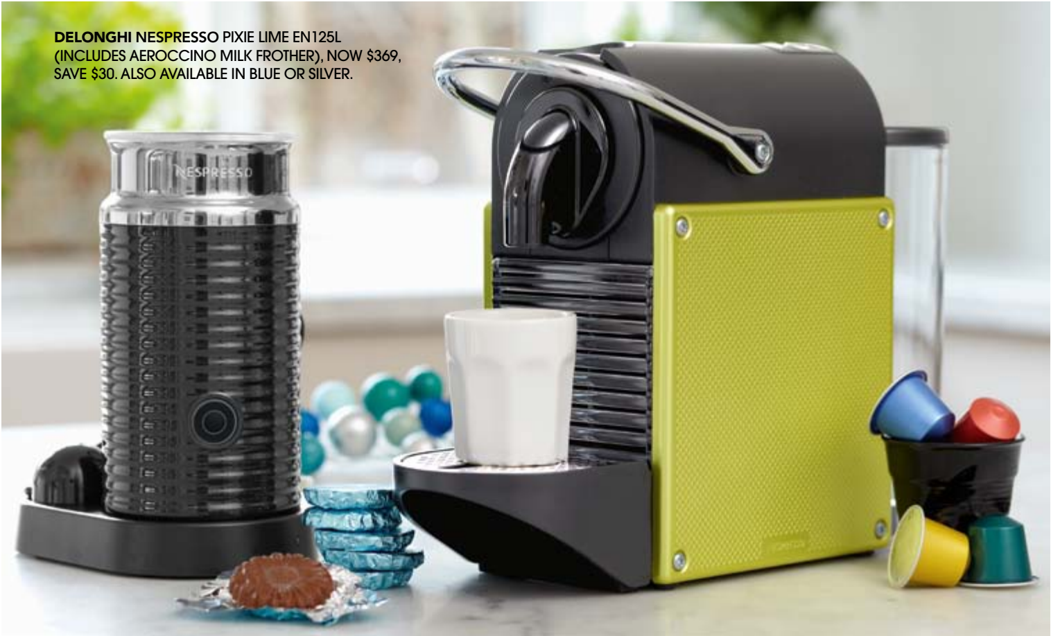
DE'LONGHI NESPRESSO PIXIE LIME EN125L (INCLUDES AEROCOCCINO MILK FROTHER), NOW $369, SAVE $30. ALSO AVAILABLE IN BLUE OR SILVER.