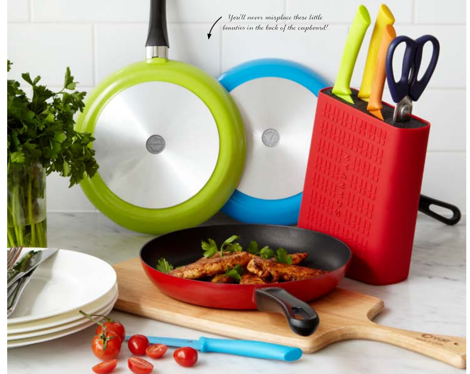
SCANPAN 'COLOUR BY CLASSIC' 26CM FRYPANS , WERE $179, NOW $119.95 EA; SCANPAN 'SPECTRUM' 6-PIECE COLOURED KNIFE BLOCK , $99.95 (EXCLUSIVE TO MYER - INCLUDES 14CM SANTOKU KNIFE, 9CM UTILITY KNIFE, 18CM BREAD KNIFE, 18CM COOK'S KNIFE, SHEARS AND KNIFE BLOCK. PIECES VALUED AT $147.70 WHEN PURCHASED SEPARATELY. VALUED BY SUPPLIER AND NOT ALL INDIVIDUAL ITEMS ARE AVAILABLE.)

You'll never misplace these little beauties in the back of the cupboard!