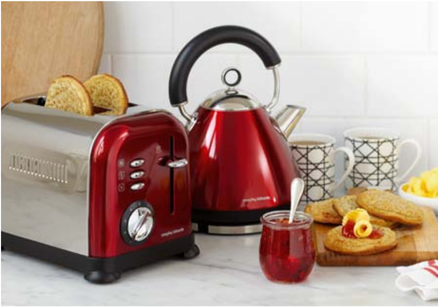
MORPHY RICHARDS 'ACCENTS' RED KETTLE 43857 $129 & 'ACCENTS' RED 2-SLICE TOASTER 44742, $84.95 (OR BUNDLE FOR $169, SAVE $44.95).