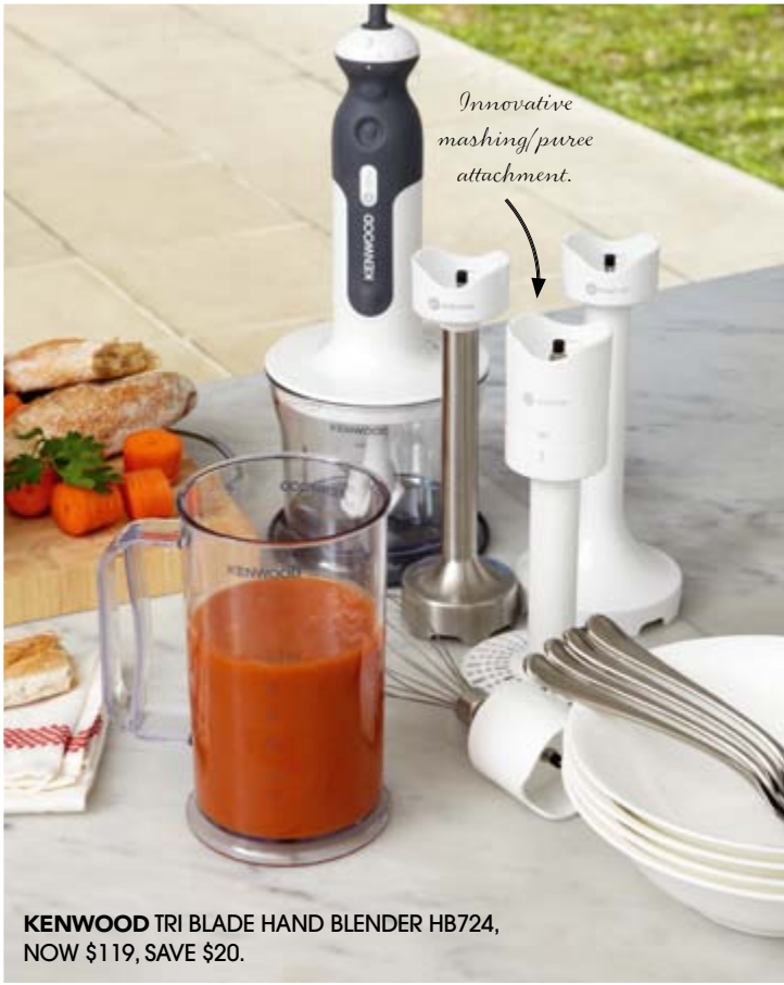
KENWOOD TRI BLADE HAND BLENDER HB724, NOW $119, SAVE $20.