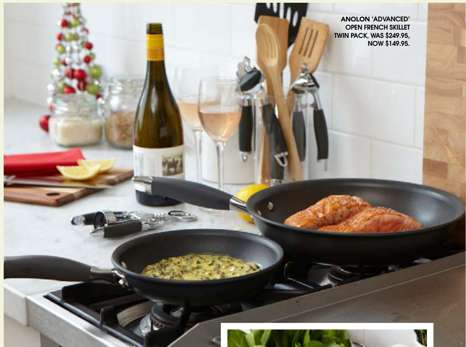
ANOLON 'ADVANCED' OPEN FRENCH SKILLET TWIN PACK, WAS $249.95, NOW $149.95.