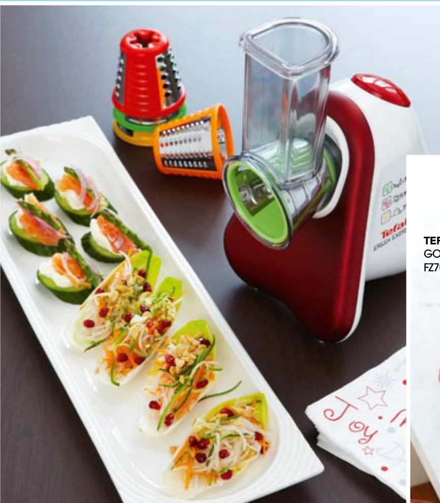
TEFAL FRESH EXPRESS SLICER/GRATER MB750, $89.95.