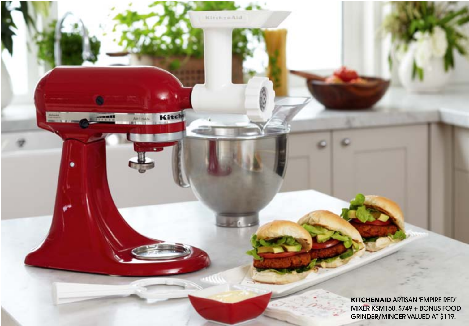
KITCHENAID ARTISAN 'EMPIRE RED' MIXER KSM150, $749 + BONUS FOOD GRINDER/MINER VALUED AT $119.