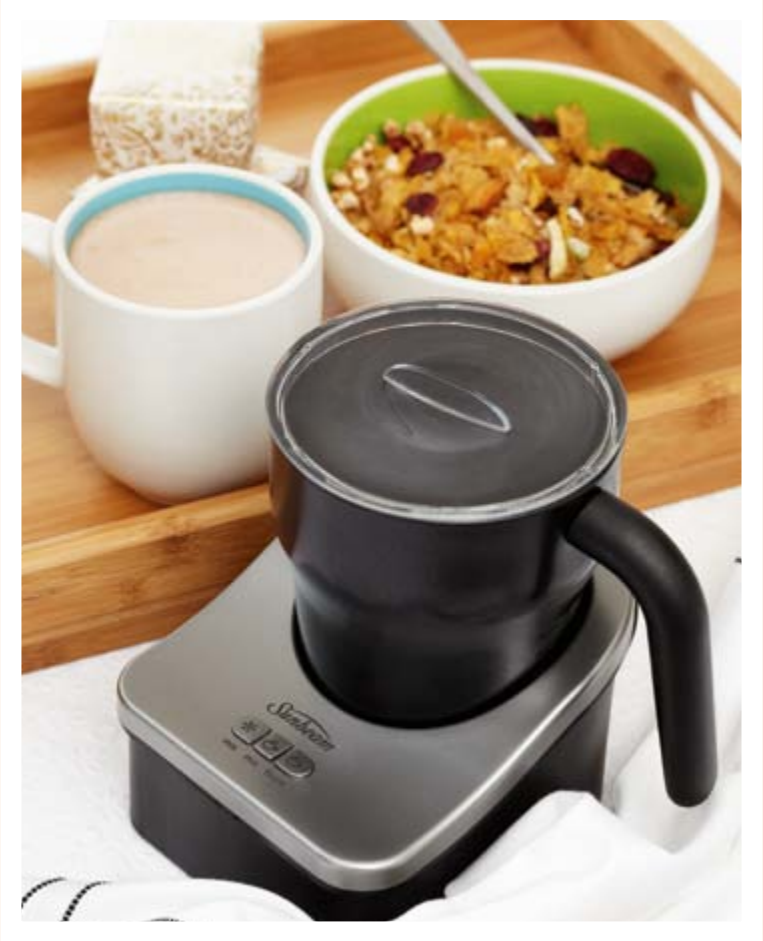
SUNBEAM CAFÉ CREAMY MILK FROTHER EMO180 , NOW $69.95, SAVE $10.