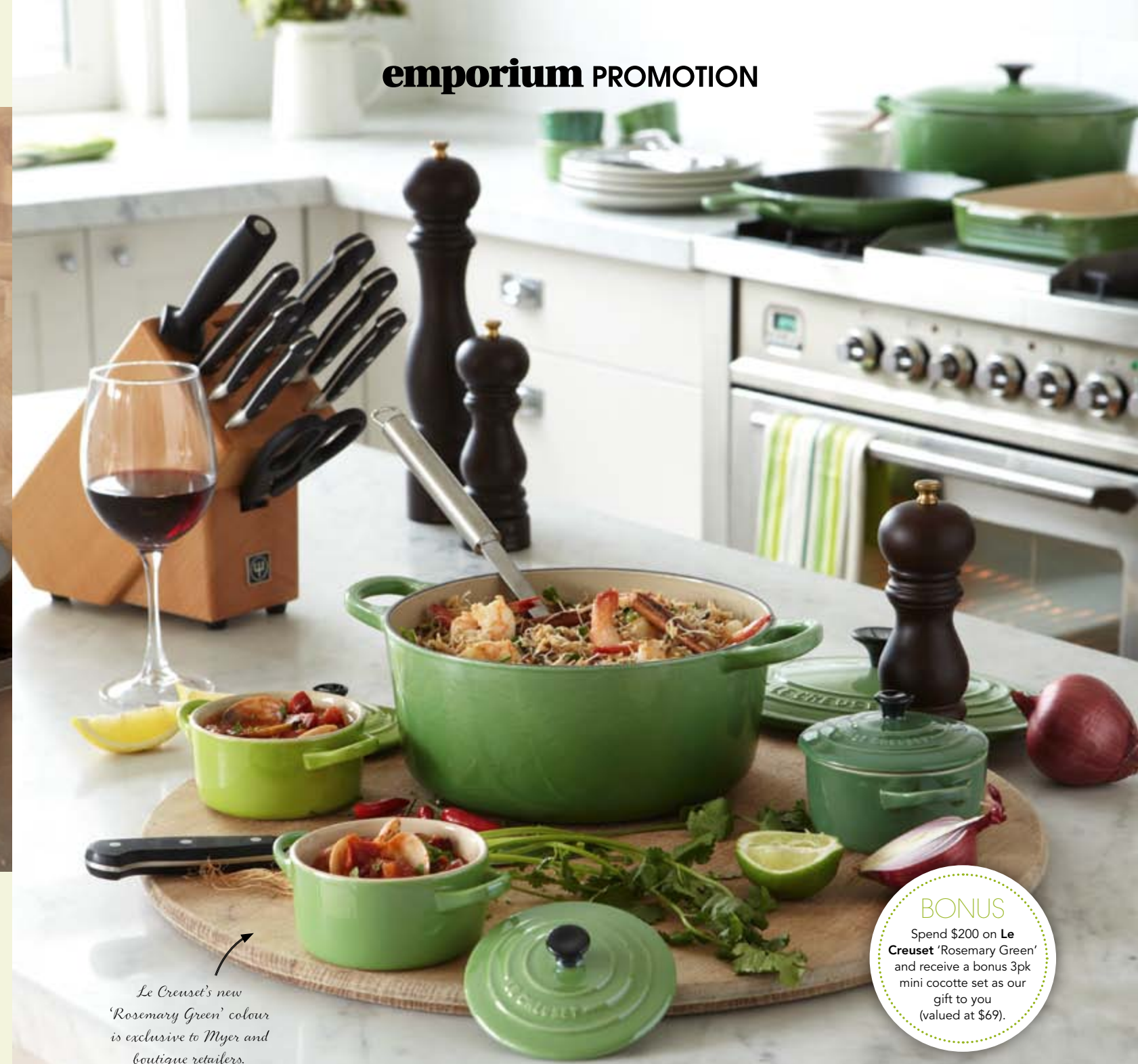
Le Creuset's new 'Rosemary Green' colour is exclusive to Myer and boutique retailers.