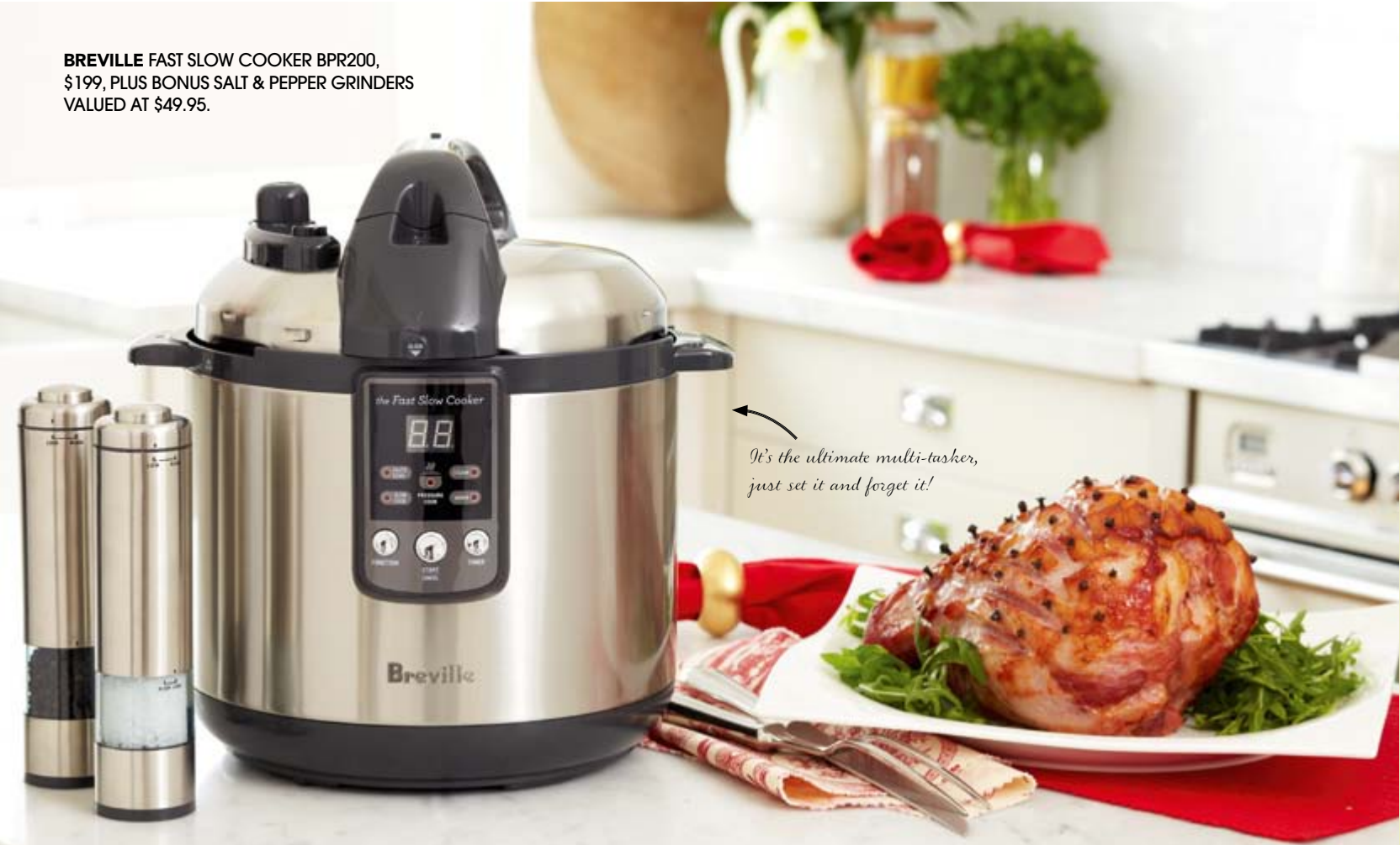
It's the ultimate multi-tasker, just set it and forget it!

From simple snacks and sauces to masterful main meals and delicious sweet treats, let the feasting begin!