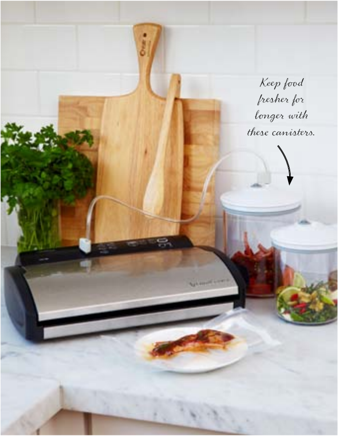
Keep food fresher for longer with these canisters.