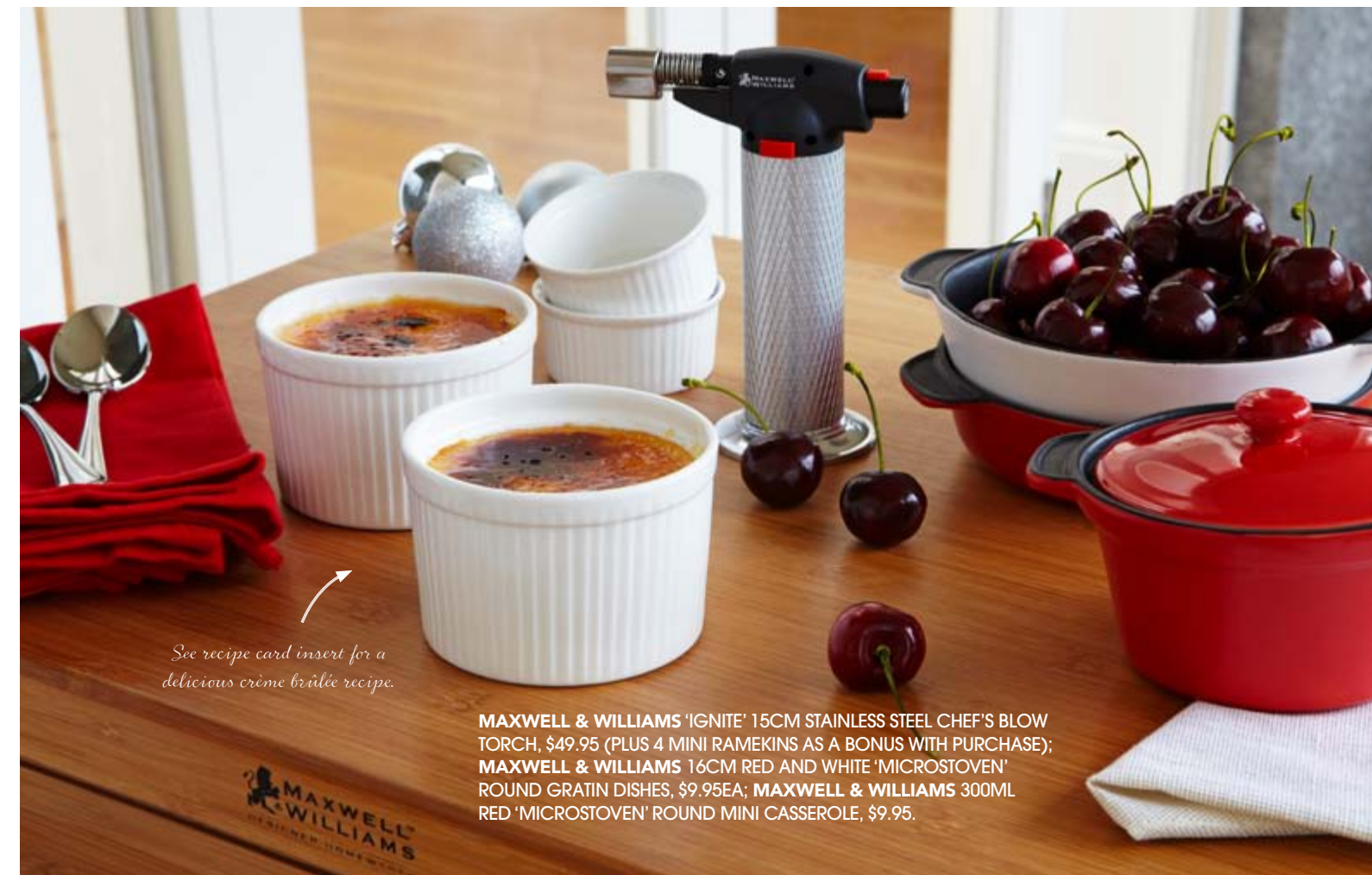
MAXWELL & WILLIAMS 'IGNITE' 15CM STAINLESS STEEL CHEF'S BLOW TORCH, $49.95 (PLUS 4 MINI RAMEKINS AS A BONUS WITH PURCHASE); MAXWELL & WILLIAMS 16CM RED AND WHITE 'MICROSTOVEN' ROUND GRATIN DISHES, $9.95EA; MAXWELL & WILLIAMS 300ML RED 'MICROSTOVEN' ROUND MINI CASSEROLE, $9.95.