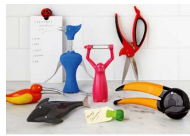
ABOVE: ANIMAL HOUSE KITCHEN GADGETS, FROM $9.95. RIGHT: MAXWELL & WILLIAMS 6-PIECE COLOURED KNIFE BLOCK SET, WAS $49.95 NOW $29.95.