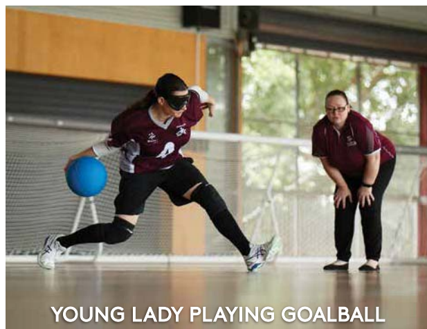
YOUNG LADY PLAYING GOALBALL

Health and fitness are essential—especially in our modern world. Small modifications to everyday activities can mean people who are blind or have low vision can participate fully in games and recreational activities.