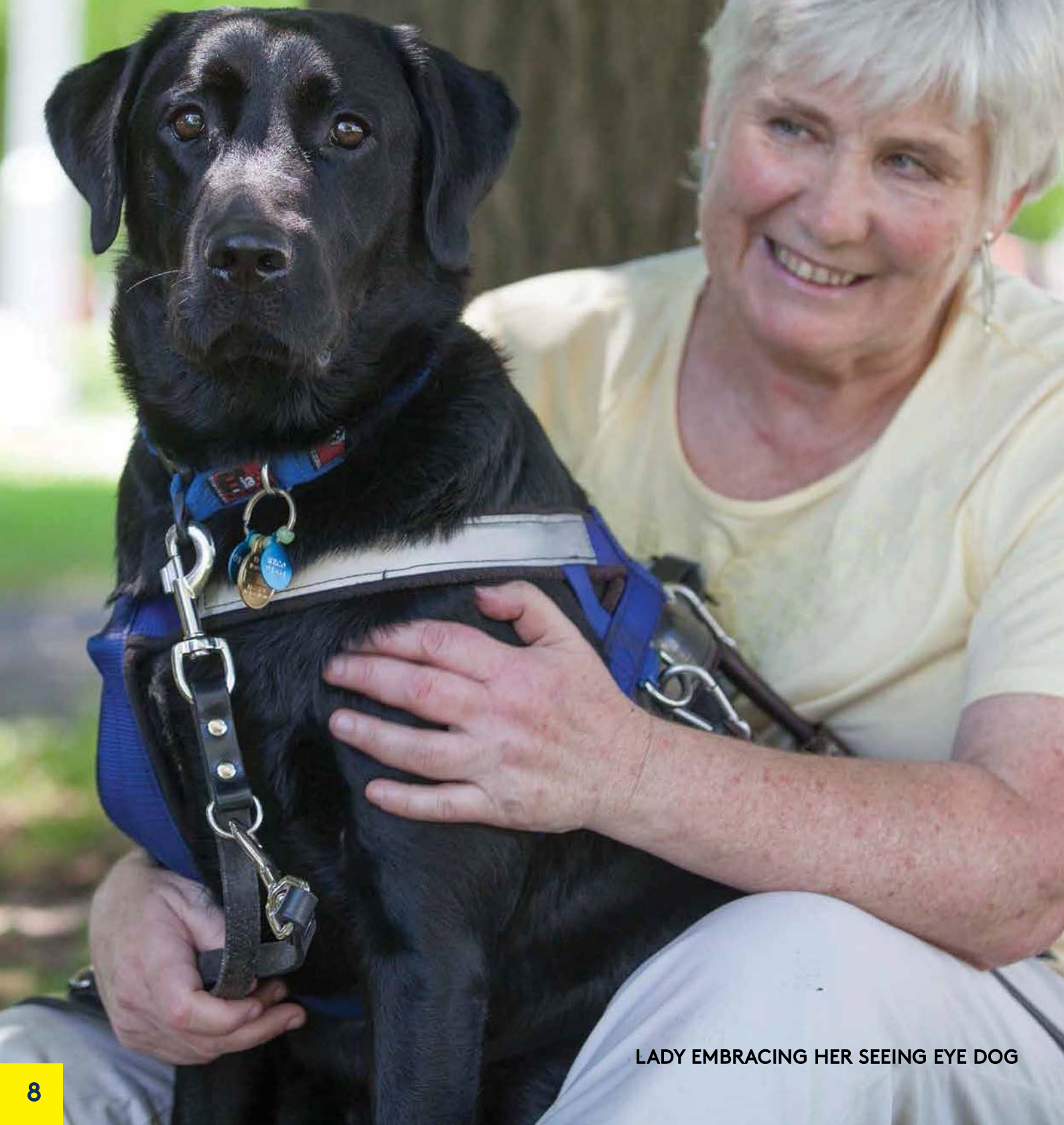
LADY EMBRACING HER SEEING EYE DOG

We are incredibly grateful for the generosity that ensures continued support and services for future generations of Australians who are blind or have low vision.