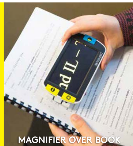
MAGNIFIER OVER BOOK

Every child deserves the chance to enjoy the same learning opportunities as their peers. By providing tailored support and specialist equipment, Vision Australia removes the barriers for people who are blind or have low vision, giving them more opportunities for a brighter future.