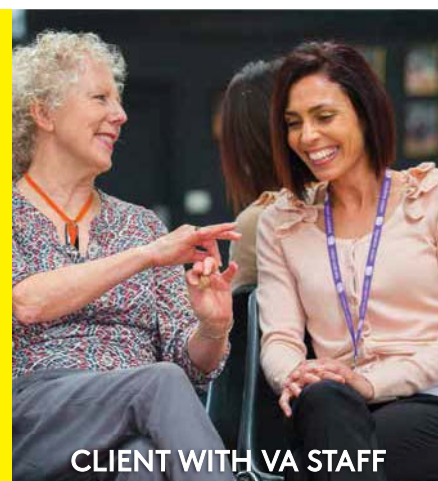
CLIENT WITH VA STAFF

Everyone should feel safe and able to complete life's daily tasks, while feeling part of their local community. Vision Australia's specialist support helps to build the mobility and skills needed to move safely throughout the world.