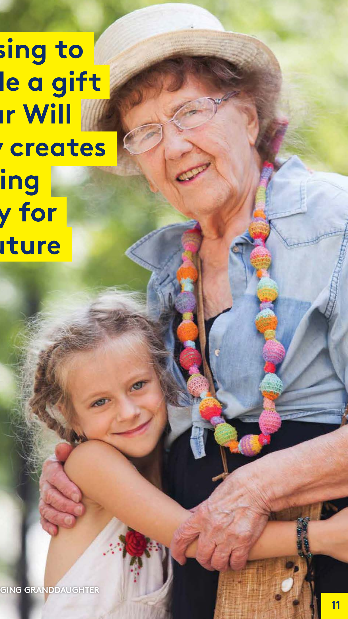
ELDERLY LADY HUGGING GRANDDAUGHTER

Choosing to include a gift in your Will today creates a lasting legacy for the future