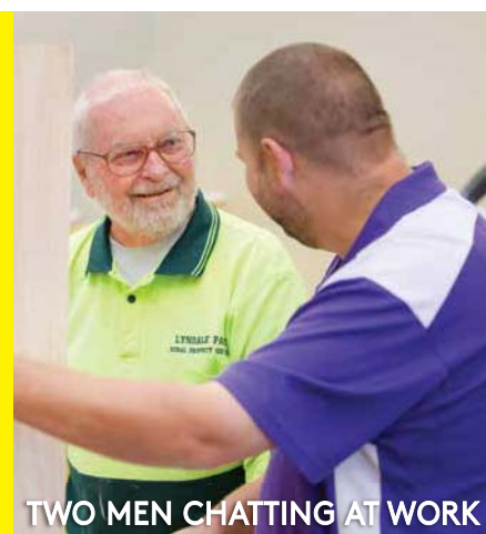
TWO MEN CHATTING AT WORK

By gaining the support they need to find meaningful employment, people who are blind or have low vision can lead fulfilling and independent lives.