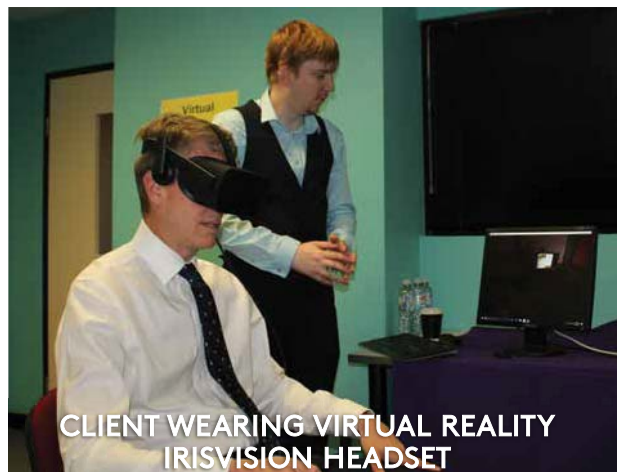
CLIENT WEARING VIRTUAL REALITY IRISVISION HEADSET

Modern technology means that our clinicians could have access to better, more precise diagnostic tools. New communication technologies help to expand our reach across the country.