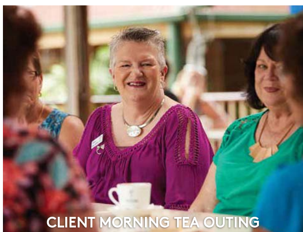
CLIENT MORNING TEA OUTING