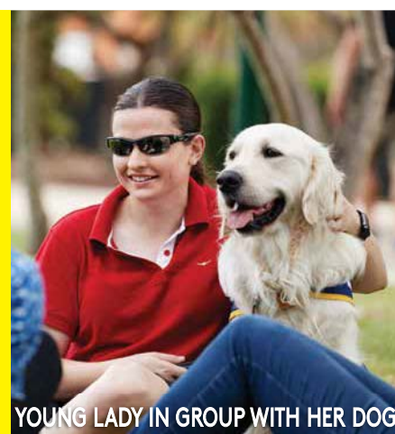
YOUNG LADY IN GROUP WITH HER DOG

Feeling safe and confident in your surroundings allows you to engage fully with the people and activities around you. Vision Australia gives people the support and confidence to get out and about, supporting social activities with family and friends.