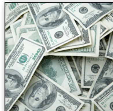
Move from Success to Significance