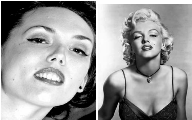
Figure 7 (left) Erica von Kleist, (right) Marilyn Monroe

Her hairstyle and makeup reminds me of Marilyn Monroe. In fact, one of the newly taken photos for the new website seems to model a famous Marilyn Monroe picture in the angle of the face, half-opened eyes, arch-shaped eyebrows, and slightly opened mouth. The image presented in these pictures is sexy and feminine yet classy.