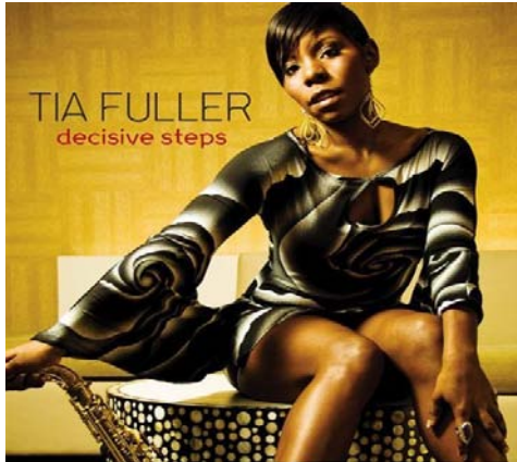
Figure 9 Tia Fuller, Decisive Steps

The third CD, Decisive Steps (2010), features the cover photo of Fuller's new look.