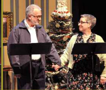
THE MAN WHO CAME TO DINNER (MAY)