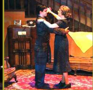
BROADWAY BOUND (APR)