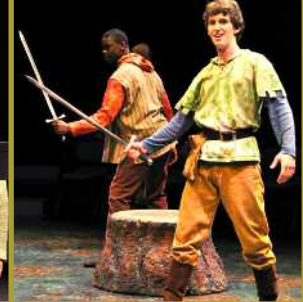
ROBIN HOOD (MAY)