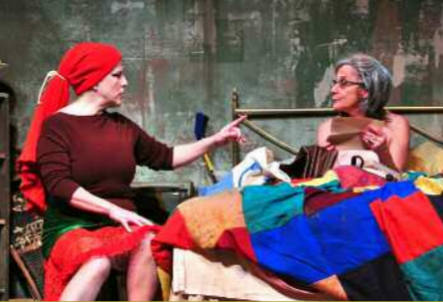
GREY GARDENS, THE MUSICAL (JAN-FEB)