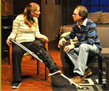
TIME STANDS STILL (APR-MAY)