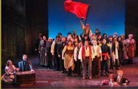
LES MISÉRABLES (SEPT-OCT)