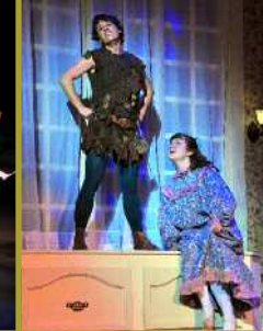
PETER PAN (NOV-DEC)