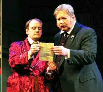
SHERLOCK HOLMES: THE FINAL ADVENTURE (FEB)