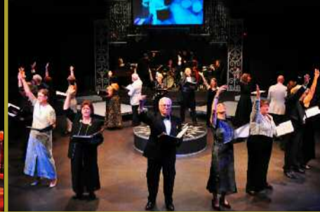
SONGS FROM THE SILVER SCREEN (NOV)