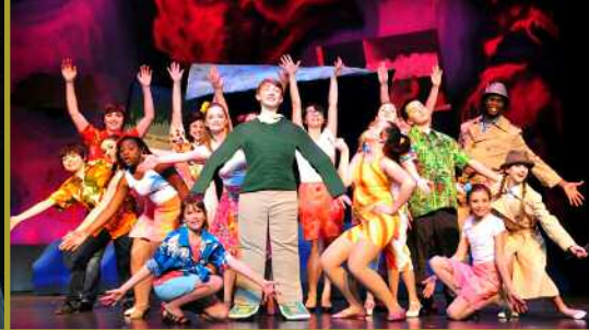
THE MUSICAL ADVENTURES OF FLAT STANLEY (MAR)