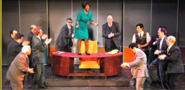
HOW TO SUCCEED IN BUSINESS WITHOUT REALLY TRYING (MAY)