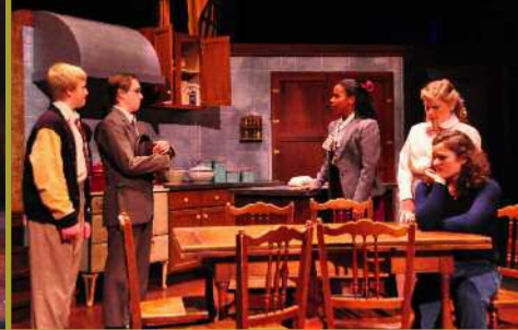
NANCY DREW: GIRL DETECTIVE (OCT)