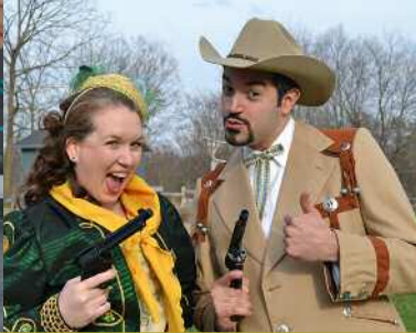
ANNIE GET YOUR GUN PHOTO SHOOT