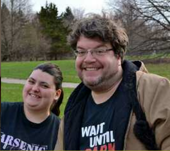
ANNIE GET YOUR GUN PHOTO SHOOT