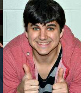
ANNIE GET YOUR GUN REHEARSAL