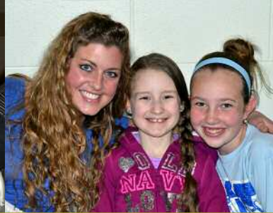
ANNIE GET YOUR GUN REHEARSAL