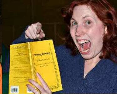
BEHIND THE SCENES BOEING BOEING