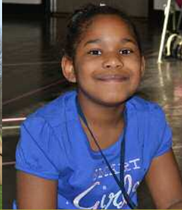
ACADEMY OF THEATRE ARTS SPRING BREAK DAY CAMP