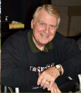
BEHIND THE SCENES IRENA'S VOW