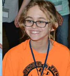
ACADEMY OF THEATRE ARTS SPRING BREAK DAY CAMP