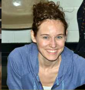
ANNIE GET YOUR GUN REHEARSAL