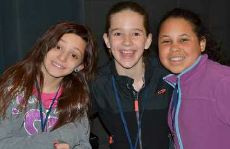
ACADEMY OF THEATRE ARTS SPRING BREAK DAY CAMP